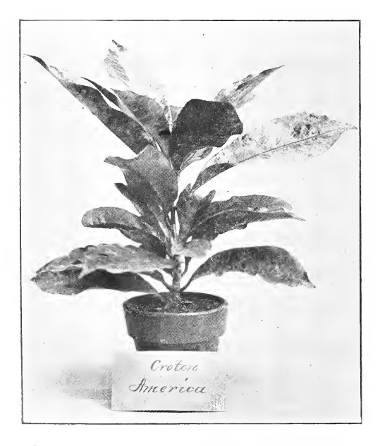
NEW SEEDLING CROTON AMERICA