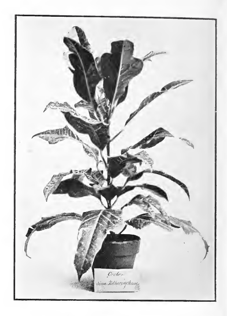
NEW SEEDLING CROTON JEAN FOTHERINGHAM