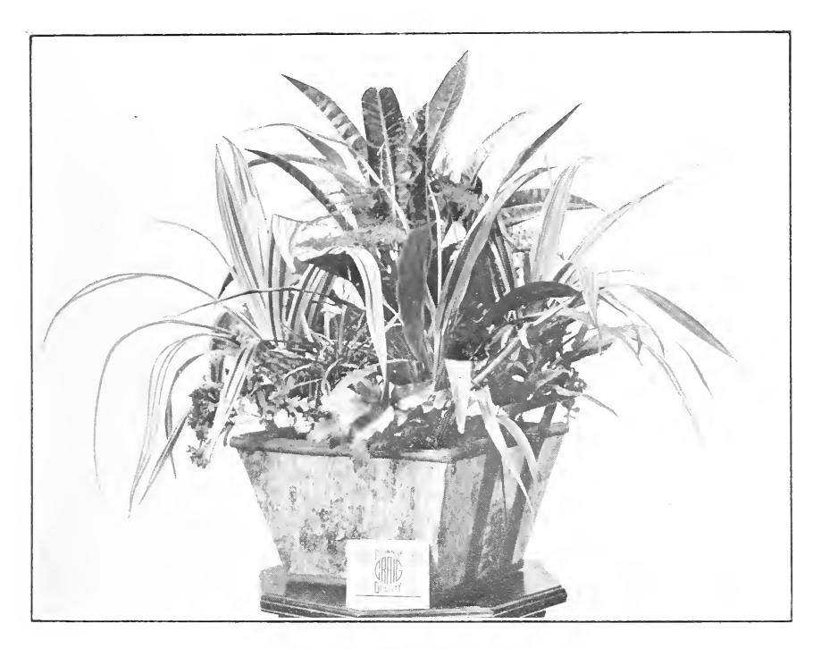
PLANT COMBINATION BASKET

The cut on this page will give some slight idea of the new special Croton combination that we have prepared for this Fall trade: in a white cedar box, 12 inches square, 6 inches deep, covered with birch bark, and trimmed in brown. The ivy shown is the small leaf variety. The crotons are of very high color, artistically arranged and are well established. We are sure these will prove to be excellent sellers. $5, $6, $7.50 and $10 each.