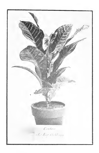
NEW SEEDLING CROTON AUGUST POEHLMANN