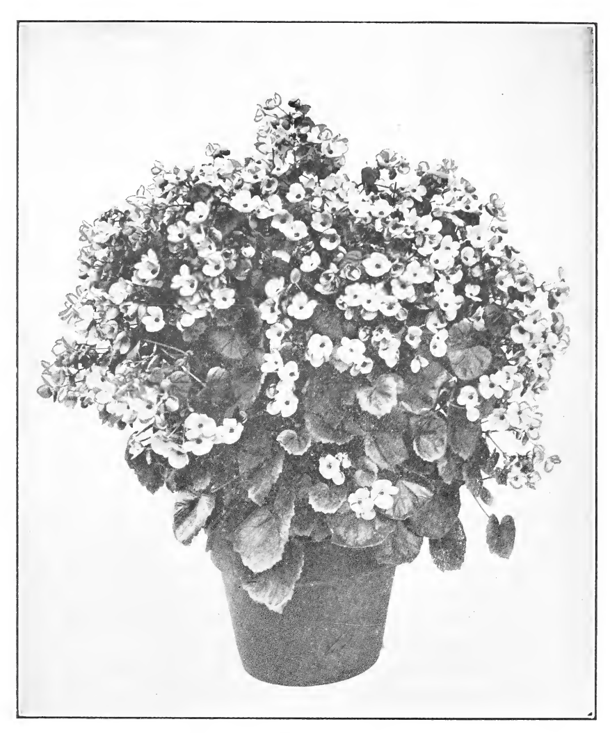
BEGONIA GLORIE DE LORRAINE