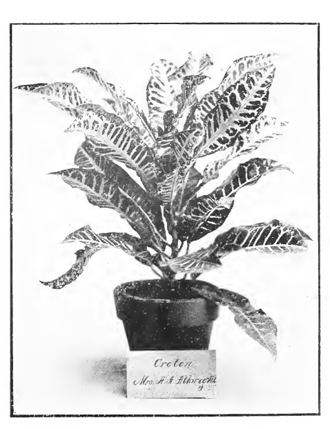
NEW SEEDLING CROTON MRS. A. A. ALBRIGHT

Well-colored plants. Large stock. 2½-inch and 3-inch pots . . . . . . . . . . . . $30 per 100 4 -inch pots . . . . . . . . . $6 per doz.; $45 per 100