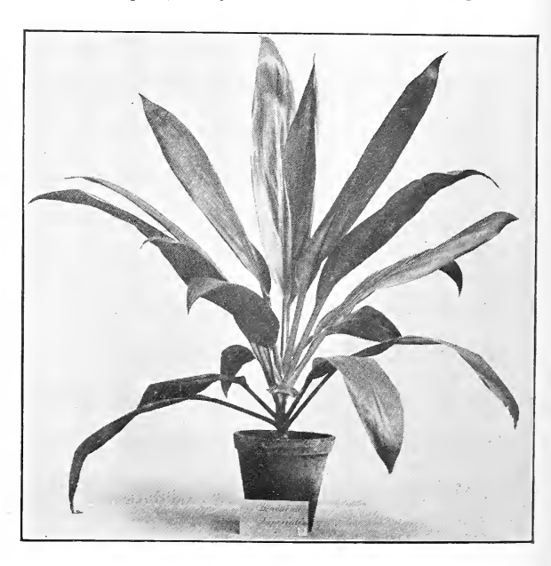
DRACAENA IMPERIALIS (RARE)