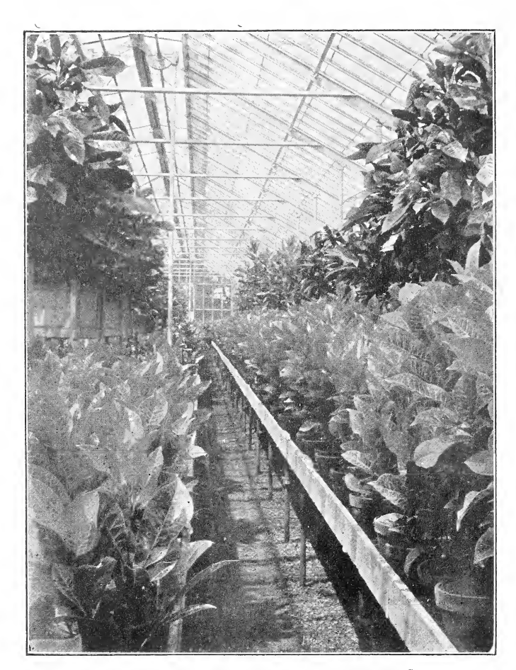
A HOUSE OF CRAIG QUALITY CROTONS