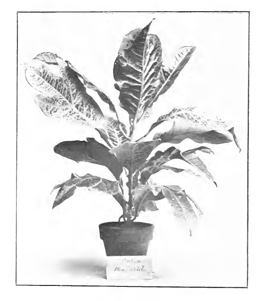
CROTON MONS, KOHL