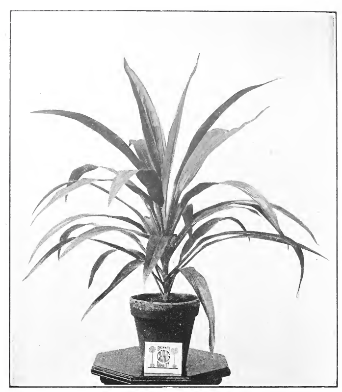
DRACAENA LORD WOLSELEY