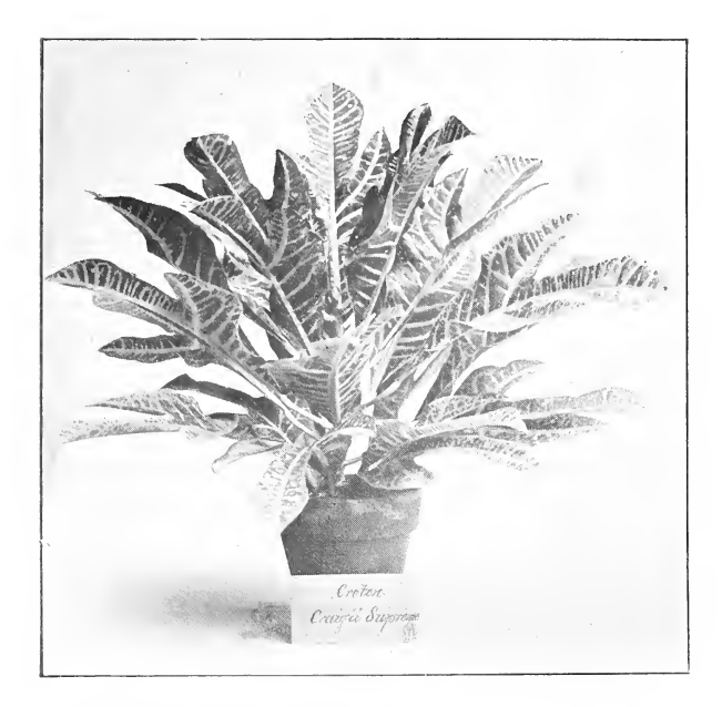
NEW SEEDLING CROTON CRAIGH SUPREME