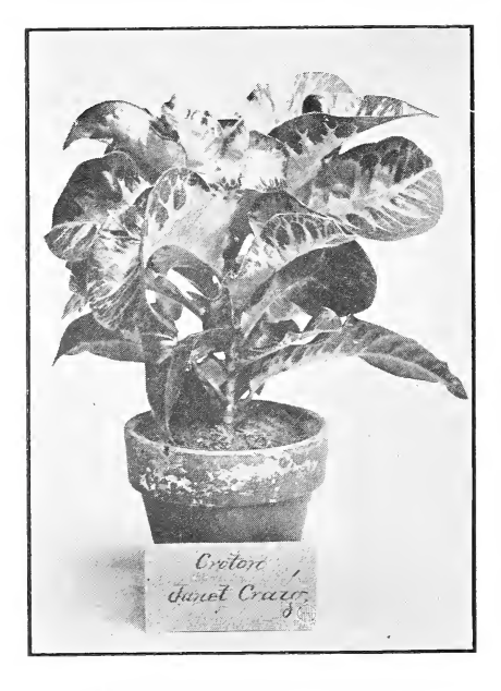
NEW SEEDLING CROTON JANET CRAIG