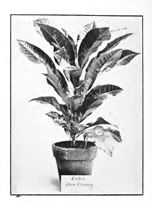
CROTON PERE CHARON

The plant of the century. Positively the best house and porch plant to date. Our stock of this wonderful plant this year is finer than we have heretofore offered. It will surely give satisfaction.