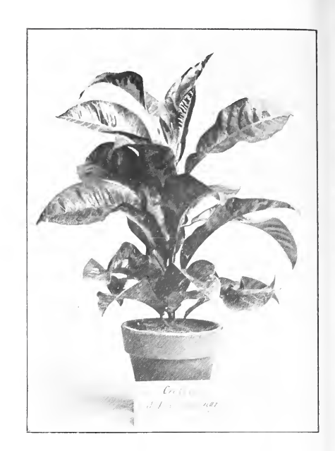
NEW SEEDLING CROTON JOHN FARQUHAR