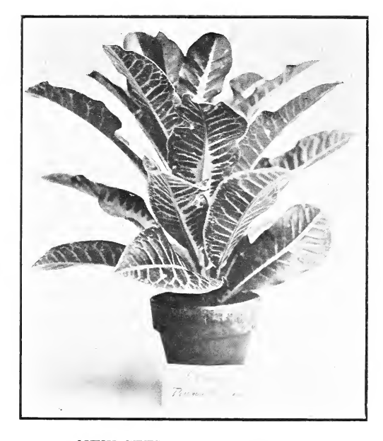
NEW SEEDLING CROTON RODMAN WANAMAKER