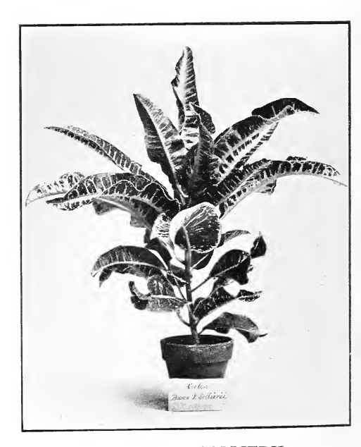
CROTON B. F. SOLLIERII

We are growing over 50,000 cut blooms of Chrysanthemums in all the best commercial varieties. Ready October 1st and until December 1st. Make arrangements with us to have your "Cut Mums" supplied by us. Either daily or weekly shipments. Lowest market prices.