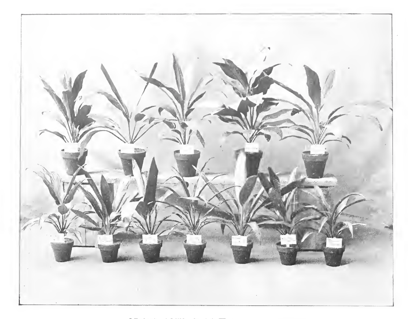
12 NEW AND RARE DRACAENAS