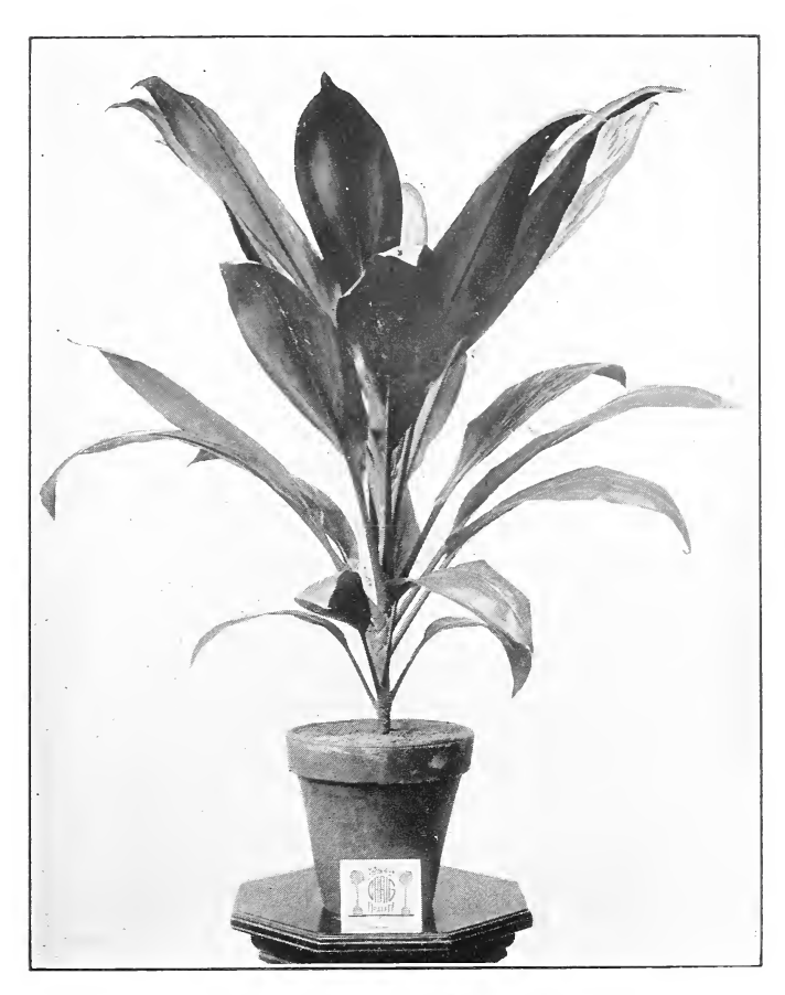
DRACAENA DE SMETIANA