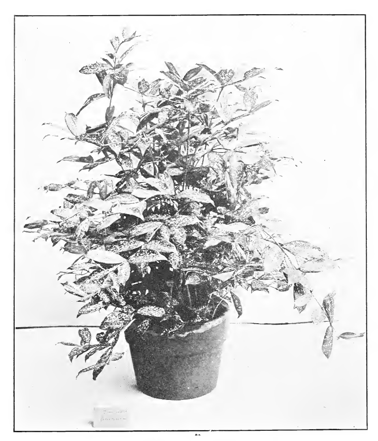
DRACAENA KELLERIANA (NEW)