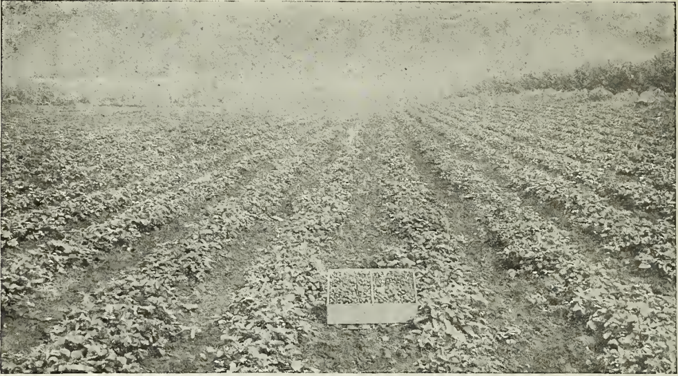
This is the acre of Progressive that produced $414.00 net from July to November 14th the same year planted. This field was at its best September 1st. Photo taken August 12, 1915.