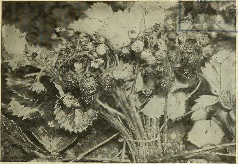
Plant of Progressive, Photographed August 12th, 1915.—We had plenty of plants like this.