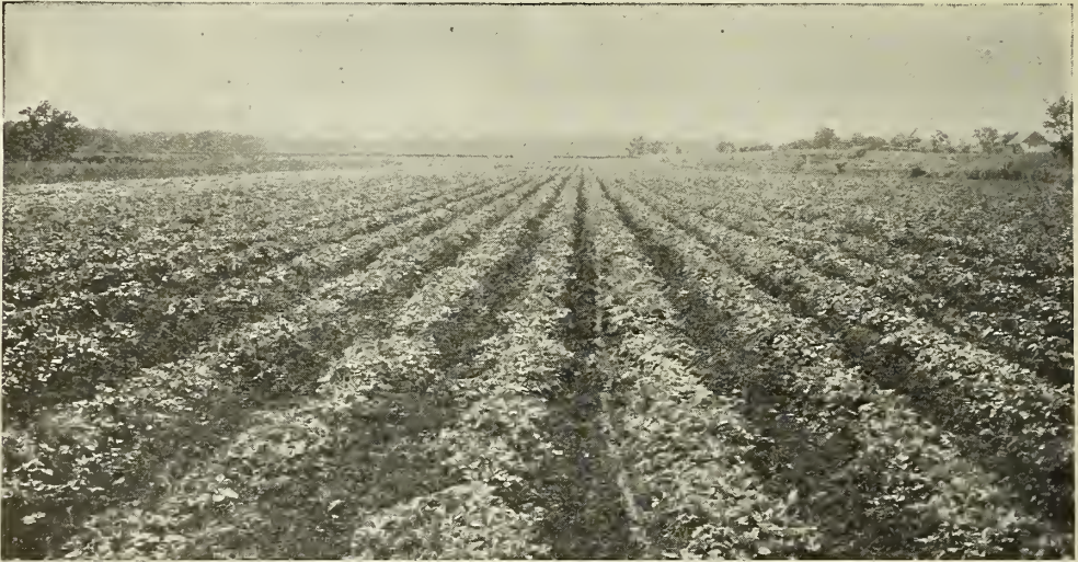
Forty Acres of Strawberries photographed August 12, 1915. Good weather continues and all ground is covered with plants now. Progressive on the left and Dunlap on the right.

We want to doubly emphasize the fact that our plants are true to name and pure, but will not be responsible for more than the original cost should any prove otherwise. As to our reliability, we will refer you to the State Bank of Holton, any Express Company, or any of our customers.