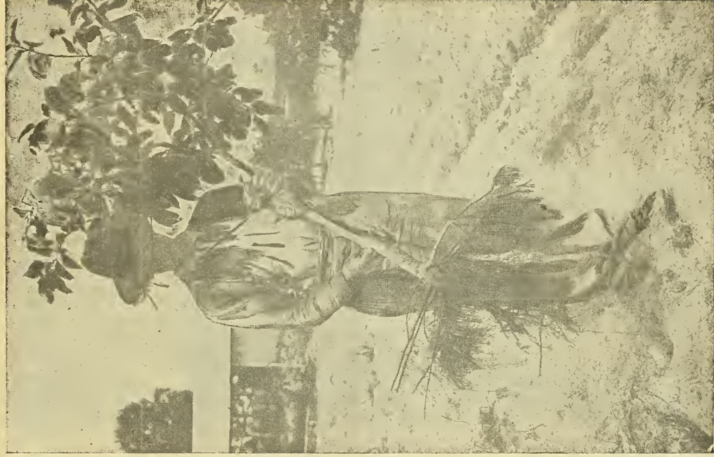
SPLENDID ROOT SYSTEM