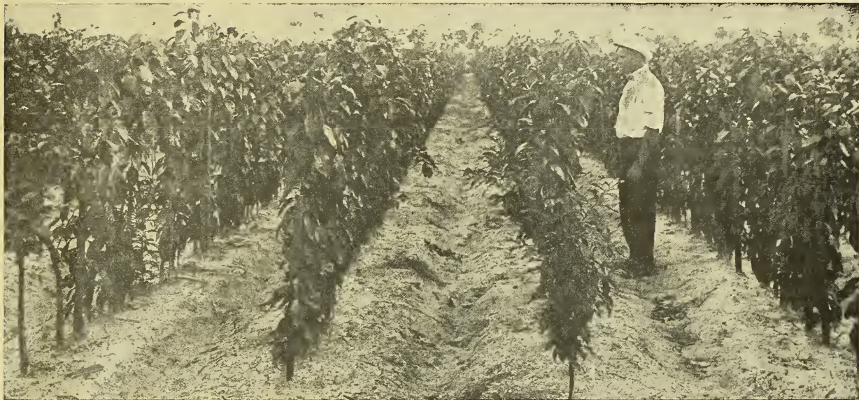
ONE YEAR OLD, FELLSMERE, FLORIDA.