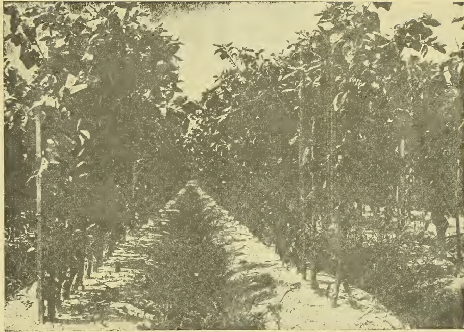
TWO YEARS OLD, FELLSMERE, FLORIDA.