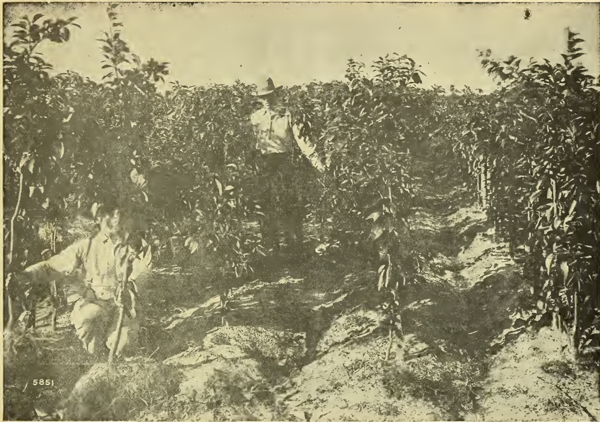
CONKLING TREES, FELLSMERE, FLORIDA.