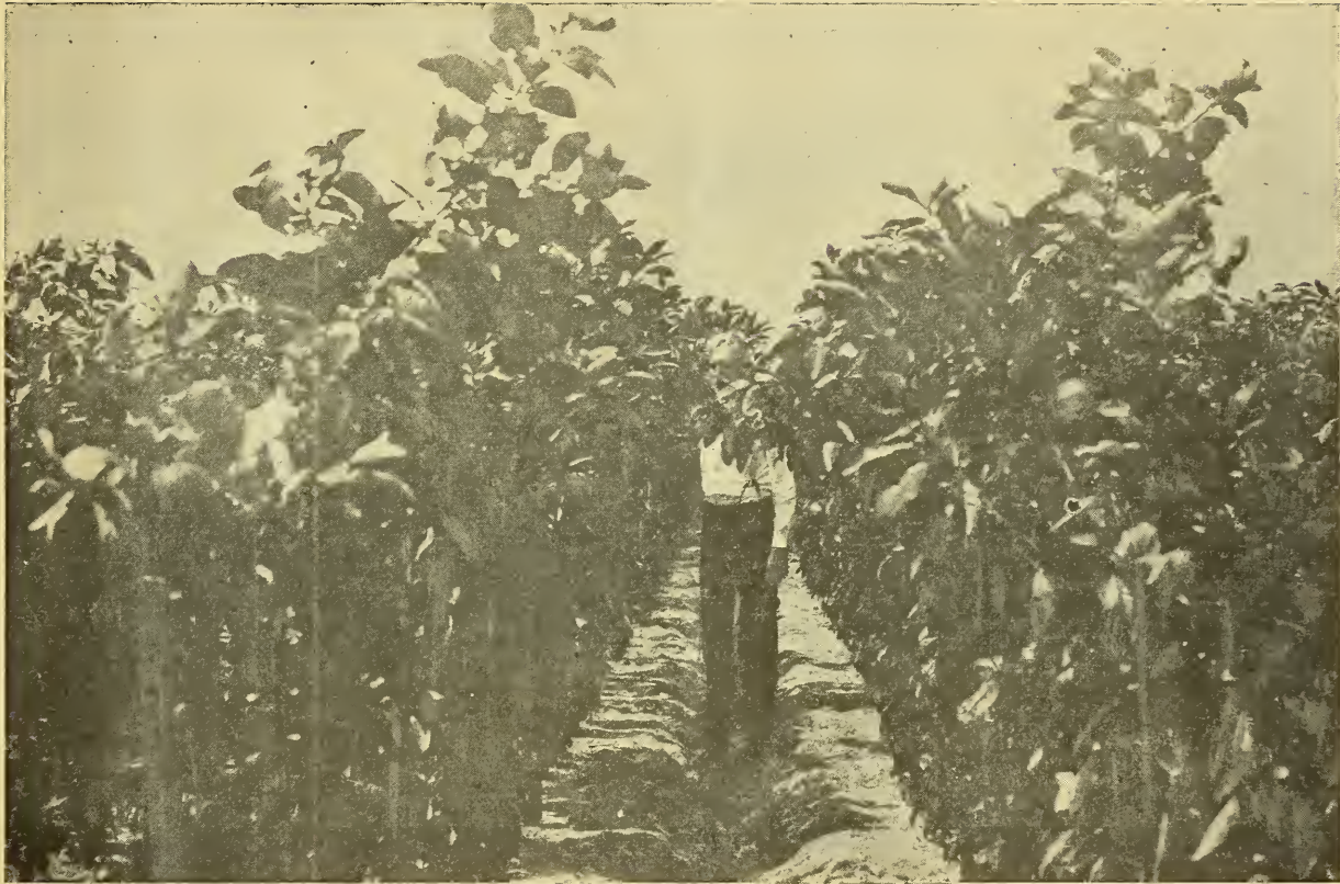
TWO YEARS GRAPE-FRUIT, FELLSMERE, FLORIDA.