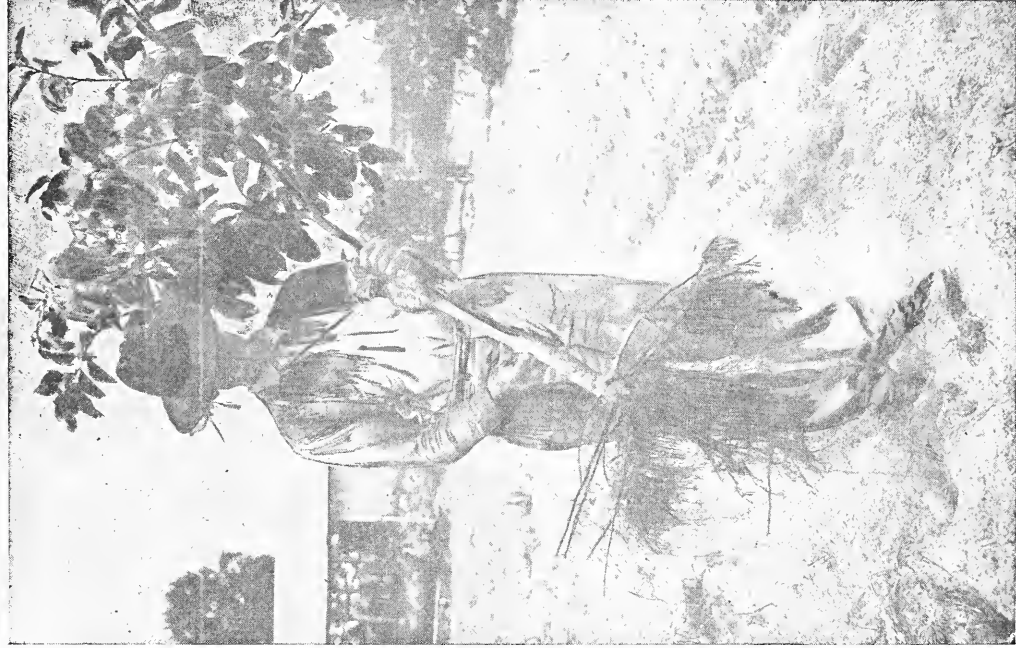
SPLENDID ROOT SYSTEM