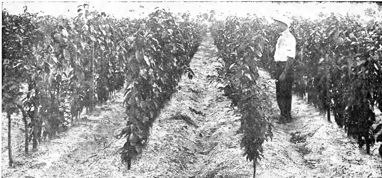
ONE YEAR OLD, FELLSMERE, FLORIDA.