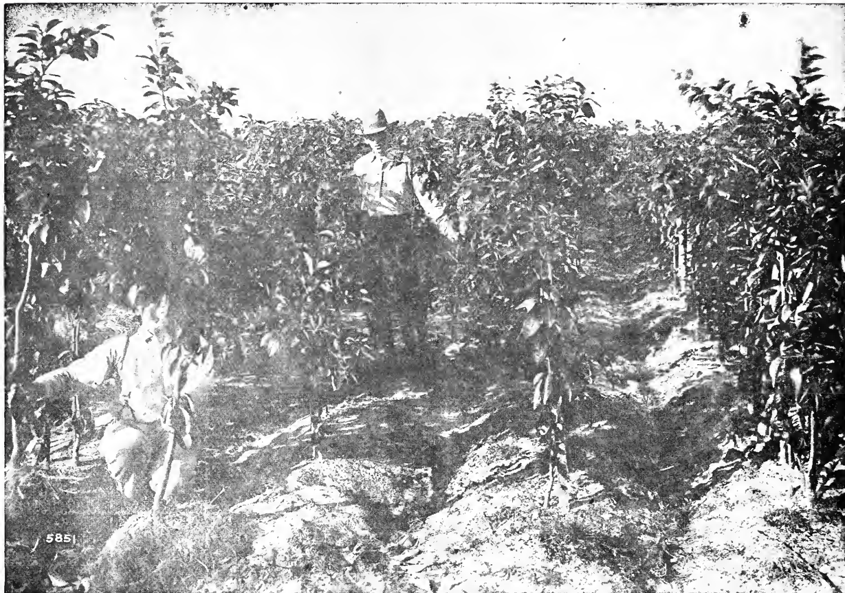
CONKLING TREES, FELLSMERE, FLORIDA.