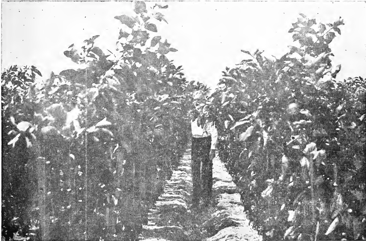
TWO YEARS GRAPE-FRUIT, FELLSMERE, FLORIDA.