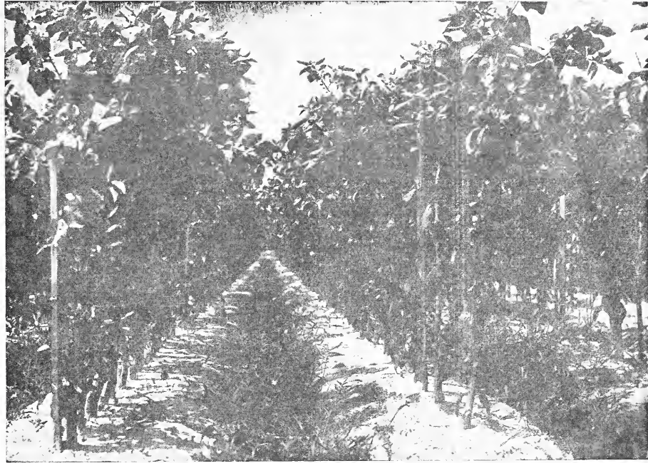
TWO YEARS OLD, FELLSMERE, FLORIDA.