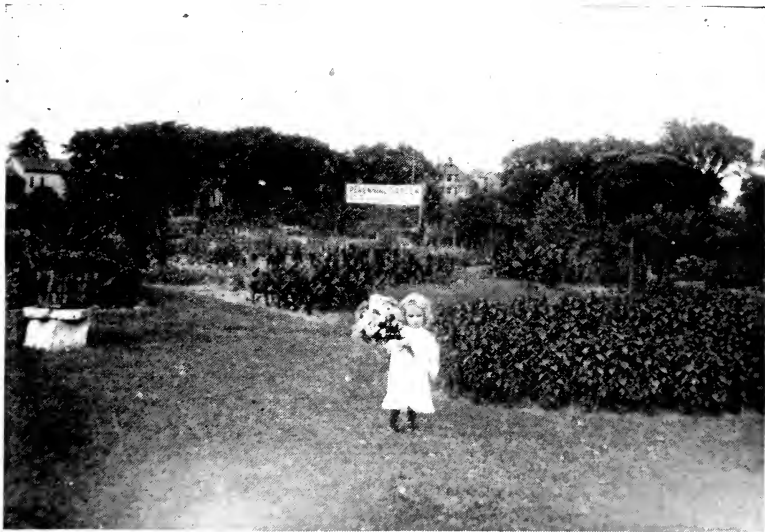
THE PERENNIAL GARDEN AS VIEWED FROM THE NORTHWESTERN ELEVATED ROAD