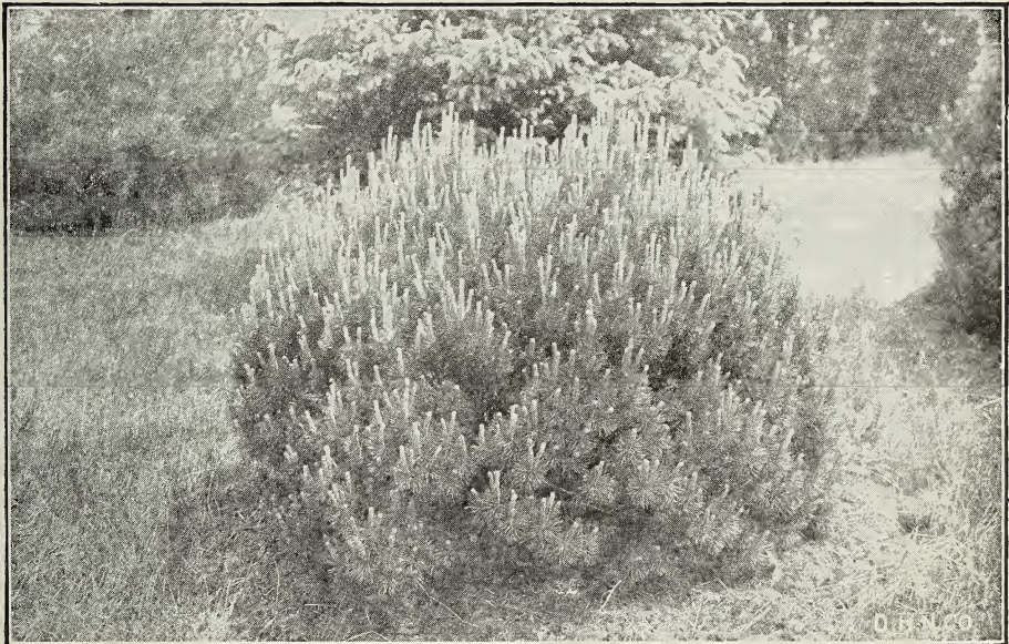
Pinus Mugho—Dwarf Mugho Pine (true type).