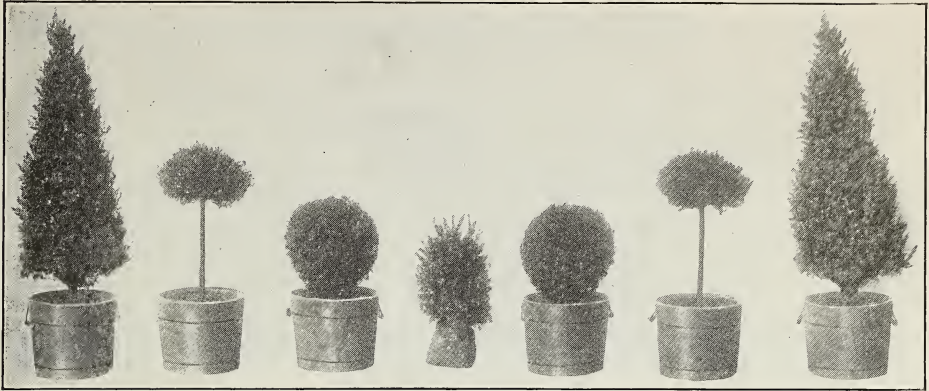
Pyramid Standard Ball Shaped Bush Ball Shaped Standard Pyramid