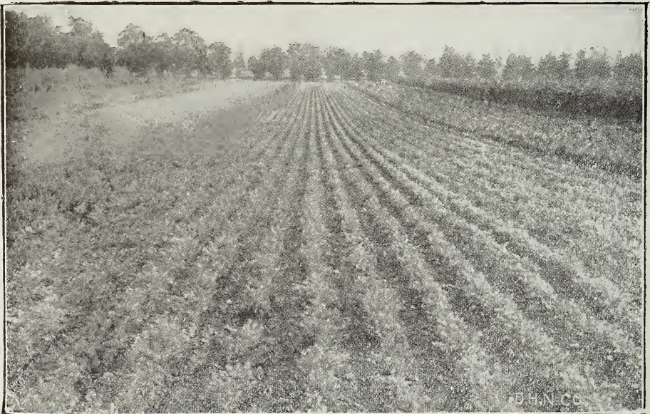
View in Hill Nursery—In this section are shown young transplanted Douglas Fir in foreground, Norway Spruce to the left and to the extreme right American Arbor Vitae.