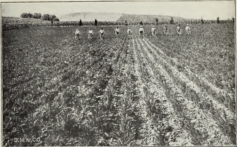
The hand cultivators at work in block of 1,000,000 transplanted Norway Spruce.