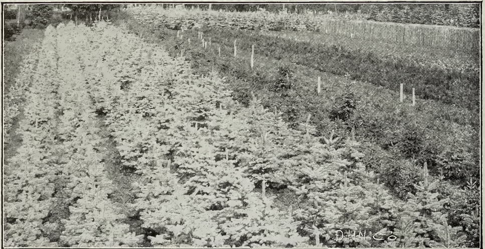
Blocks of Blue Spruce Trees in Hill Nursery.