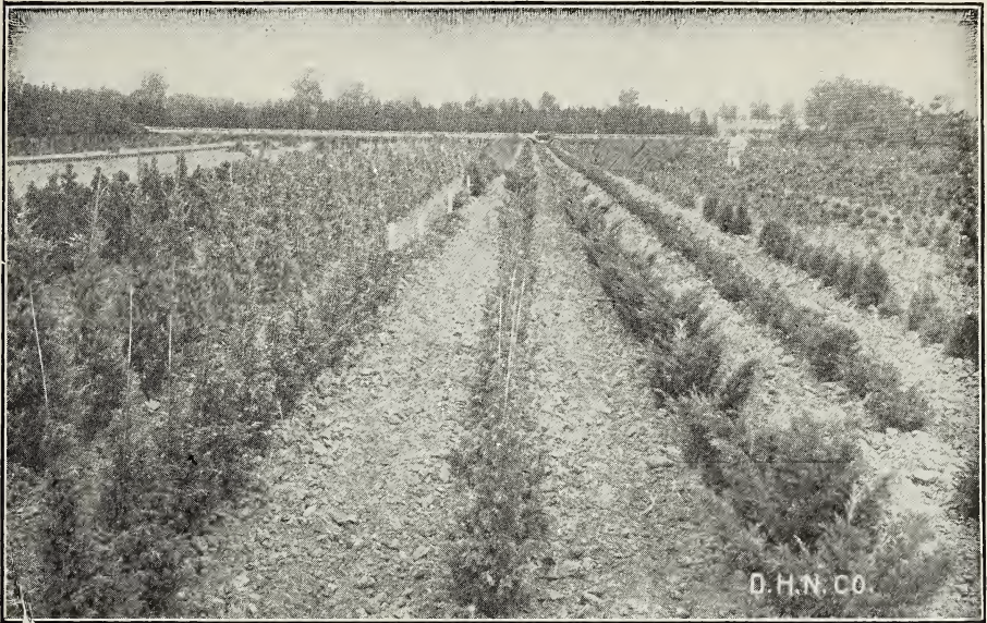
Blocks of Specimen Evergreens, principally Junipers, Hemlocks and Pines.