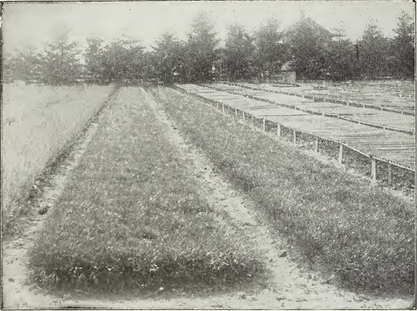
Seedling Beds in Hill Nursery. European Larch at left. Scotch Pine in center. One year White Pine under racks at right.