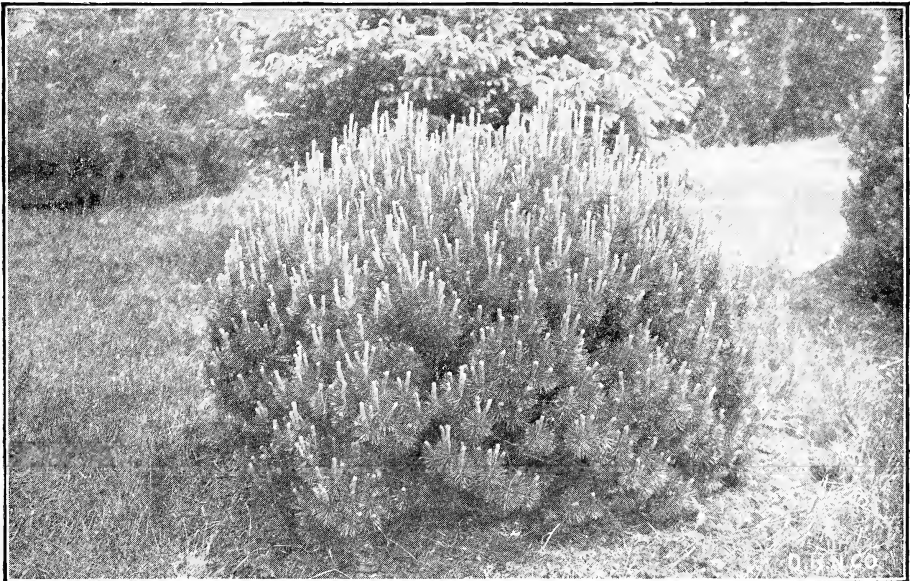
Pinus Mugho—Dwarf Mugho Pine (true type).