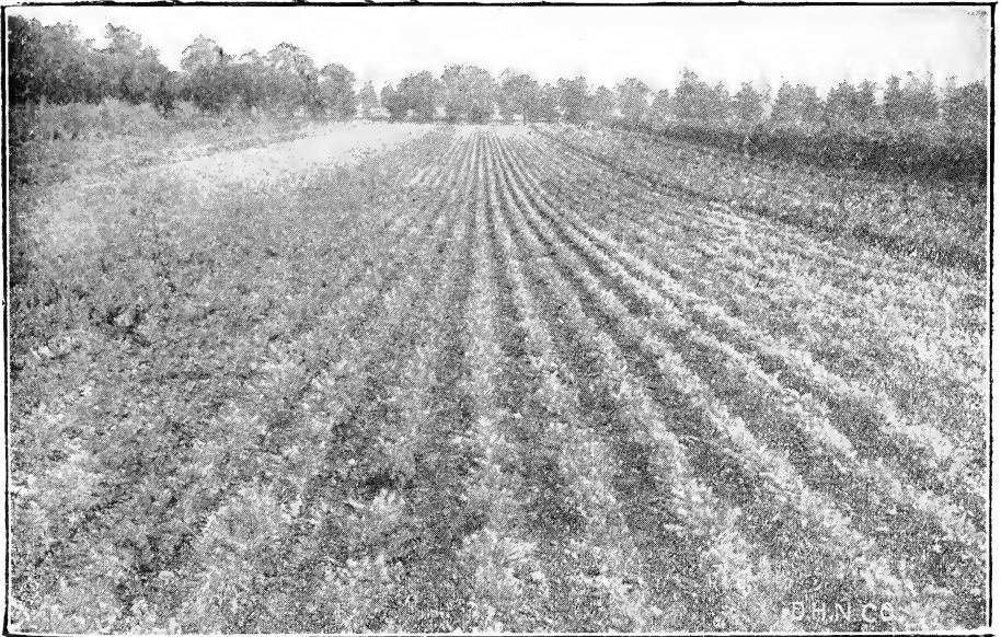
View in Hill Nursery—In this section are shown young transplanted Douglas Fir in foreground, Norway Spruce to the left and to the extreme right American Arbor Vitae.