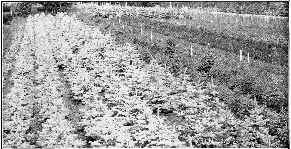
Blocks of Blue Spruce Trees in Hill Nursery.