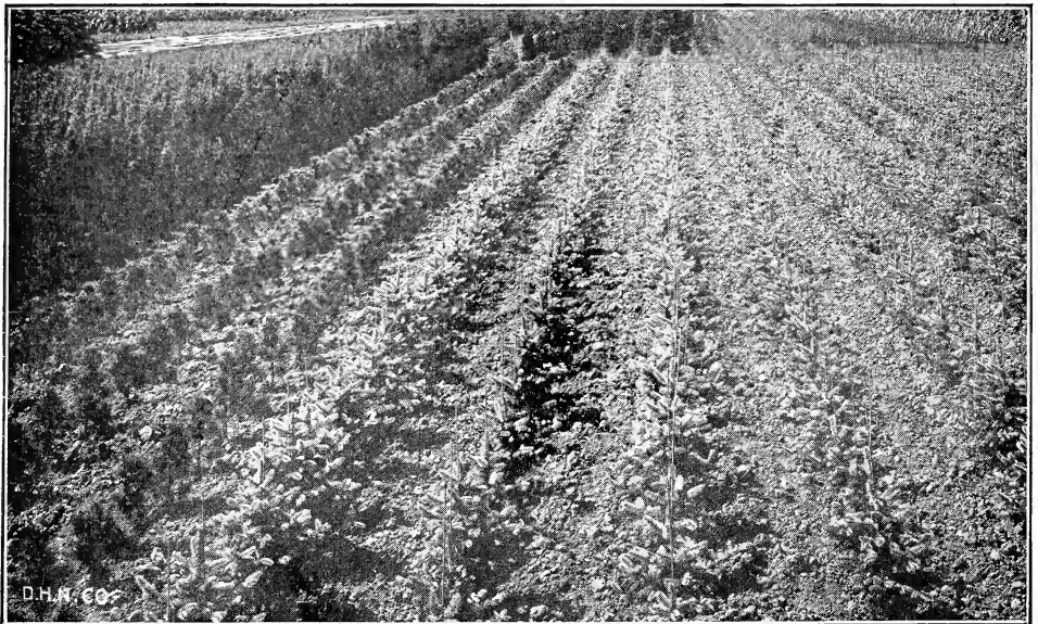
Blocks of Specimen Evergreens in Hill Nursery. Blue Spruce in foreground.