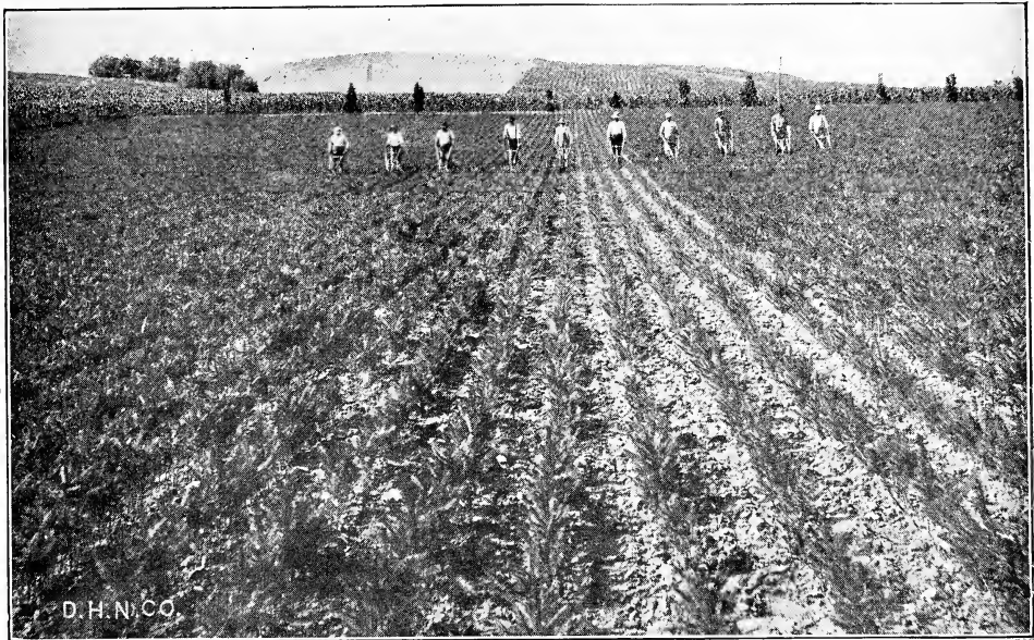
The hand cultivators at work in block of 1,000,000 transplanted Norway Spruce.