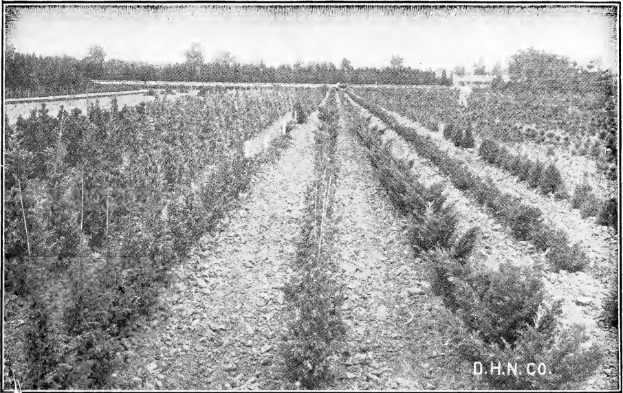
Blocks of Specimen Evergreens, principally Junipers, Hemlocks and Pines.