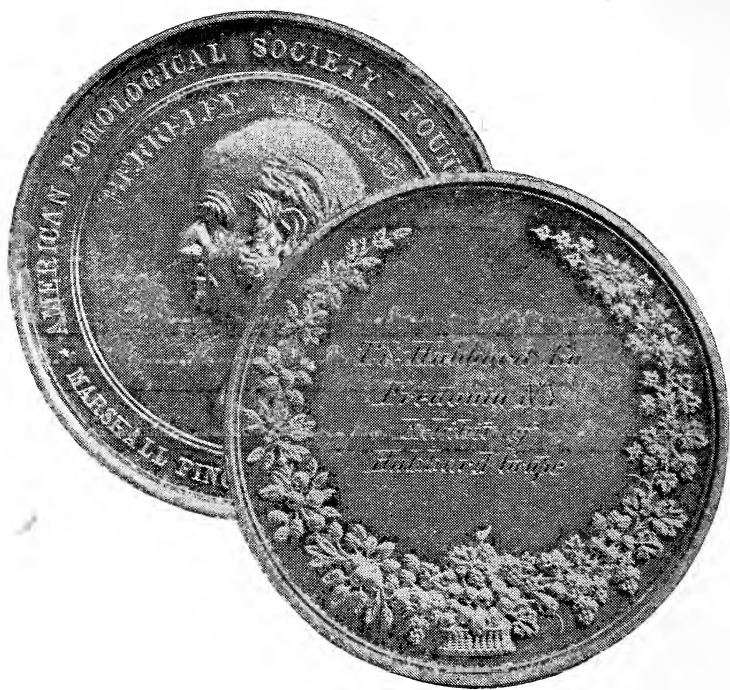
The Hubbard Grape was awarded the Wilder Silver Medal by the American Pomological Society at its meeting in Berkeley, Cal., 1915