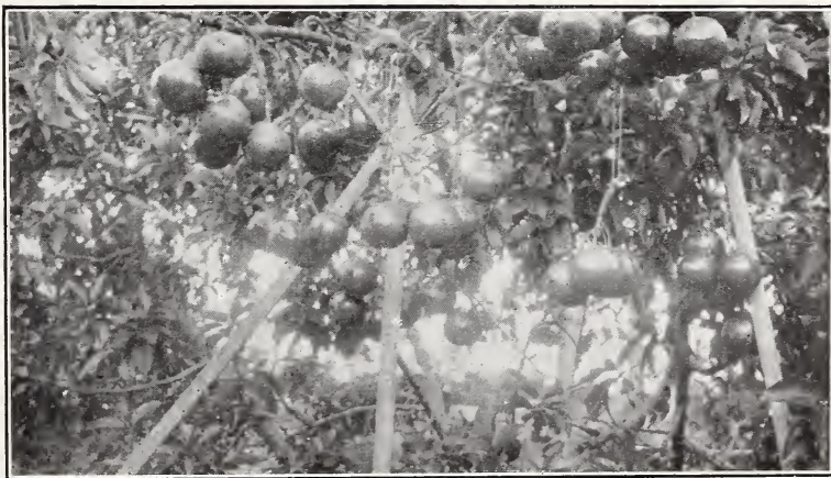
THIS PHOTO WAS TAKEN FROM ABOVE TREE. 59 FRUIT ON THIS LIMB.