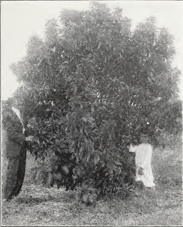
FOUR-YEAR-OLD TRAPP AVOCADO IN LEE COUNTY. 74 PEARS.

tight seed in most cases, which makes it a much better shipper, as the Family invariably has a loose seed.