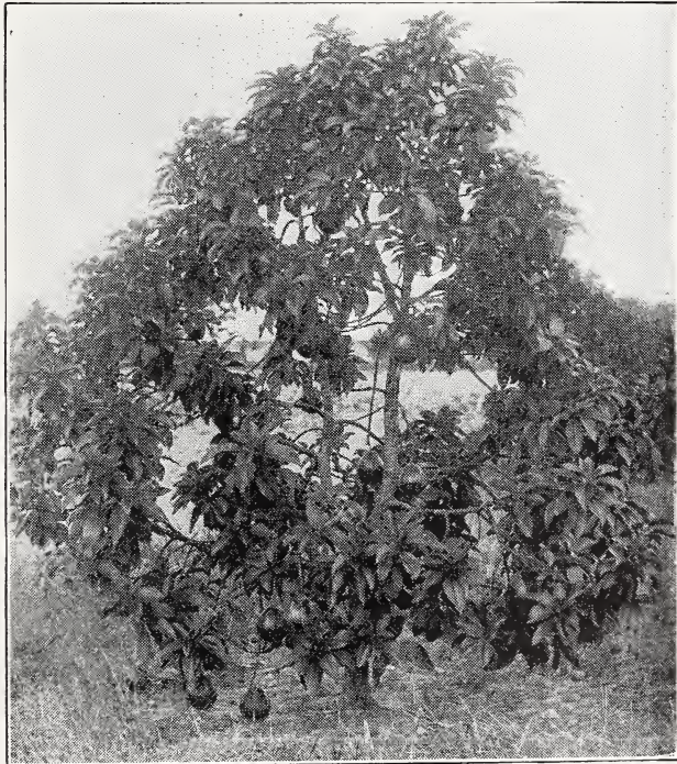
THREE-YEAR-OLD TRAPP AVOCADO IN LEE COUNTY. 56 PEARS.

I have a fine assortment of ferns in pots from 25c each up, suitable for table decoration, or for verandas. Also open ground stock for ferneries.