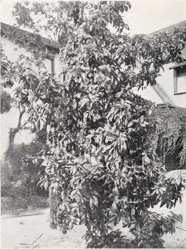
SEVEN-YEAR-OLD FAMILY AVOCADO AT WEST PALM BEACH.