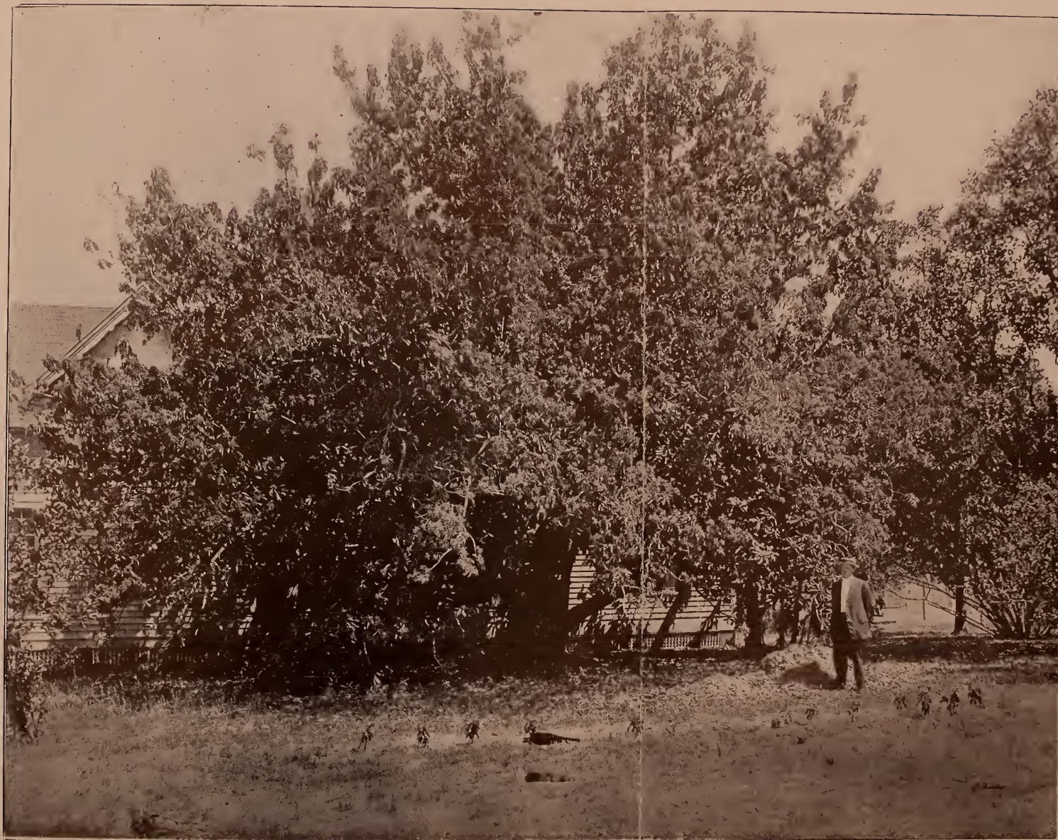
This Tree is 5 Ft. in Diameter, With Height of 40 Ft. and Spread of 60 Ft. Average Yield 2,500 Fruit, Weighing 1½ Pounds Each. It Belongs to B. C. Bass, of Dunedin, Florida, and is 50 Years Old. Probably the Largest Tree in the State. Was Cut Back in 1895.