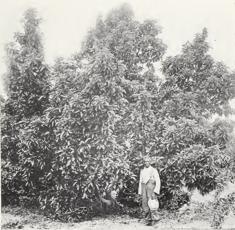
TWELVE-YEAR-OLD TRAPP AVOCADO AT WEST PALM BEACH.