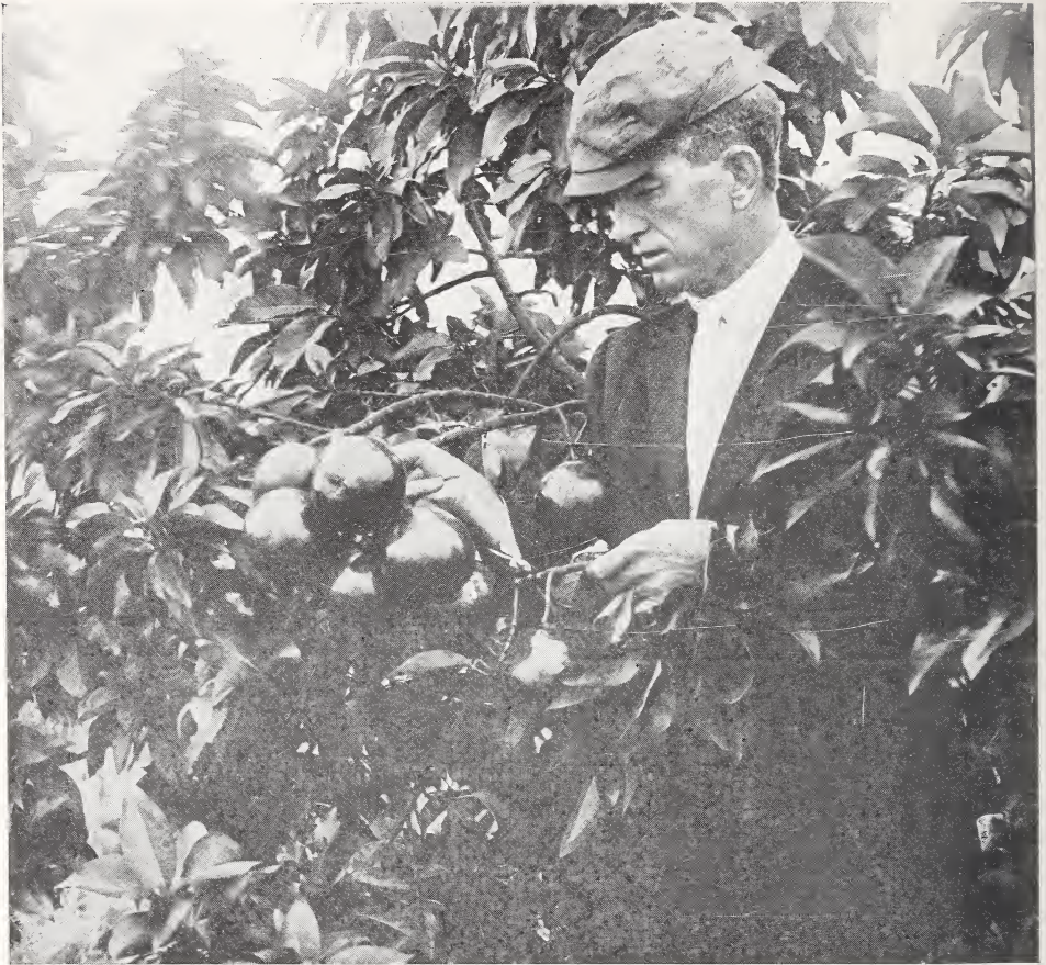
ANOTHER VIEW OF THE FOUR-YEAR-OLD TRAPP AVOCADO.

averaging somewhat smaller than Trapp. Seed small and tight-fitting. Skin rough. Quality very good. $3.00 each. (Supply very limited.)