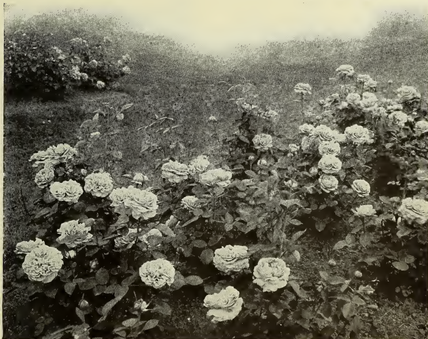
Paul Neyron Roses