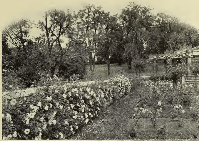
Hardy Climbing Roses, tub-grown, 6 to 7 feet in height