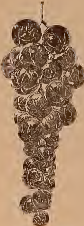
Long Bunch Holland The hardiest, heavy grower. The most reliable of all Currants.

Beta Grapes 3 yr. 15c each. $5.00 per 50.