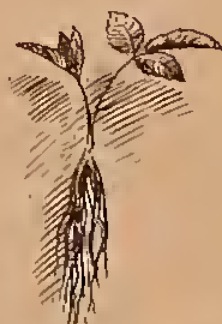
Old Process Plants

The method of producing what we call the old process plant is as follows, a field of plants is put out in the spring and allowed to form new plants the same season. Now the trouble with this method is that the parent plant has to struggle along a part of the season to make a life of it itself, and is too weak and hasn't the time to form and mature a good strong healthy new plant, and especially so if the season has been unfavorable for trans- such poor success, but it was the best the poor weak parent plant could produce.