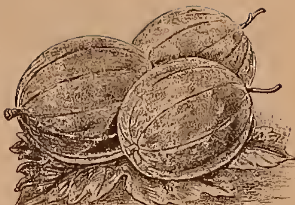
HOUGHTON — The Old Reliable More raised commercially than all other varieties.

Carrie Gooseberry 3 yrs. 15c each. Perfection Currant 3 yrs. 15c each.