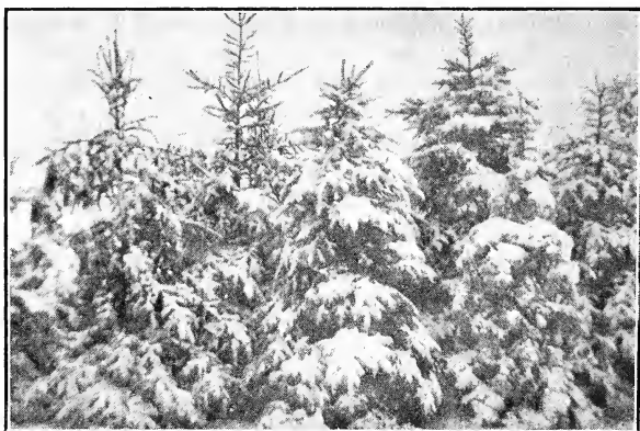
EVERGREENS IN WINTER