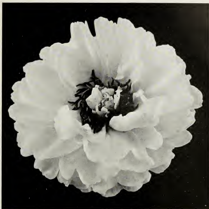
La Rosiere (See page 19)