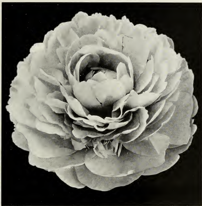
Asa Gray (See page 19)

MONS. MARTIN CAHUZAC (Dessert). Large to very large, full and well-formed flower. A solid ball of very deep maroon with blackish lustre, changing to metallic. Good erect habit. A variety of surpassing merit and by far the darkest Peony yet produced. Despite its high price we are obliged to omit it from the catalogue for a year or two every few years, as our stock soon becomes depleted. 1 year, $5.00.