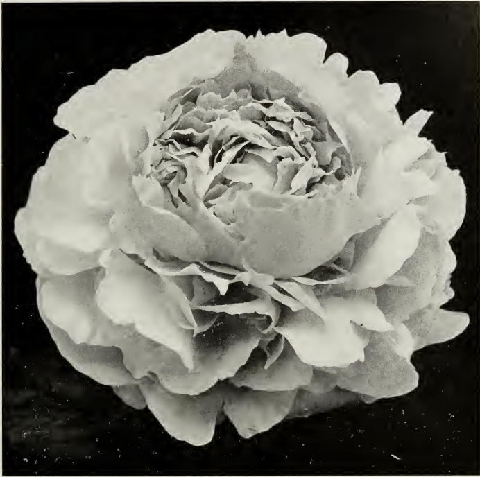
Pierre Duchartre (See page 25)