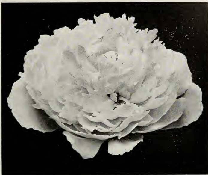
Avalanche (See page 22)