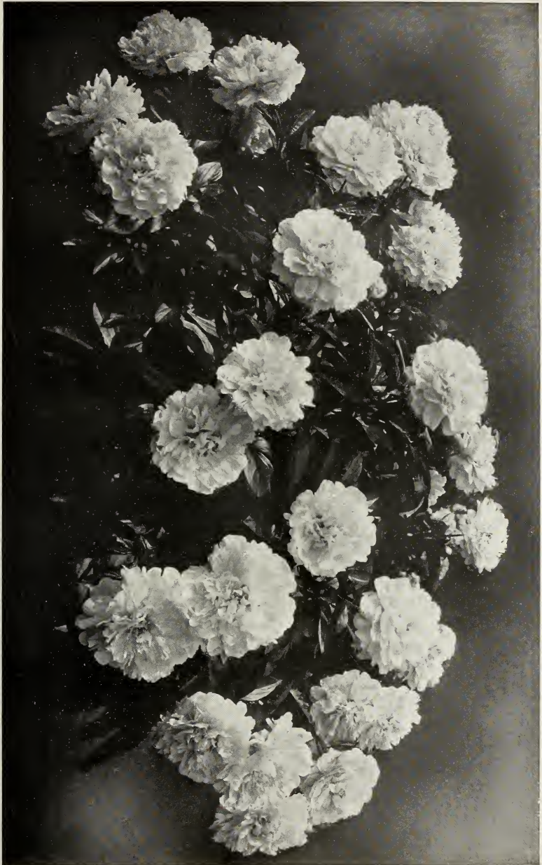
A SINGLE PLANT OF EUGENIE VERDIER (See page 22)