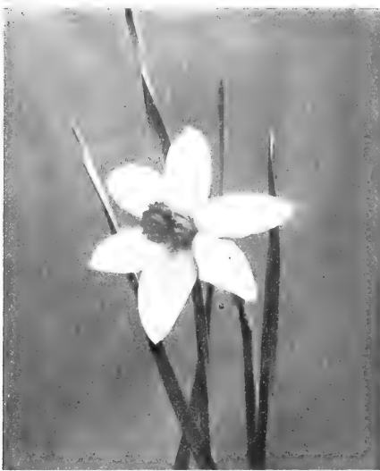
DUCHESS OF WESTMINSTER.

C. J. Backouse. A most attractive yellow winged flower with a long cup orange scarlet. One of a new class and very showy 16c $1.60