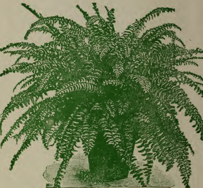
The "Boston Fern," Nephrolepis Bostoniensis .