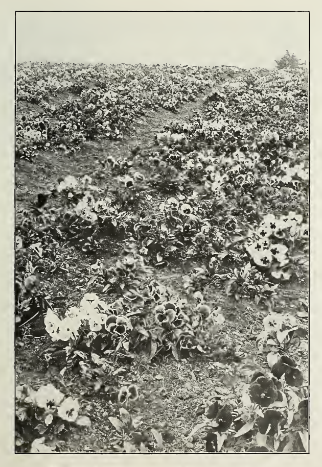
Mastodon Pansy Seed made in U. S. A.

All offers made subject to stock being unsold.