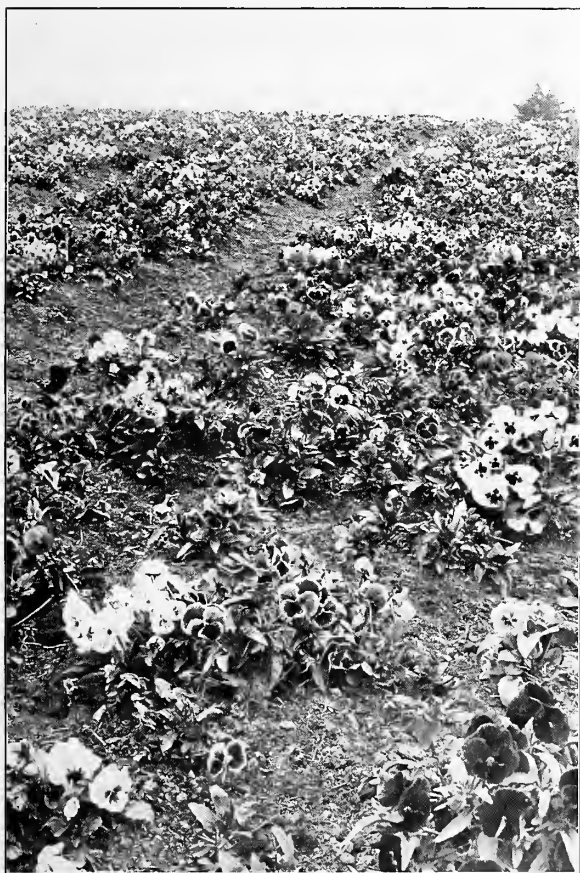
Mastodon Pansy Seed made in U. S. A.

All offers made subject to stock being unsold.