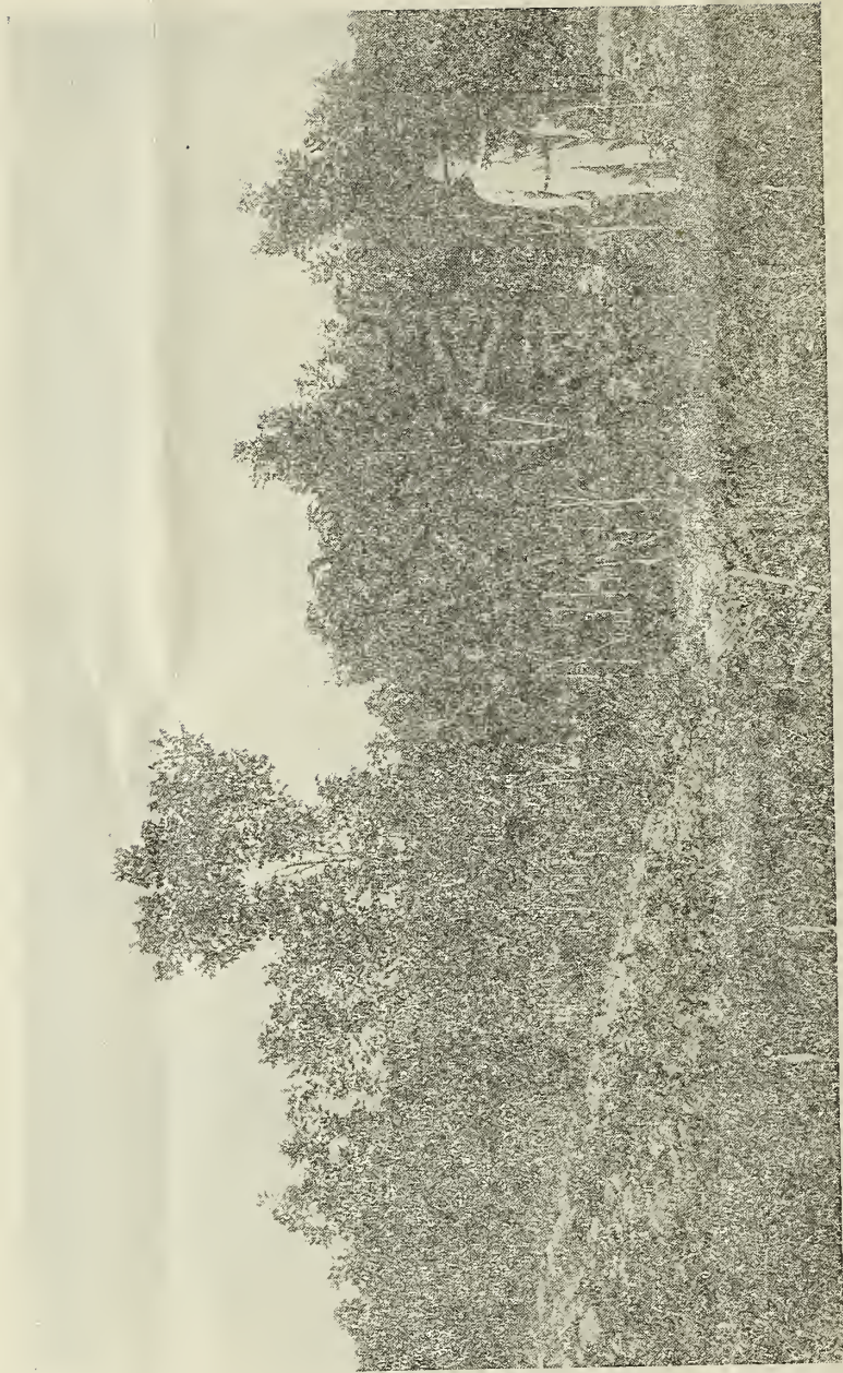
TWO YEAR OLD GRAFTED PECANS ON FOUR YEAR OLD ROOTS IN THE NURSERY ROWS, SOME OF WHICH ARE BEARING