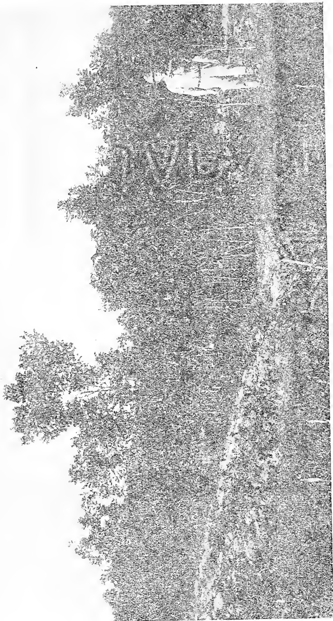
TWO YEAR OLD GRAFTED PECANS ON FOUR YEAR OLD ROOTS IN THE NURSERY ROWS, SOME OF WHICH ARE BEARING