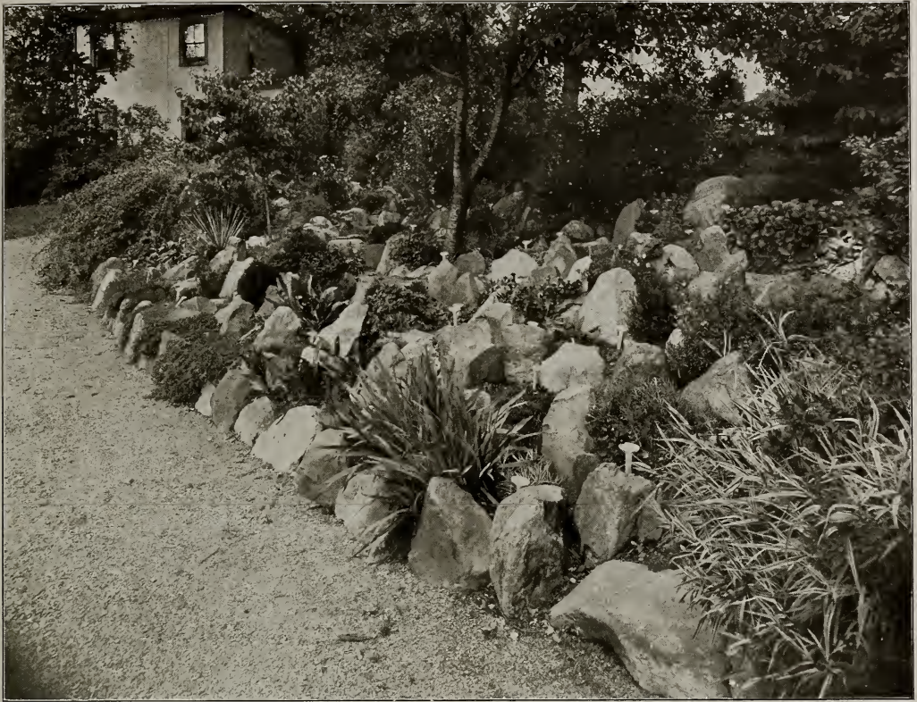
Perennial Rock Garden, Viewed from our Office.