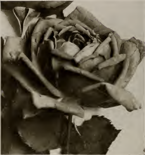
Gruss an Teplitz (See page 29).