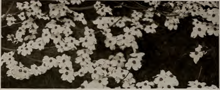
Cornus florida —White Dogwood. (See page 6.)