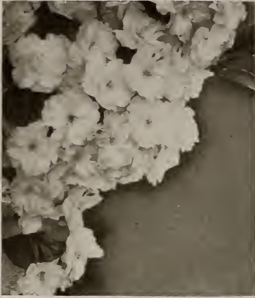
Double Flowered Almond. (See page 17.)