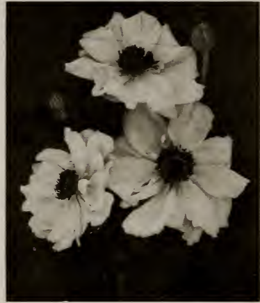
Anemone Japonica Japanese Wind Flower. (See page 52.)