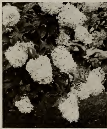
Hydrangea paniculata grandiflora. (See page 23.)