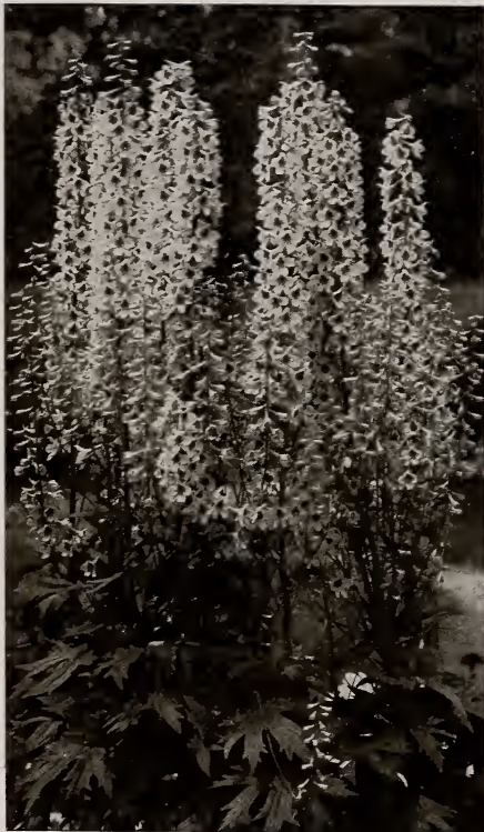
Delphinium—Larkspur. (See page 53.)