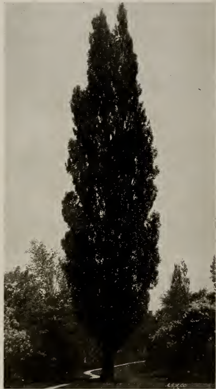
Populus fastigata (See page 10).