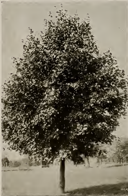
Acer sacharum (See page 3).