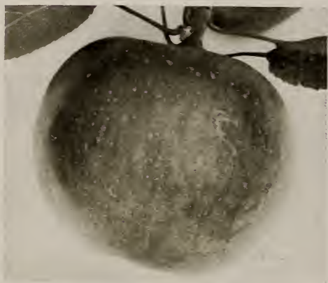
Wealthy Apple ( \frac{1}{2} size). (See page 59.)