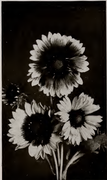
Gaillardia Grandiflora. (See page 53.)