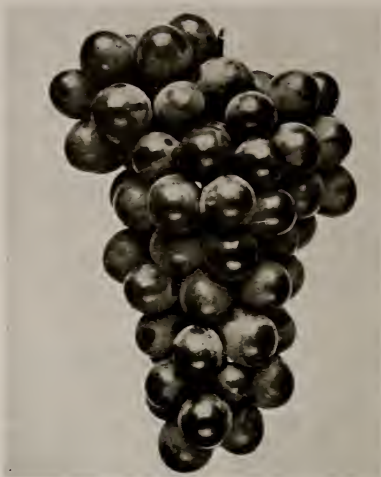
Moore Grape. (See page 63.)