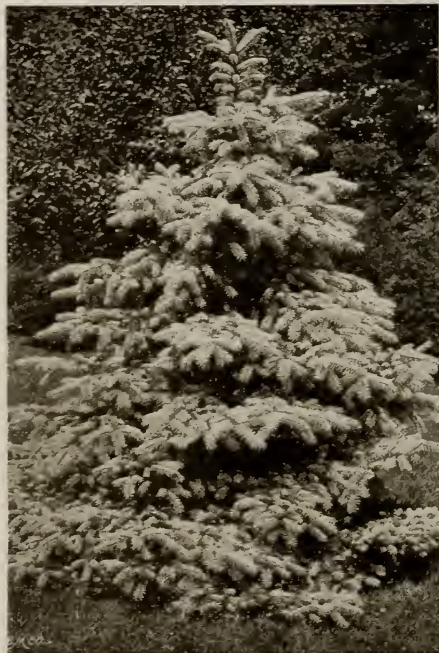
Picea pungens —Colorado Blue Spruce. (See page 41.)