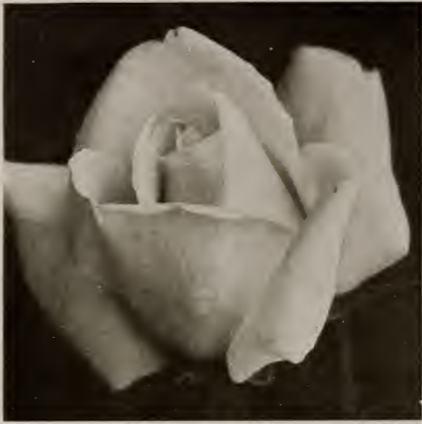
Frau Karl Drusehki (See page 27.)