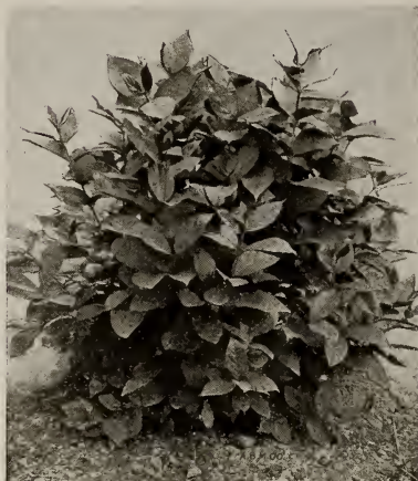
Calycanthus floridus. (See page 19.)