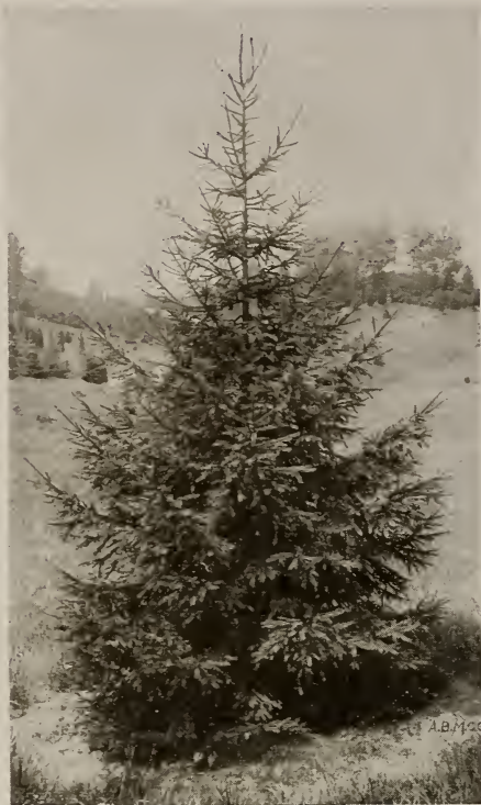
Picea excelsa —Norway Spruce. (See page 41.)