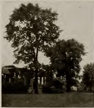
Ulmus Americana. (See page 13.)