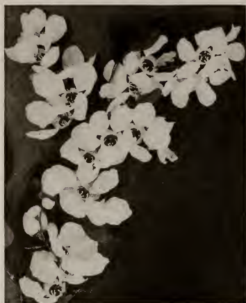
Exochorda Grandiflora. (See page 21.)