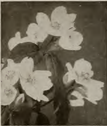
Philadelphus Grandiflora. (See page 25.)