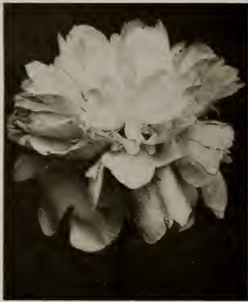
Peony, Festiva Maxima. (See page 55.)