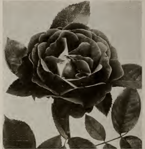
Gen. Jacqueminot (See page 29).