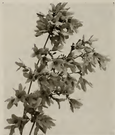
Forsythia Fortunei. (See page 21.)