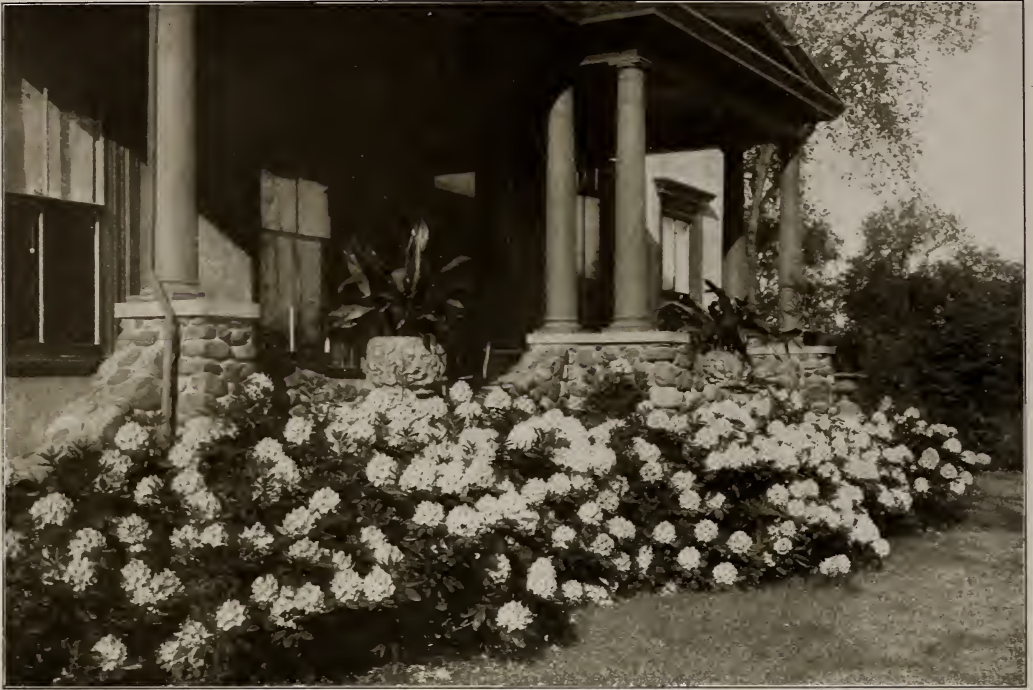
Planting of Rhododendron Everestianum —View from our Office.