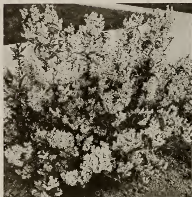
Deutzia Gracilis. (See page 20.)