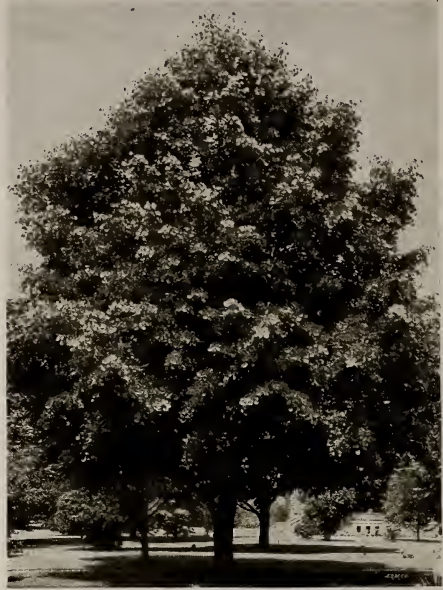
Tilia Americana (See page 13.)