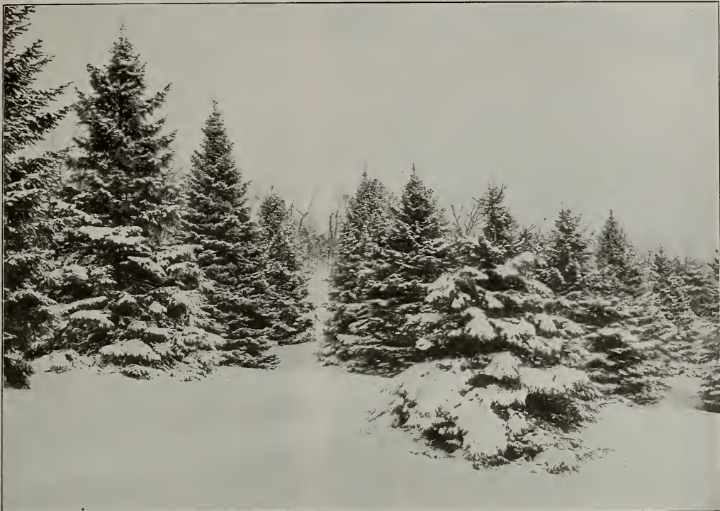
Winter View of Evergreens.