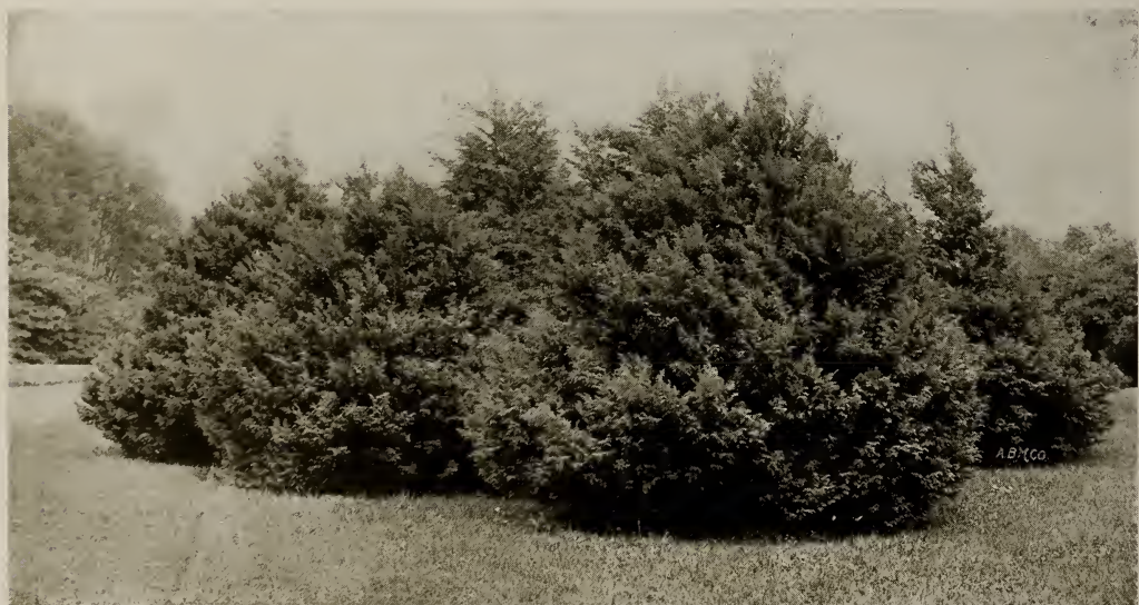
Retinispora Filifera. (Japan Cedar.) (See page 47.)