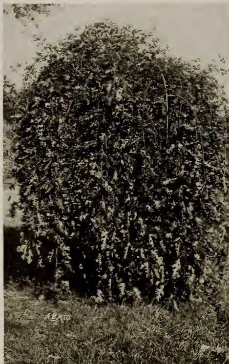
Morus pendula (See page 10).