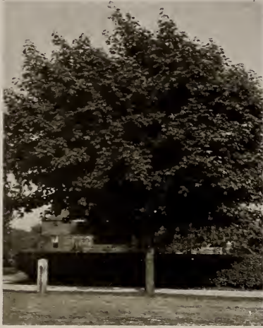
Acer platanoides (See page 3).