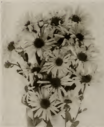
Hardy Aster—Michaelmas Daisy. (See page 52.)