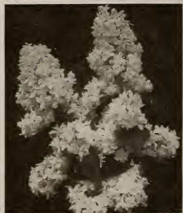
Double Lilac—Syringa. (See page 33.)