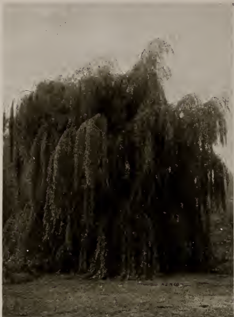
Salix Babylonica (See page 11).