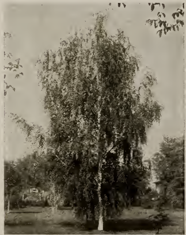
Betula laciniata (See page 5).