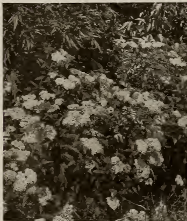
Spirea Anthony Waterer. (See page 32.)