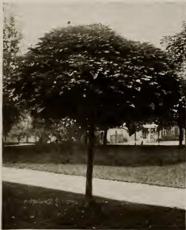
Catalpa Bungei (See page 5).