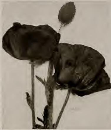
Papaver Orientalis—Oriental Poppy. (See page 55.)