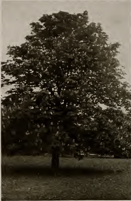
White-flowering Horse Chestnut. (See page 3.)