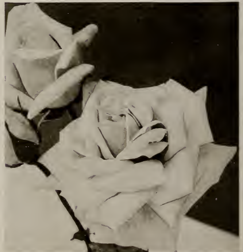
Kaiserin Augusta Victoria (See page 29).