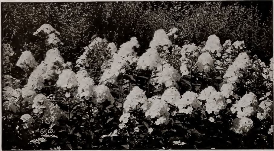
Mass Planting of Phlox. (See page 55.)