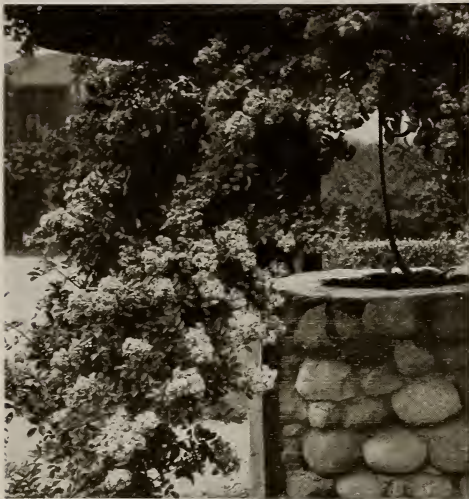
Excelsa (See page 31).