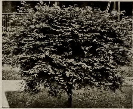
Acer polymorphum (See page 3).