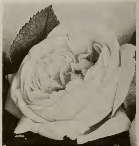
Paul Neyron (See page 29).