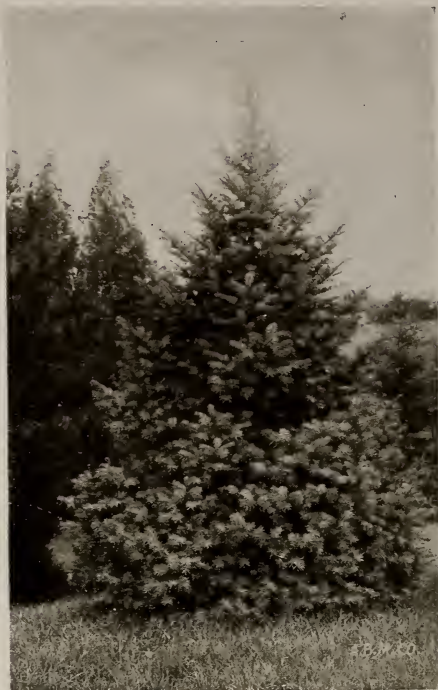
Abies concolor (White Fir). (See page 33.)