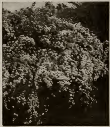
Spirea Van Houttei. (See page 32.)