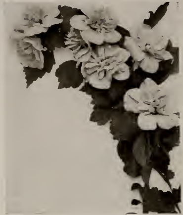
Althea—Hibiscus Syriacus alba plena (See page 23.)