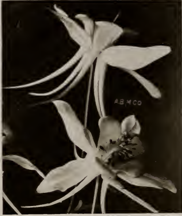
Aquilegia—Columbine. (See page 52.)