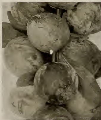
Imperial Gage ( \frac{1}{2} size). (See page 62.)