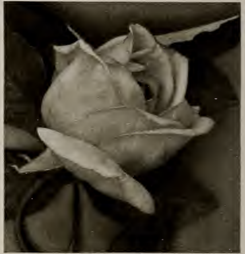
Sunburst (See page 29).