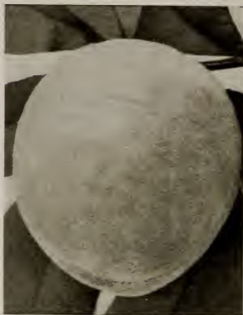
Carman Peach ( \frac{1}{2} size). (See page 61.)