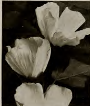
Hibiscus—Mallow. (See page 53.)