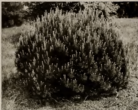
Mugho Pine. (See page 46.)