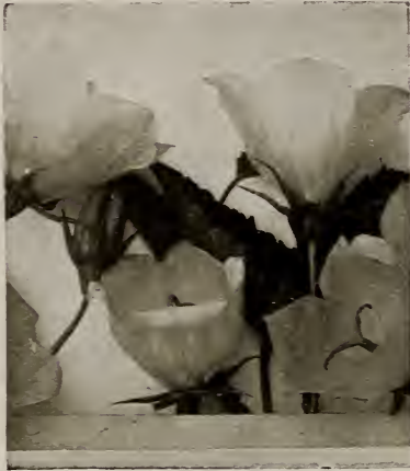
Campanula CarpatICA—Bell Flower or Harebell. (See page 52.)