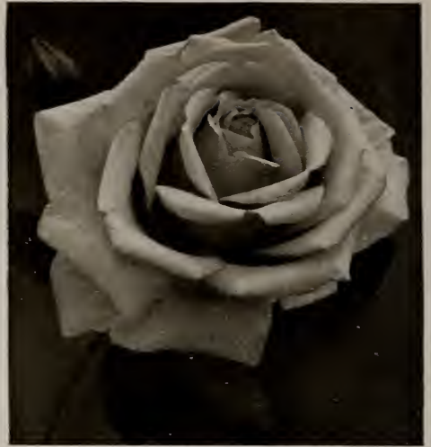
Prince de Bulgaria (See page 29).