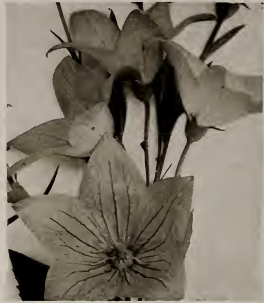
Platycodon grandiflora—Bellflower. (See page 57.)