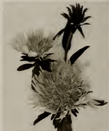
Stokesia Cyanea—Stokes Aster. (See page 57.)