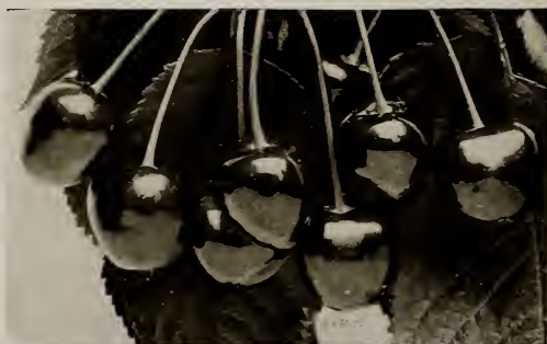
Black Tartarian ( \frac{1}{2} size). (See page 61.)