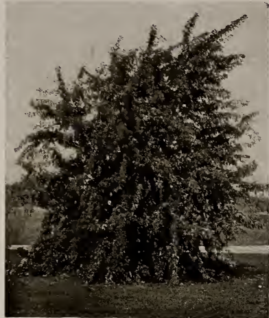
Acer var. Wierii laciniatum. (See page 3.)