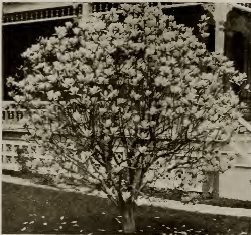
Magnolia Soulangiana . (See page 9.)