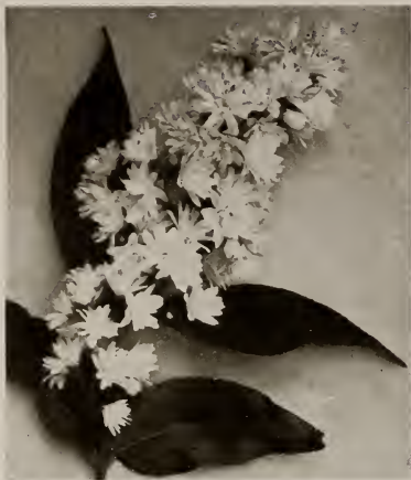
Deutzia Crenata—Pride of Rochester. (See page 20.)