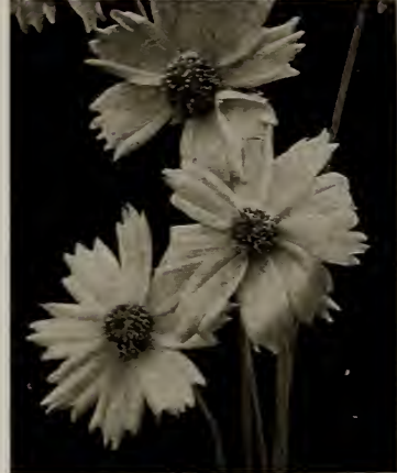
Coreopsis—Tickseed. (See page 52.)