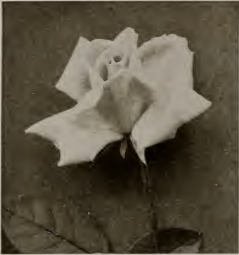
Killarney White (See page 29).