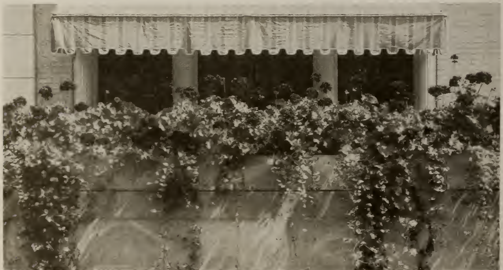
A Beautiful Window Decoration of Vines and Geraniums.