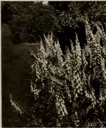
Digitalis—Foxglove. (See page 53.)