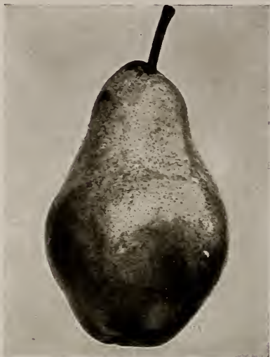
Bartlett Pear ( \frac{1}{2} size). (See page 62.)