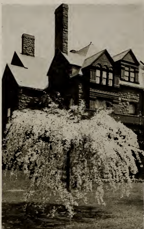
Cerasus Japonica pendula (See page 6).