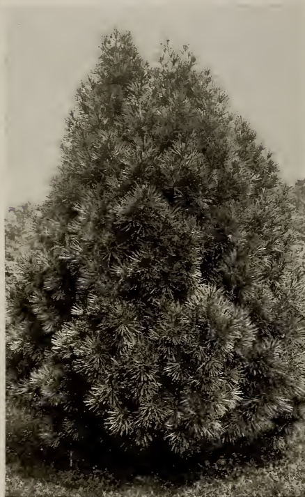
Sciadopitys verticillata. (See page 49.)