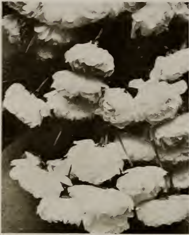
Cerasus avium alba plena —Double Flowering Cherry. (See page 6.)