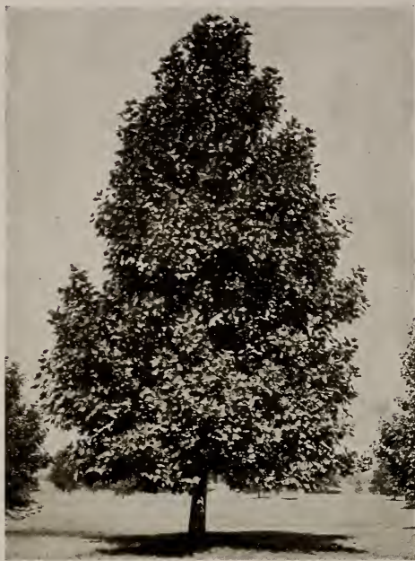
Platanus Orientalis (See page 10).