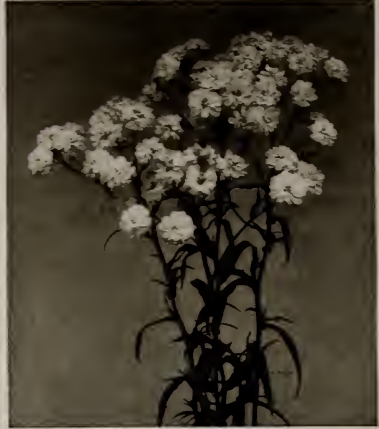
Achillea—Yarrow. (See page 51.)