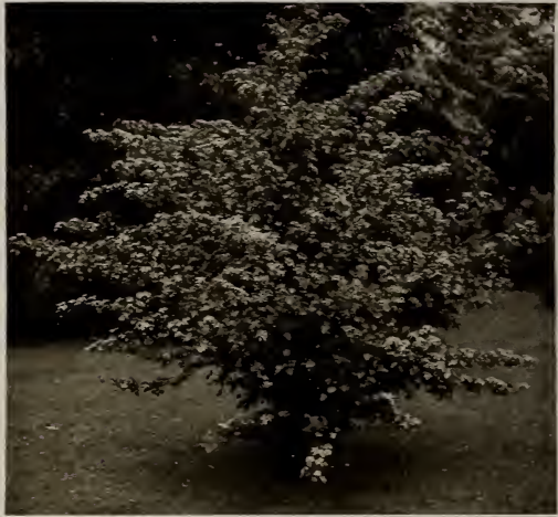
Crataegus Coccinea —Scarlet Fruited Thorn. (See page 6.)