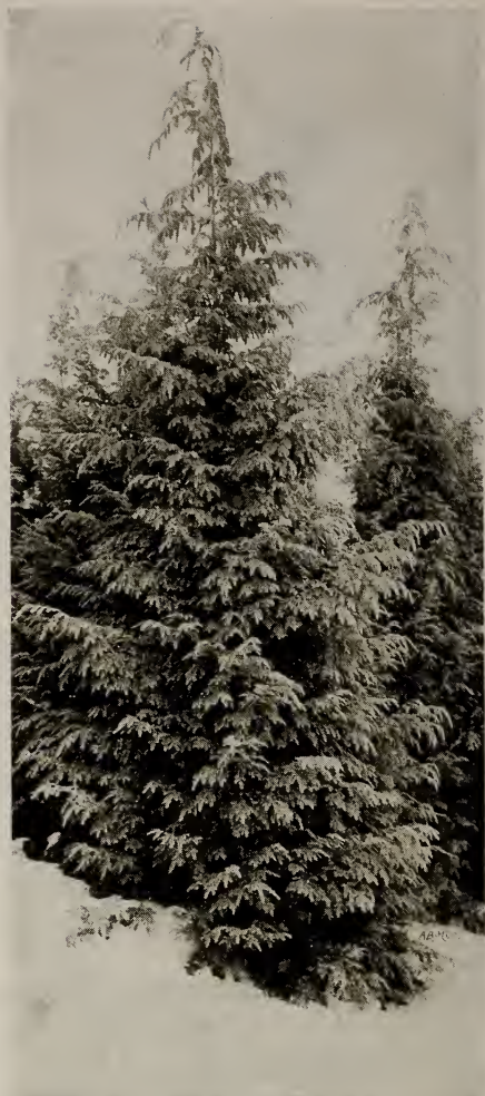
Hemlock Spruce. (See page 50.)