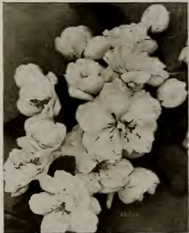
Pyrus Ioensis var. Bechtels . (See page 9.)