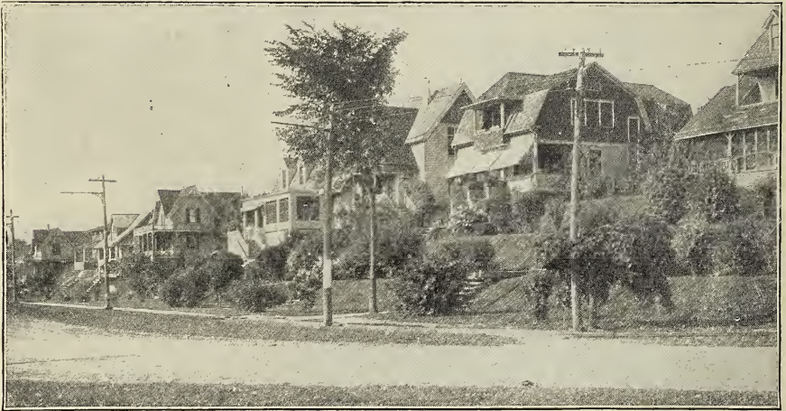
EFFECT OF TERRACING AND PLANTING A STEEP SIDE HILL WITH ENTERPRISE TREES