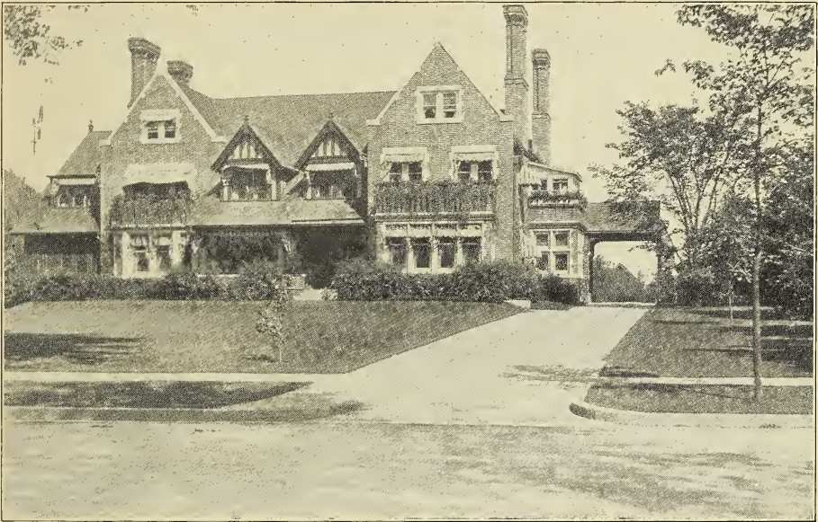
A BEAUTIFUL FOUNDATION PLANTING