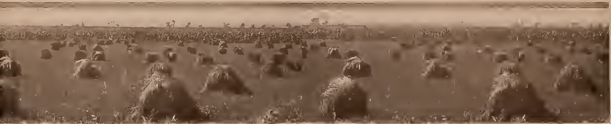
ANOTHER GENERAL VIEW ON THE FUNK FARMS

Wheat During the fall we can furnish you Funk's Turkey Red and Kharkof Wheat, Winter Rye for winter and early spring pasture, and we handle Barley, Speltz, Buckwheat, Broom Corn, Sugar Cane seed, Kaffir Corn and Vetch. Of course we don't grow all of these seeds but we are always in a position to know where the best seed can be obtained and we will gladly look after your wants if you will write us for prices. Prices quoted on application.