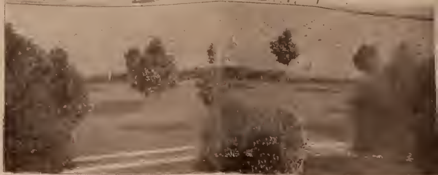
OAT FIELDS ON THE FUNK FARMS