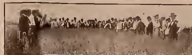
VISITORS INSPECTING OUR SMALL OATS PLOTS

For similar reasons that we offer Funk's "90" Day Corn, it often happens that one wishes to sow one field of early oats — first, in order not to have all of the oats harvest ripening at the same time; and second, we have found this early oat a money maker by sowing over the thin places in a frozen or drowned out wheat field. You can harvest these oats at the same time you do your Fall Wheat. These oats outyield the Early Champion or 4th of July oats and are not so susceptible to smut.