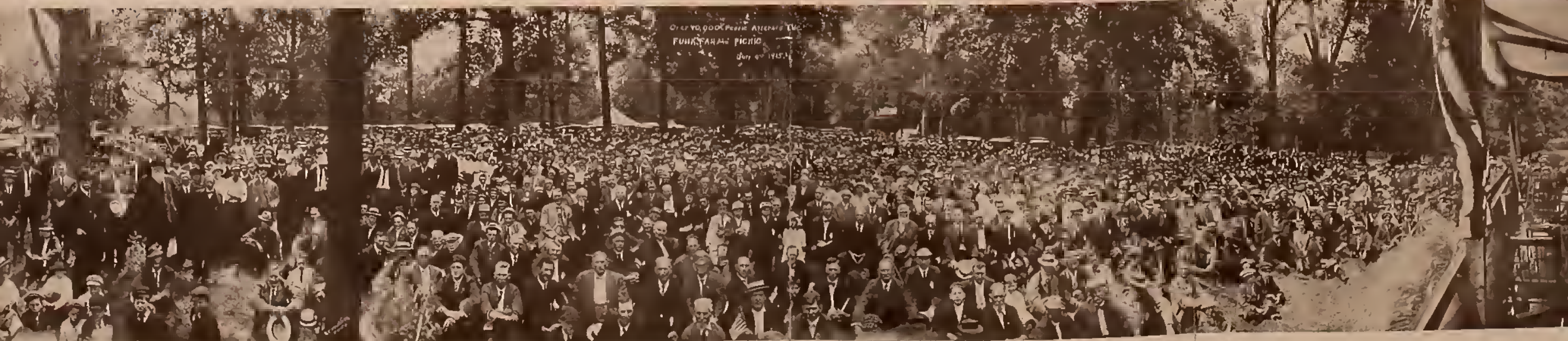
GENERAL VIEW OF PICNIC ON FUNK FARM JULY 1915. MORE THAN 10,000 PEOPLE IN ATTENDANCE