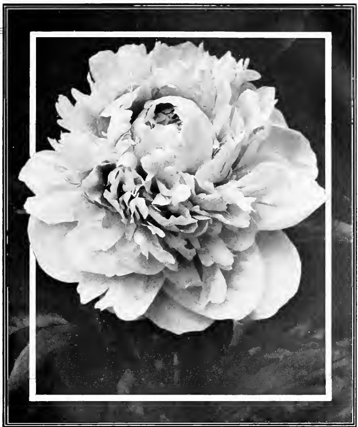
Claire Dubois. Color rich, clear, satiny pink.

11—CANARI (Guerin, 1861.) Bomb type; midseason. Primary petals white flushed delicate pink, changing to pure white with deep primrose-yellow center. Collar next to guards white; a large bloom on tall stems; richly fragrant. One of the freest blooming of all Peonies.