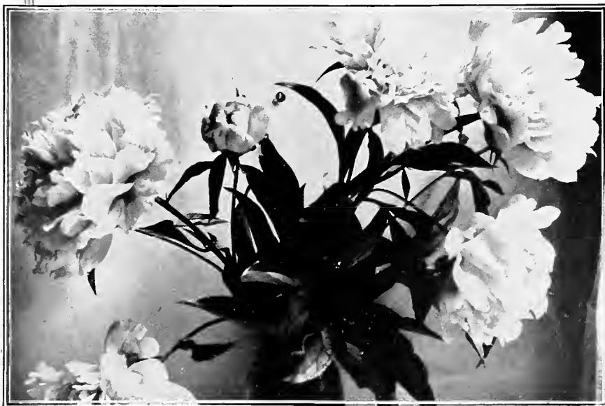
"O, here I see! Close to me nods."

The Farm Beautiful should be a charming picture in Nature's great frame work all around it.