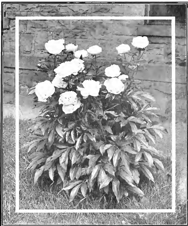
Duchesse de Nemours. A grand Peony.

94—ELIE CHEVALIER (Dessert, 1908.) Crown type; midseason. Opens a large globular bomb, developing into a high built crown, forming a cup of beautifully imbricated petals. Color a uniform tyrian-rose, center elegantly flecked with crimson. Tall grower; free bloomer; fragrant.