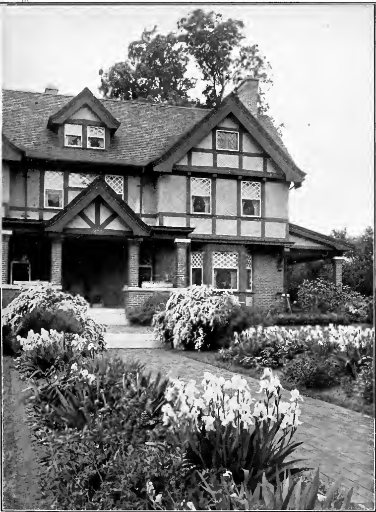
German Iris. Hardy Everywhere. What a feast for the eye.

QUEEN OF MAY —A lovely shade of rosy-pink, tinted with lilac; beautiful. 25 cents.