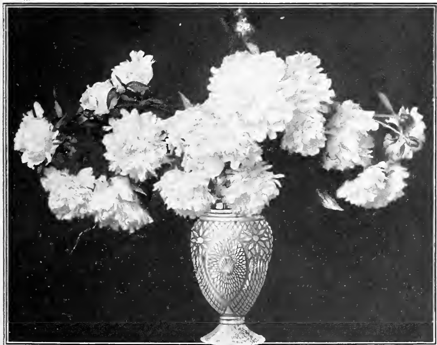
Jubilee, the grandest White Peony grown.