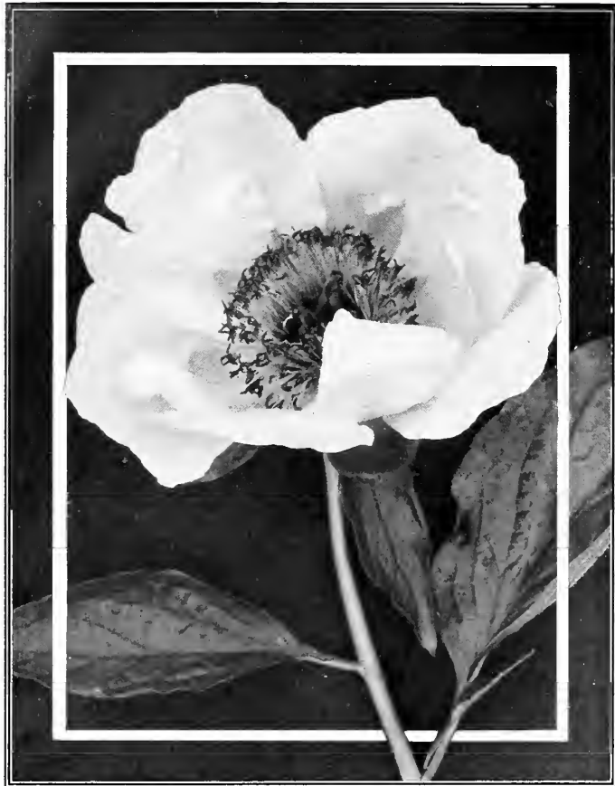
Albiflora. Nothing to beat this.

785—LADY IRIS (Pleas, 1907.) Rose type; late midseason. The cleanest possible color; white suffused with lake. The shadings and color remind one of the beautiful Iris Queen of May; dainty lavender pink; has long, broad, rich, silky petals growing smaller towards the center. No prettier loosely double flower than this one. Color rare and beautiful.