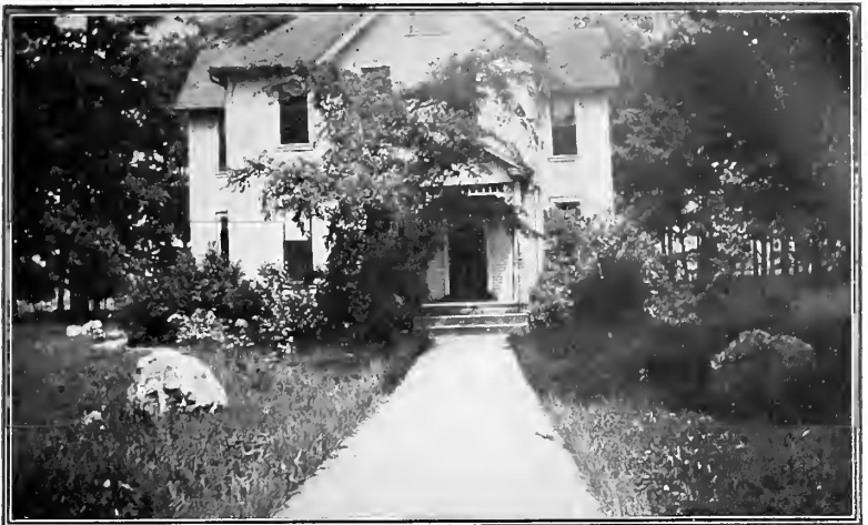
The Good & Reese office stands in a beautiful grove of forest trees.

203—MIGNON (Lemoine, 1908.) Rose type; late. This variety has many of the same good characteristics as the famous variety Solange. Very large, perfectly formed flowers with broad, imbricated petals; soft light rose passing to amber-cream; fragrant; growth very vigorous. Has all the good points.