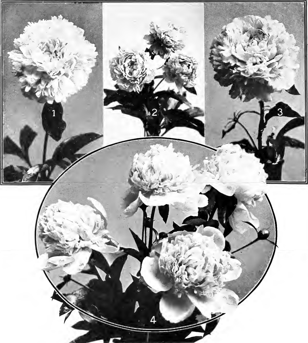
1— Monsieur Dupont . 2— Albert Crousse .