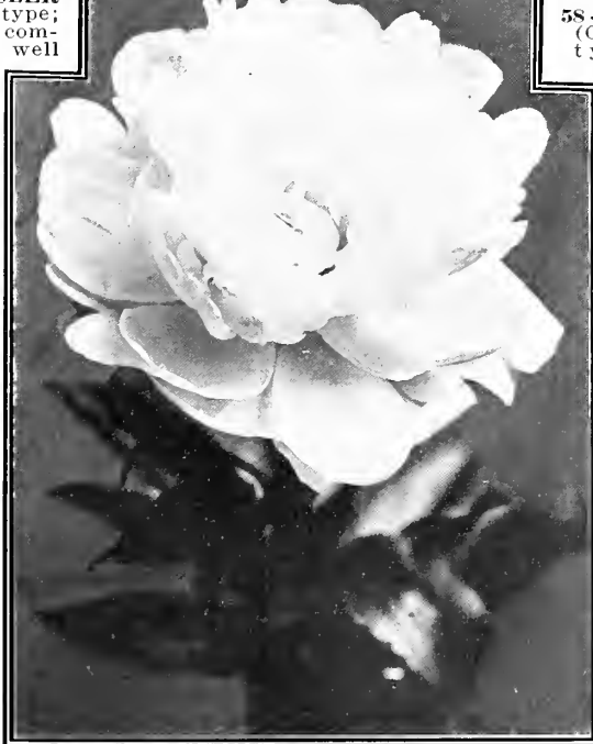
Upper, Duc de Wellington . Lower, Madame Emile Galle .

225—MADAME LEBON (Calot, 1855.) Rose type; late. Large, full blooms, brilliant cherry-pink tinged aniline-red, collar creamy-white, center flecked crimson. Very showy.