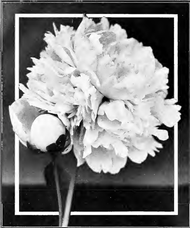
Alsace Lorraine. With an indefinable charm.