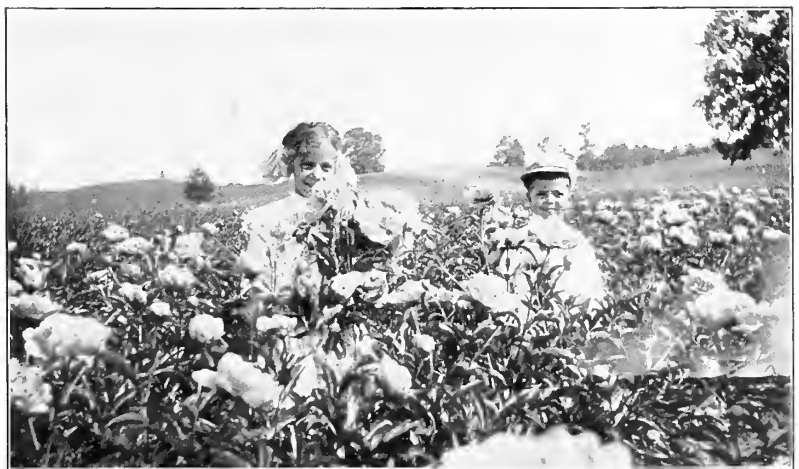
Peonies and Peony Lovers. Certainly, "Knee deep in June."

55—RED CROSS (Hollis, 1904.) Rose type; midseason. This is a charming red flowering Peony with large double flowers of a beautiful wine colored red; much admired.