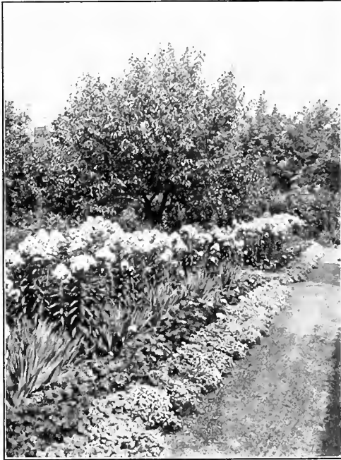
Phlox planted in a hardy border.

T HIS is one of the most easily grown hardy perennials, and the large number of beautiful varieties now offered make it especially desirable. These noble flowers are not only beautiful as individuals, but the cheerful appearance of our gardens during the summer and autumn months is much indebted to them. They succeed in any position or soil, and can be used to advantage either as single specimens in the mixed border or as large clumps or beds on the lawn. To produce the best results, however, they should have a rich, deep and rather moist soil, and let each clump have a space of from two to three feet in which to develop. They will continue to thrive for several years with little attention, as is attested by the fine clumps about old homesteads. The ease with which they are cultivated, their entire hardiness and the extended time of blooming, combined with the varied and beautiful coloring, make them especially valuable for garden planting. The Perennial Phlox usually commence to bloom in early summer, and are brilliant with color until after several frosts have come. They are admirably adapted for cemetery planting, also for a low hedge or screen to hide old fences and unsightly objects. Do not fail to plant Phlox in the fall, any time from September until the ground is frozen. Price, 10 cents each; six for 50 cents. The entire set of thirty-one distinct standard varieties of Hardy Phlox for $2.25.