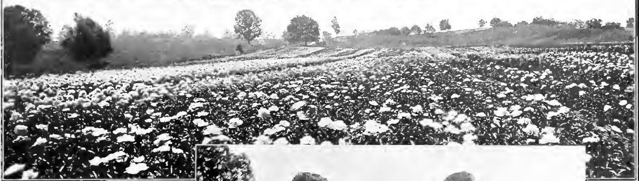
Bottom: "Awakening to the glories of June."