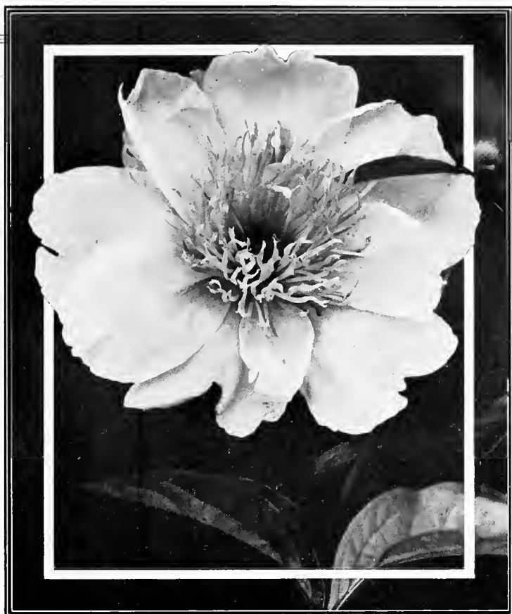
Yeso. A charming flower.

96—FRANCOIS ROUSSEAU (Dessert, 1909.) Semi-rose type; early. Large flower of perfect shape. Color lively brilliant velvety red; almost identical in color with Eugene Bigot, but blooms eight to ten days earlier. An extremely desirable red.