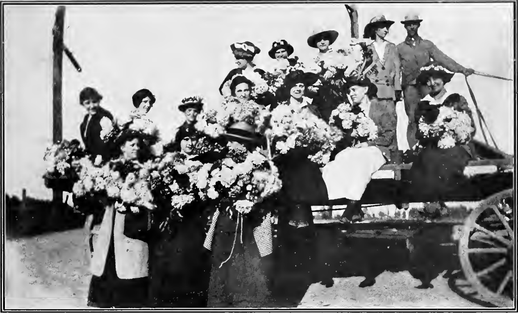
Happy? Yes! Coming from the Peony fields.