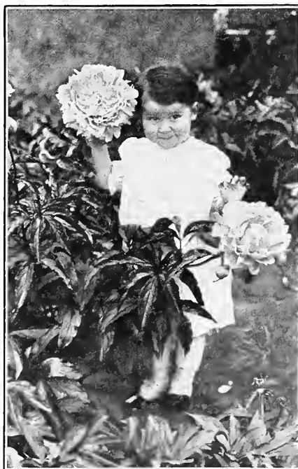
Let me introduce to you Brand's Peonies. (The little child is showing you a flower of the famous Martha Bulloch.)