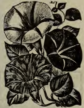
IMPERIAL JAPANESE MORNING GLORY.

Single, Mixed. Large packet, 5 cents, ounce, 15 cents.