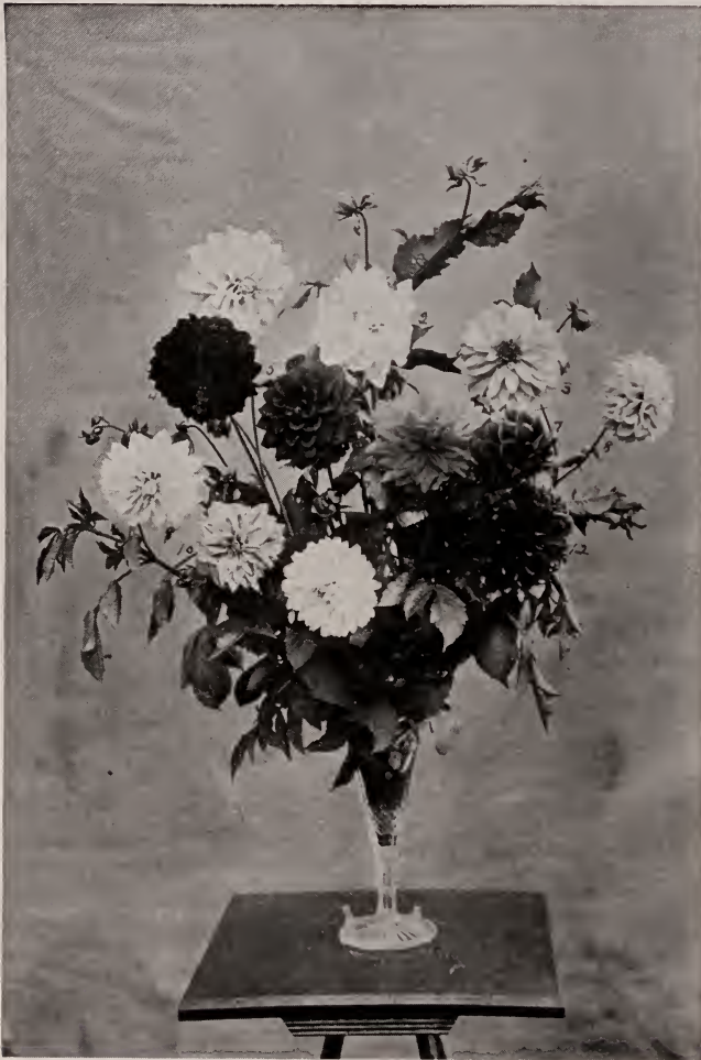
Vase of Decorative Dahlias

Easton. Not an extra-large flower, but a variety of brilliant color, good form, and remarkable free-flowering habit. In color it is a brilliant Turkish or oriental red. Price, 25 cts.