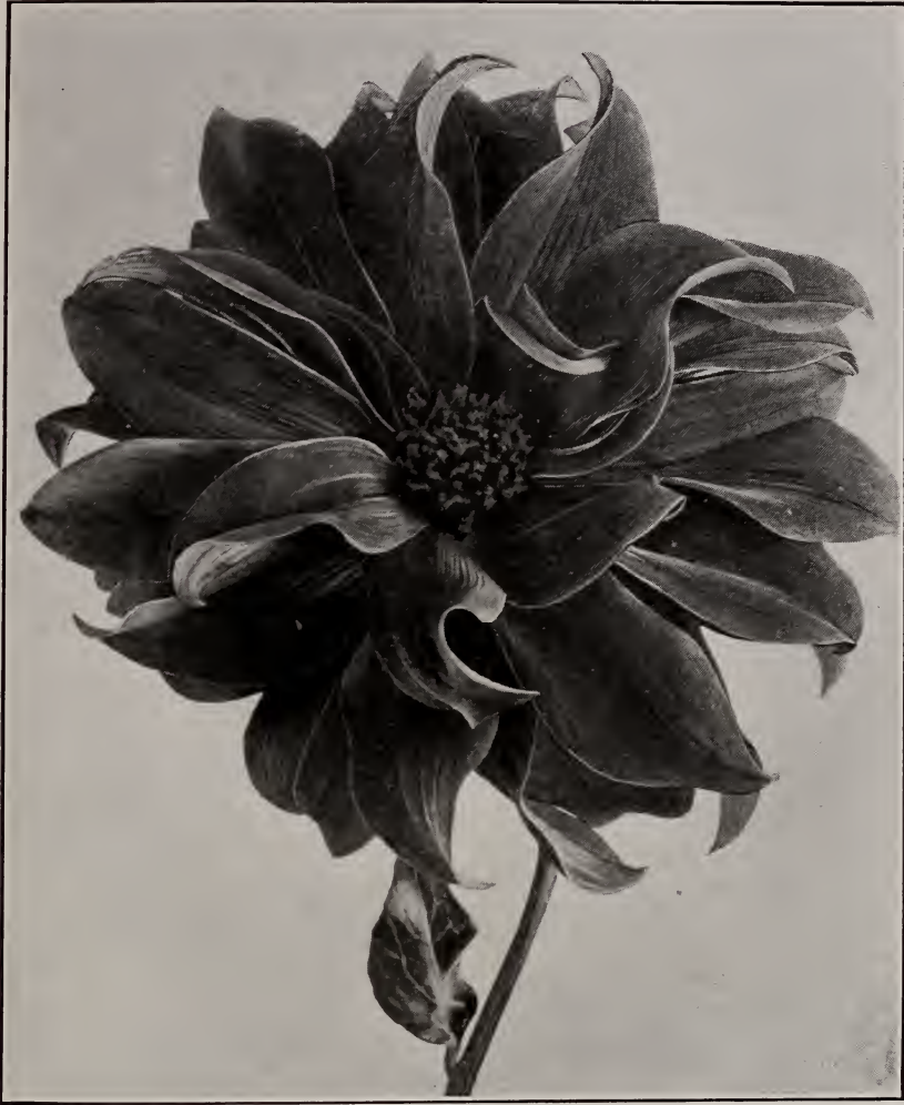
Peony-flowered Dahlia, Duke Henry (see page 16)