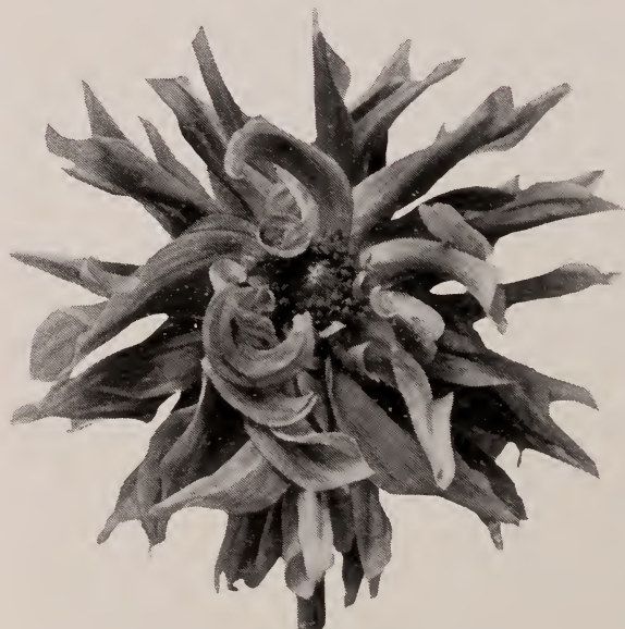
Peony-flowered Dahlia, Geisha

Geisha. The showiest and most attractive of this type yet introduced; of strong growth, with the rich-colored flowers, which are frequently over 8 inches in diameter, standing well above the foliage. These are original in form, consisting of peculiarly twisted and curled petals, of an effective and rich combination of scarlet and gold, the center being yellow, which becomes suffused with and deepens to scarlet at the center of the petals, shading off lighter at the edges. Price, 50 cts.