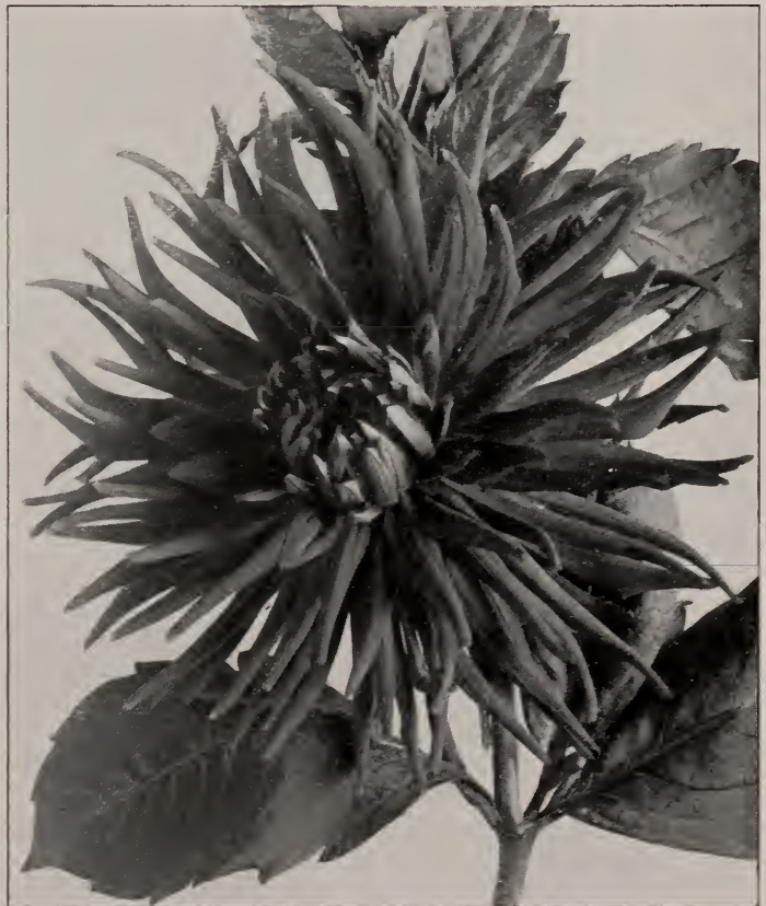
Cactus Dahlia, Lucifer (see page 4)

Nerthus. The center of the flower is a rich, glowing, bronzy, orange-yellow, passing to a carmine-rose at the tips, the whole suffused with a glowing golden color, which gives it an iridescence which it is not possible to describe. Price, 35 cts.