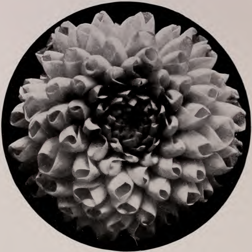
Grand Duke Alexis Dahlia