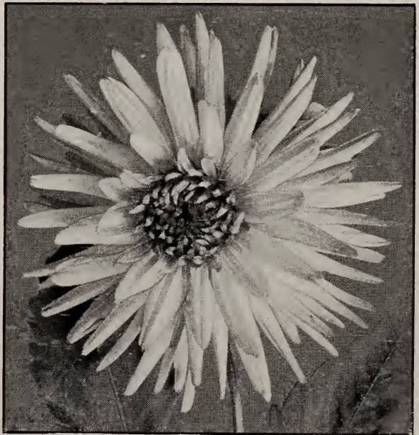
Cactus Dahlia Flieder (see page 4)

Etendard de Lyon. Even the person who classes all shades of purple as so-called malignant magentas stops to admire this beautiful carmine-rose new giant, which I consider one of the most distinct varieties for garden decoration. The flowers are of a hybrid Cactus type, distinct in shape from all others; the petals are broad, curled and wavy and form a flower fully 6 inches in