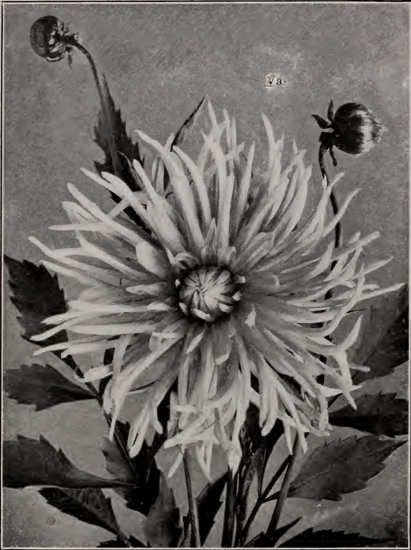
Cactus Dahlia, Harold Peerman (see page 4)