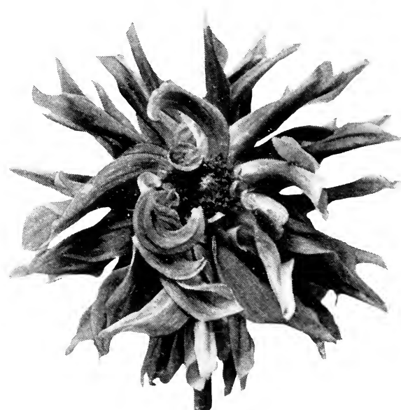
Peony-flowered Dahlia, Geisha

Geisha. The showiest and most attractive of this type yet introduced; of strong growth, with the rich-colored flowers, which are frequently over 8 inches in diameter, standing well above the foliage. These are original in form, consisting of peculiarly twisted and curled petals, of an effective and rich combination of scarlet and gold, the center being yellow, which becomes suffused with and deepens to scarlet at the center of the petals, shading off lighter at the edges. Price, 50 cts.