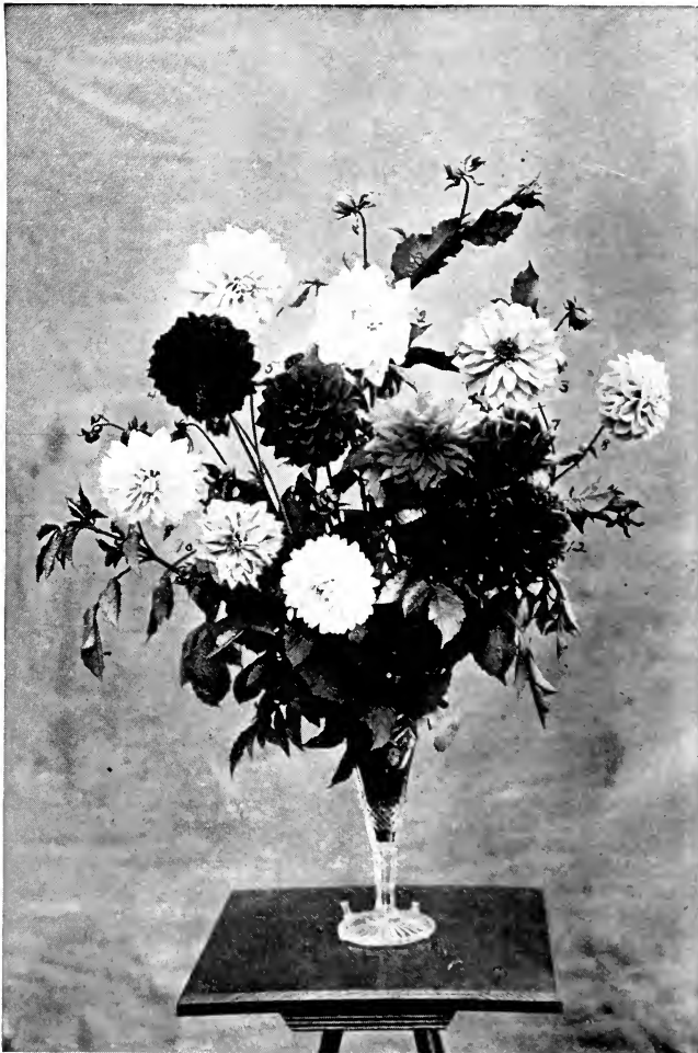
Vase of Decorative Dahlias

Easton. Not an extra-large flower, but a variety of brilliant color, good form, and remarkable free-flowering habit. In color it is a brilliant Turkish or oriental red. Price, 25 cts.