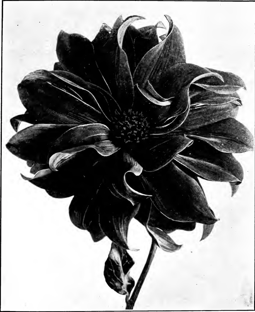
Peony-flowered Dahlia, Duke Henry (see page 16)