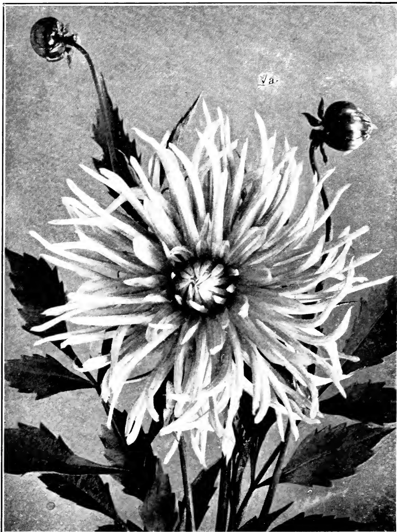
Cactus Dahlia, Harold Peerman (see page 4)