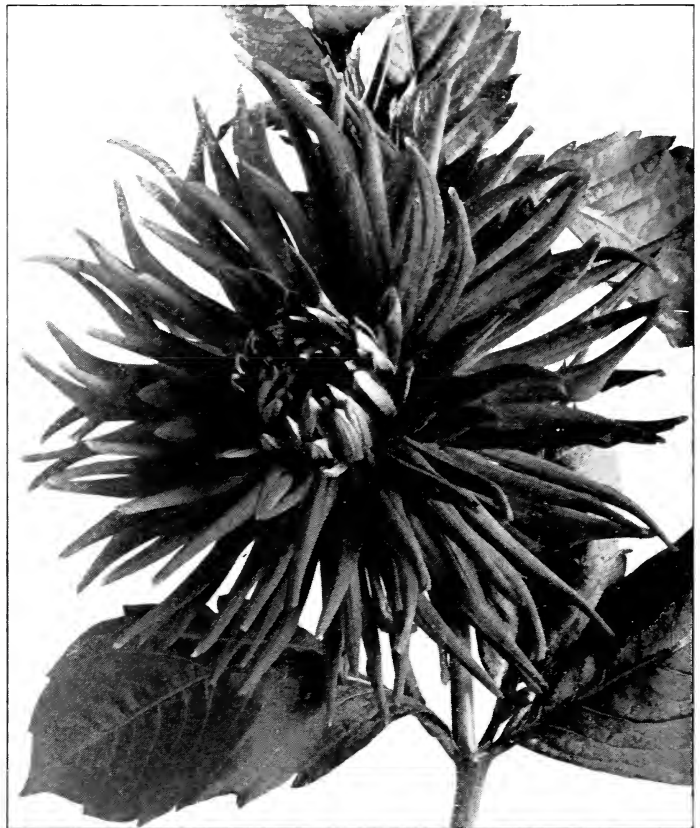
Cactus Dahlia, Lucifer (see page 4)

Nerthus. The center of the flower is a rich, glowing, bronzy, orange-yellow, passing to a carmine-rose at the tips, the whole suffused with a glowing golden color, which gives it an iridescence which it is not possible to describe. Price, 35 cts.