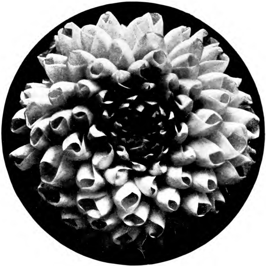
Grand Duke Alexis Dahlia