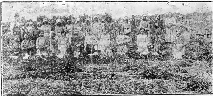
Picking Berries at Portland Nursery Co. Grounds—Some Family.

P. S. All letters of inquiry promptly answered.