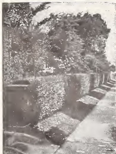
Polish River Privet

This privet was brought from Poland over 20 years ago, and although it is the most wonderful of the Privet family, has been little known until the last two or three years. It has been on the Campus Grounds at the State Agricultural School here at Lincoln for nearly 20 years, and has never been known to freeze. When grown, untrimmed, it is upright in habit, usually growing 8 to 12 feet high. Leaves are bluish green and lustrous, half evergreen. The flowers which resemble lilacs are white and from 3 to 5 inches long. The foliage holds its characteristic color throughout the season and does not change in the least at the approach of cold weather. We have seen this privet as green at Christmas time as in August. When trimmed it will grow as dense as boxwood. In the fall and winter it is covered with black berries. Price—18 to 24 inch, 20c each; $1.75 for 10; $15.00 for 100. 2 to 3 feet, 25c each; $2.00 for 10; $17.50 for 100.