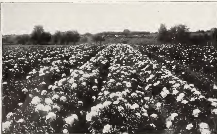
A Field of Peonies