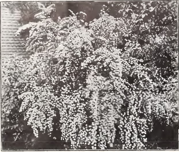
Spirea Van Houttei

HYDRANGEA —The massiveness of bloom on these valuable shrubs assure them a place in every grouping where solid white effects are required. The comparatively new Arborescens variety comes first, during July, and overlaps the starting of the tree form and even the old Paniculata , which