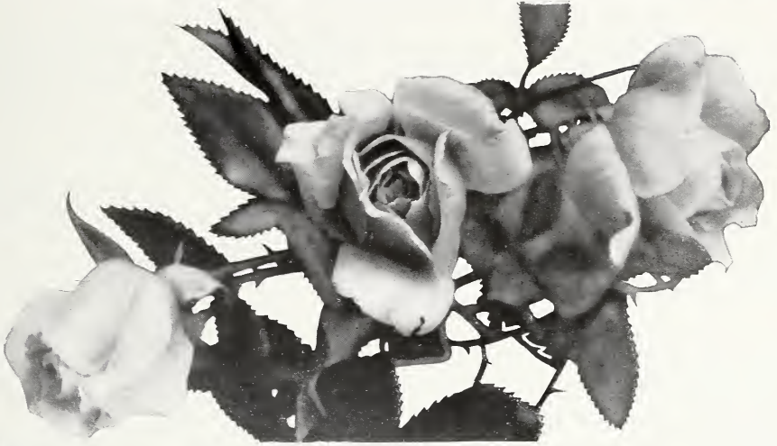
MRS. AARON WARD. H. T.

MISS RUBY DENT. H. T. (Cal. Rose Co., 1916)