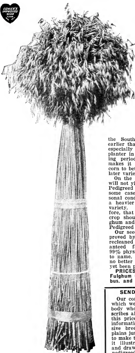
SHEAF Coker's Improved Fulghum Oats.

We offer Coker's Improved Strain of Fulghum Oats. Beginning with pure seed of the best strain of Fulghum Oats we could obtain, we have by mass selection produced a pure type and a higher yielding strain of this oat. Made the highest yield in our variety test last year over 22 principal varieties and strains of Southern Oats. We believe there is no strain of these oats in the South superior to Coker's Improved strain.