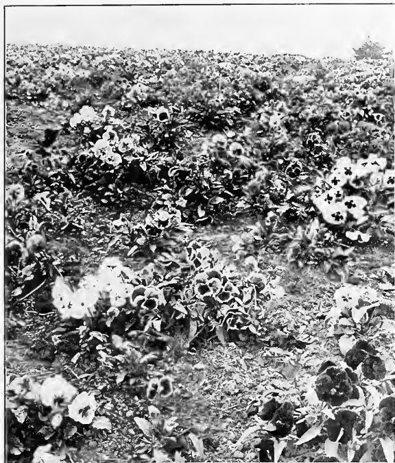
Mastodon Pansy Seed Made in Oregon, U. S. A.