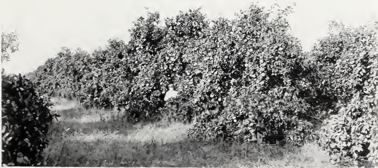
Klemm's Silver Cluster Grapefruit Grove—Twelve Years Old