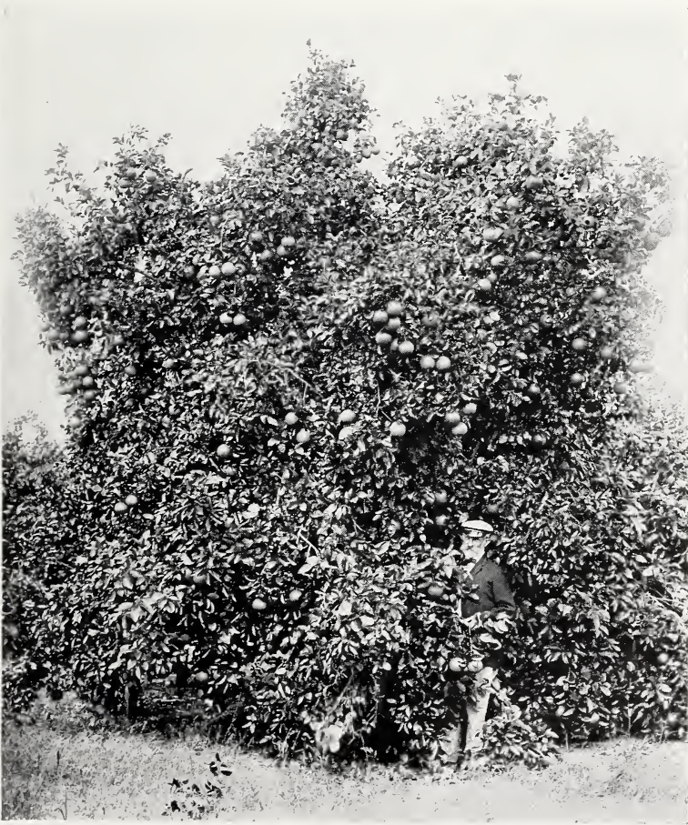
Klemm's Silver Cluster Grapefruit Tree