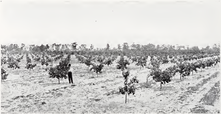
Fifteen-Month-Old Valencia Orange Grove, Winter Haven, Fla.