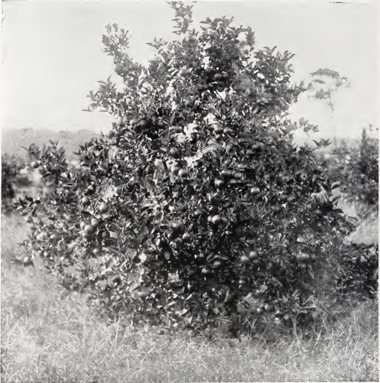
Valencia Orange Tree—Four Years Old