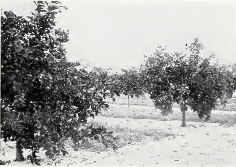
Pineapple Orange Tree—Four Years Old

of Florida are so marked that men of experience and keen judgment have predicted that before many years this State will control the bulk of the citrus fruit produced in this country, and by reason of her steady increase in quantity and quality of fruit produced, methods of marketing, packing and handling, and through educating