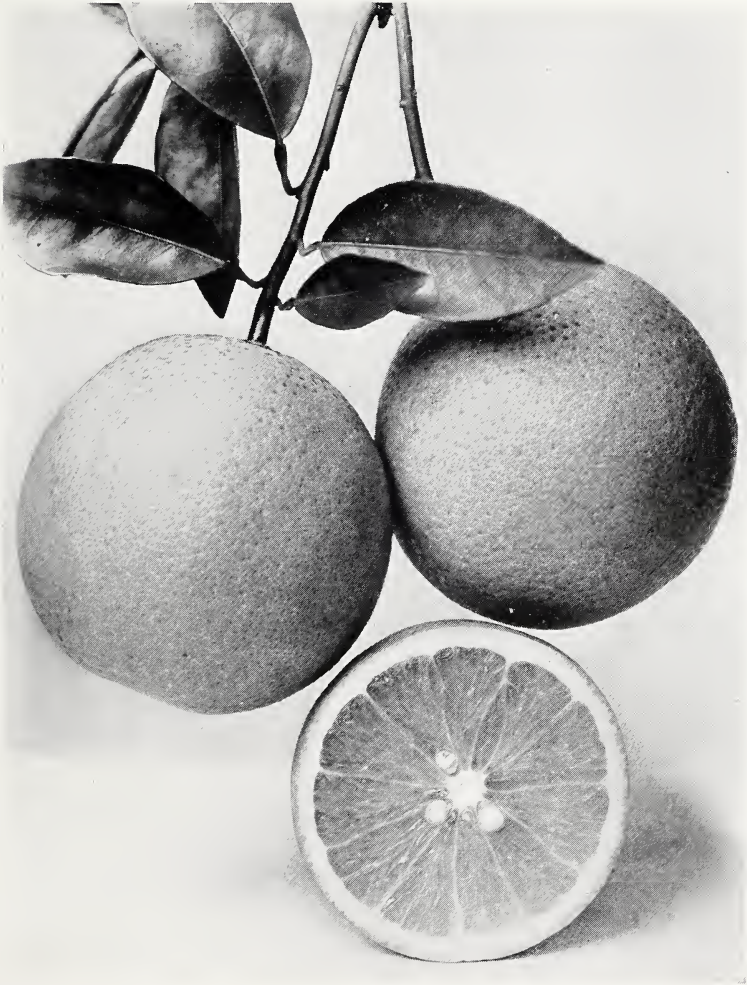
Valencia Late Oranges