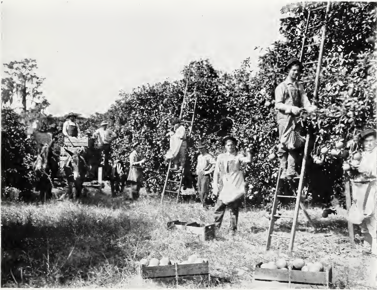
Klemm's Silver Cluster Grapefruit Grove—Fifteen Years Old Forty and Forty-five Boxes Per Tree

Care should be taken to thoroughly tamp down the soil, holding the top of the tree straight. Sprinkle a pound of good tree grower or vegetable fertilizer around each tree, lightly working it into the soil, but do not mix any fertilizer into the hole with the soil used for covering the roots, for these roots are very tender and might easily be injured or killed by such a practice.