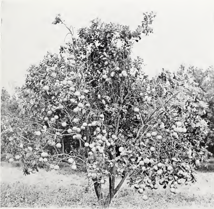
Klemm's Silver Cluster Grapefruit Tree—Four Years Old