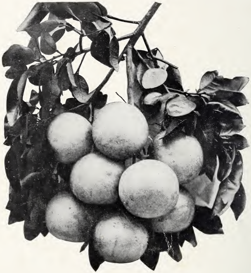
Klemm's Silver Cluster Grapefruit