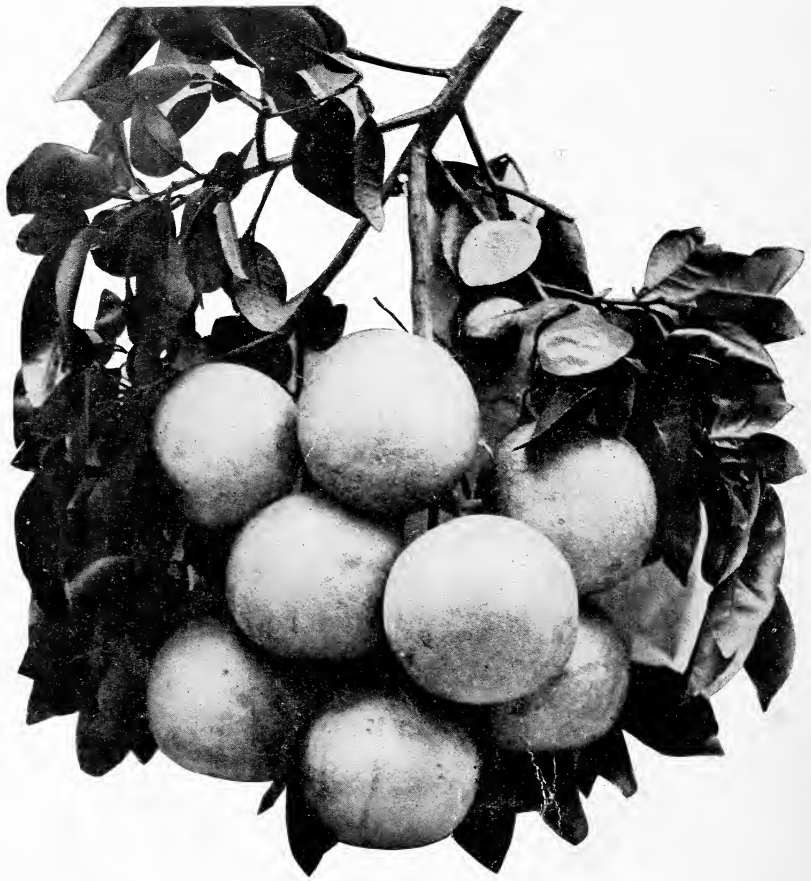
Klemm's Silver Cluster Grapefruit