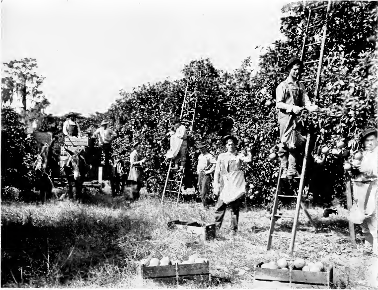
Klemm's Silver Cluster Grapefruit Grove—Fifteen Years Old Forty and Forty-five Boxes Per Tree

Care should be taken to thoroughly tamp down the soil, holding the top of the tree straight. Sprinkle a pound of good tree grower or vegetable fertilizer around each tree, lightly working it into the soil, but do not mix any fertilizer into the hole with the soil used for covering the roots, for these roots are very tender and might easily be injured or killed by such a practice.