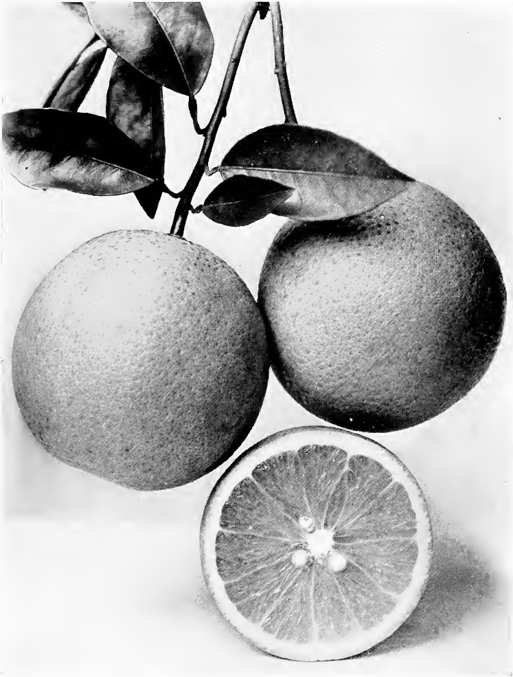
Valencia Late Oranges