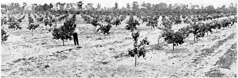
Fifteen-Month-Old Valencia Orange Grove, Winter Haven, Fla.