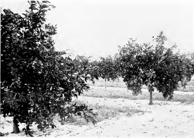
Pineapple Orange Tree—Four Years Old

of Florida are so marked that men of experience and keen judgment have predicted that before many years this State will control the bulk of the citrus fruit produced in this country, and by reason of her steady increase in quantity and quality of fruit produced, methods of marketing, packing and handling, and through educating