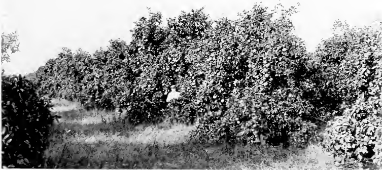
Klemm's Silver Cluster Grapefruit Grove—Twelve Years Old