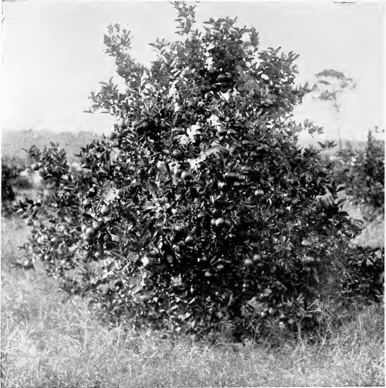
Valencia Orange Tree—Four Years Old