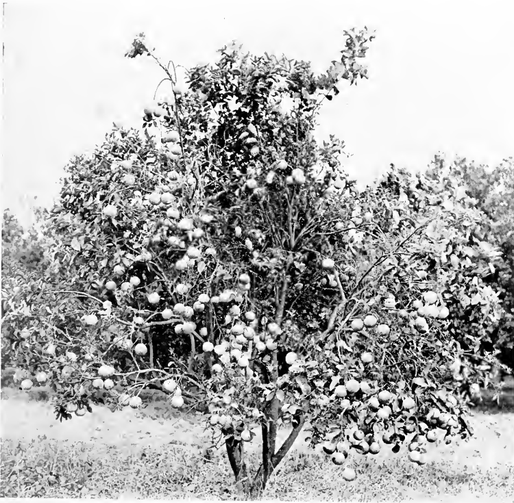
Klemm's Silver Cluster Grapefruit Tree—Four Years Old