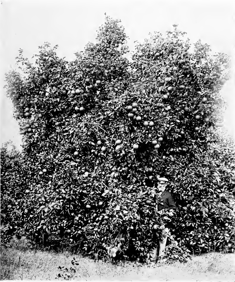
Klemm's Silver Cluster Grapefruit Tree