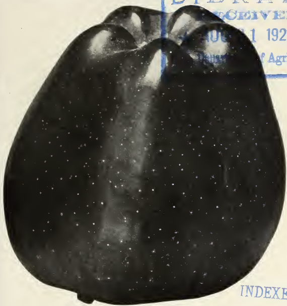
The Delicious Apple (True to Type)