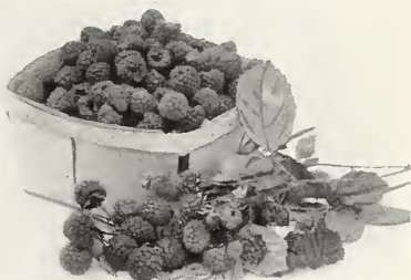
St. Regis Raspberry.

Large, bright crimson. Bears a very good crop at regular season and continues crop on young tips throughout the season, hence is usually called everbearing. 50 cts. per doz.; 75 cts. for 25; $2.00 per 100.