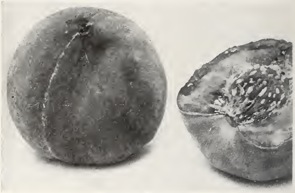
Goid Mine Peach.