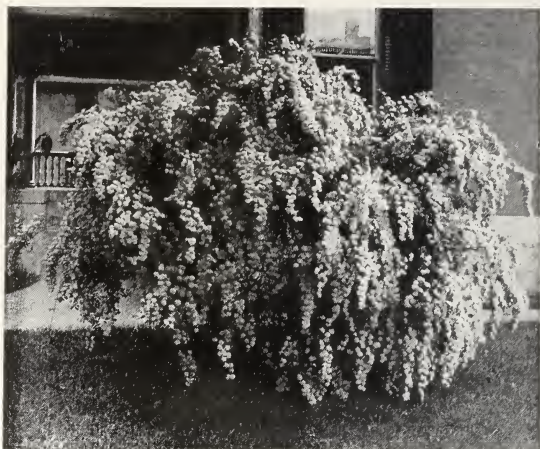
Spirea Van Houttei.