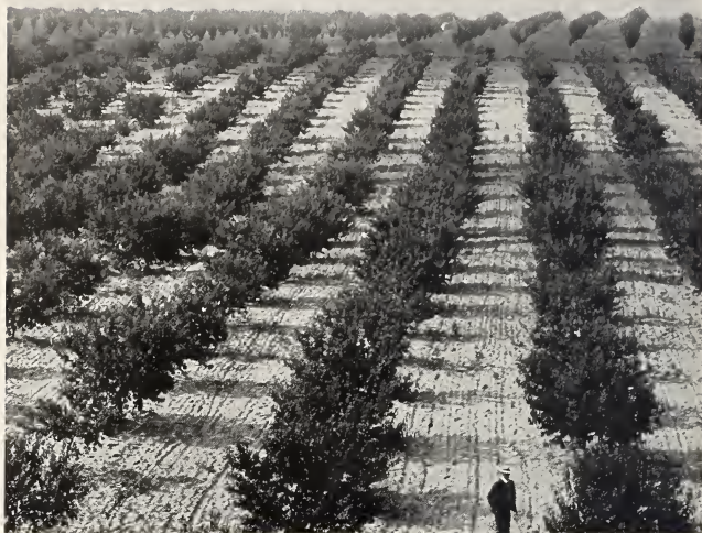
An Orchard Grown on the Pedigree Plan.