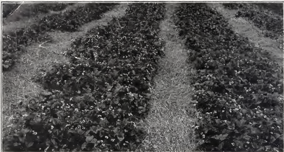
MINNESOTA NO. 3 STRAWBERRY PLANTS IN FULL BLOOM (NOTE PROLIFIC GROWTH OF PLANTS AND BLOSSOMS)

This wonderful new strawberry was originated at the Minnesota State Fruit Breeding Farm a few years ago and is now conceded to be the best June bearing strawberry.