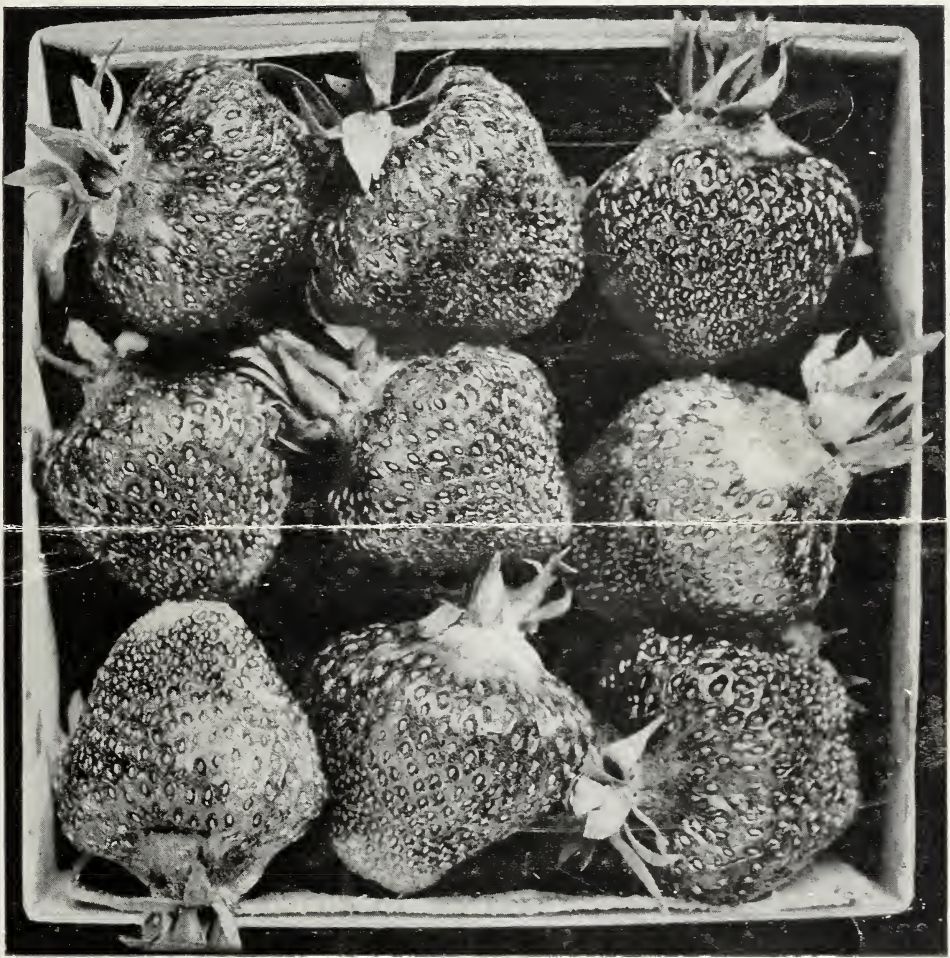
Top Layer of a quart box of Minnesota No. 3 Strawberries (ACTUAL SIZE)