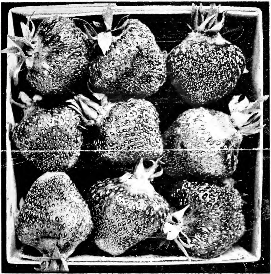
Top Layer of a quart box of Minnesota No. 3 Strawberries