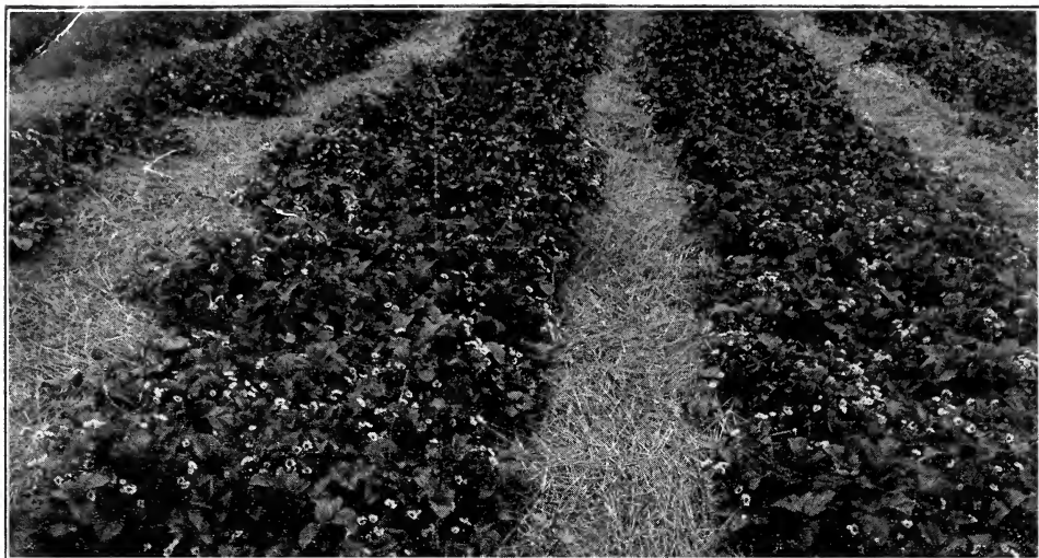
MINNESOTA NO. 3 STRAWBERRY PLANTS IN FULL BLOOM (NOTE PROLIFIC GROWTH OF PLANTS AND BLOSSOMS)

This wonderful new strawberry was originated at the Minnesota State Fruit Breeding Farm a few years ago and is now conceded to be the best June bearing strawberry.