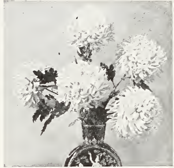
Golden Wedding Chrysanthemum

Coleus . Good assortment. 10 cts. each, 75 cts. per doz. Cycas . 75 cts. to $6 each.