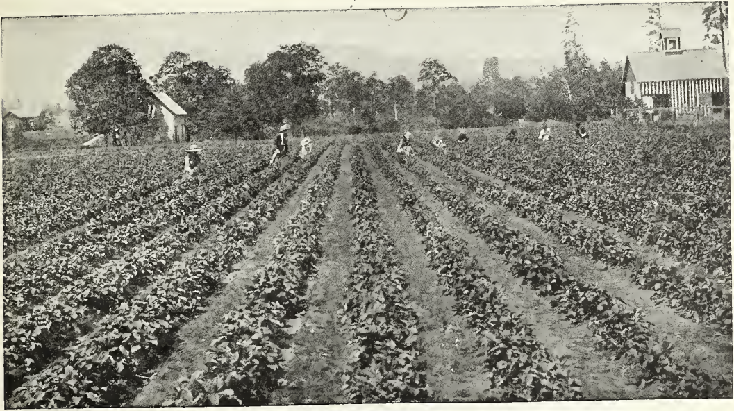
Getting the Money.