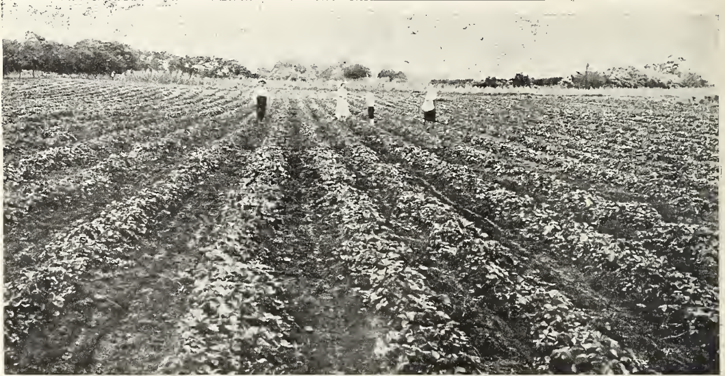
One of our Everbearing Propagating Beds.

Plant culture is one of our strong points. We have entirely new fields to take our plants from every spring. We ship none from fields that have been fruited. Conditions along the lake shore are always favorable, and the plant is able to mature in every detail to its utmost perfection. Failure is unknown here.