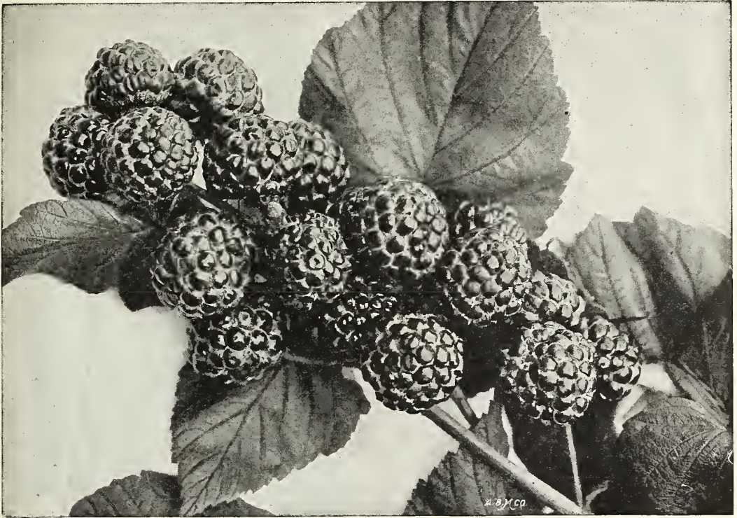
Cumberland Black Raspberries.

the top of the market. Cumberland is very hardy and will stand many degrees below zero without injury.