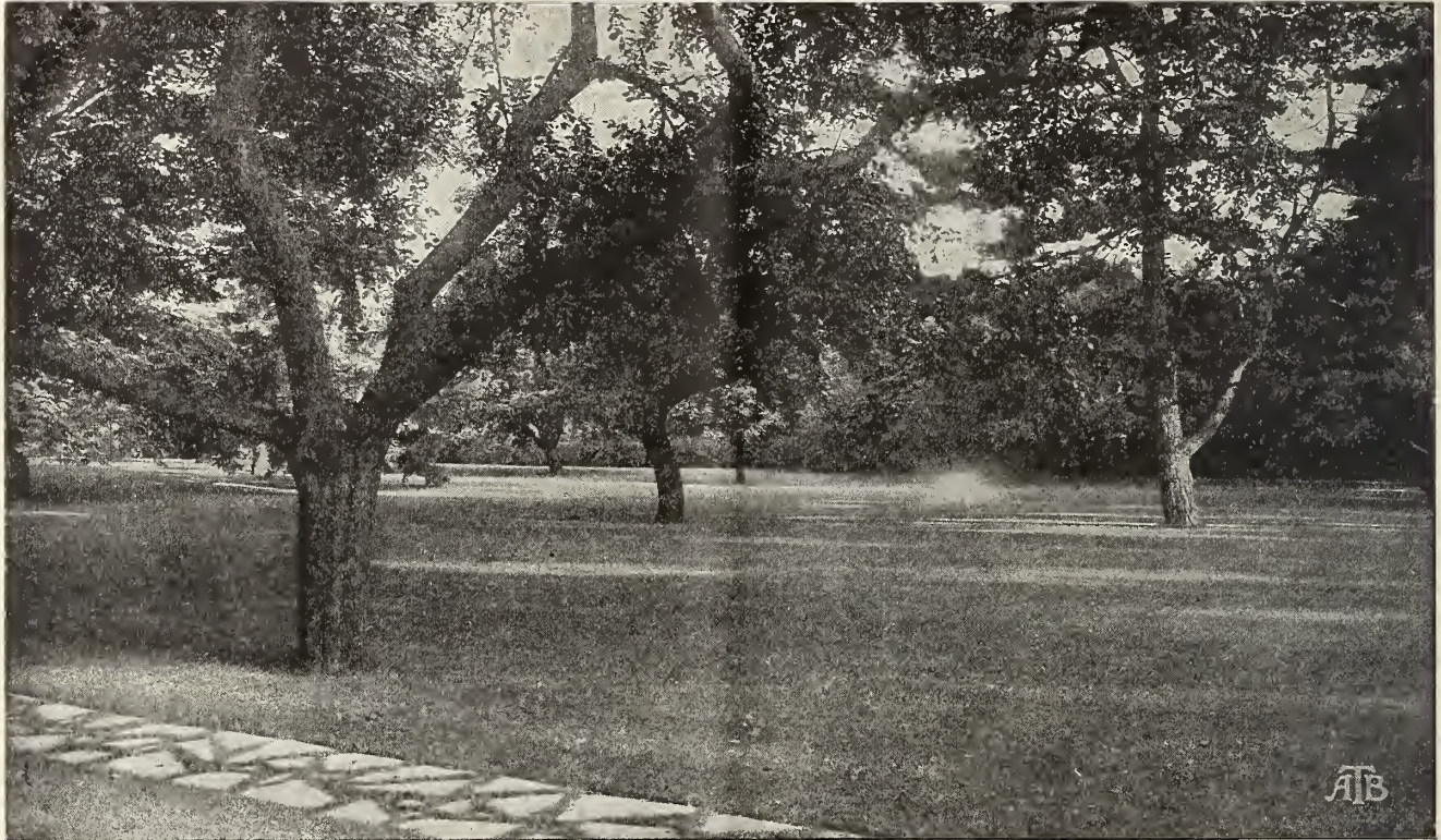
Boddington's Mixture for Shady Lawns