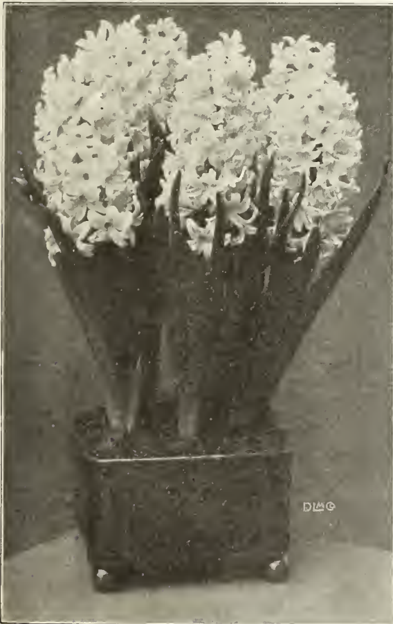
Single Dutch Hyacinth La Grandesse, growing in Boddington's Prepared Fertilized Fiber

Your local postmaster will inform you what Zone you are in from New York City, if you are in doubt, and you can add for postage accordingly.