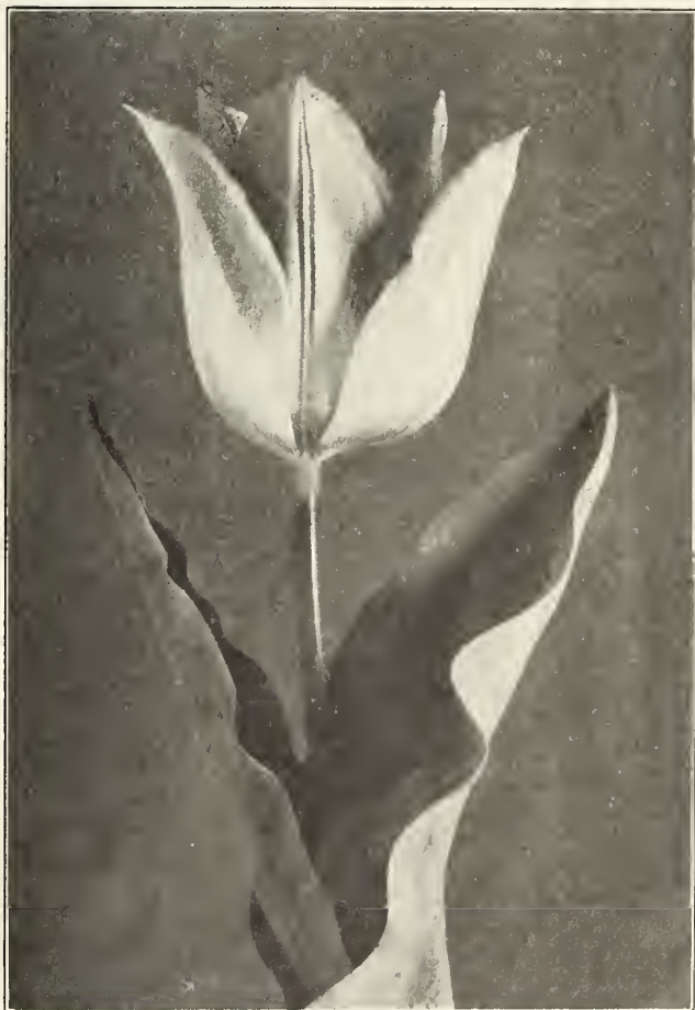
Above illustration shows general type and form of Cottage Tulips

MIXED PARROT TULIPS. 55 cts. per doz., $4 per 100.