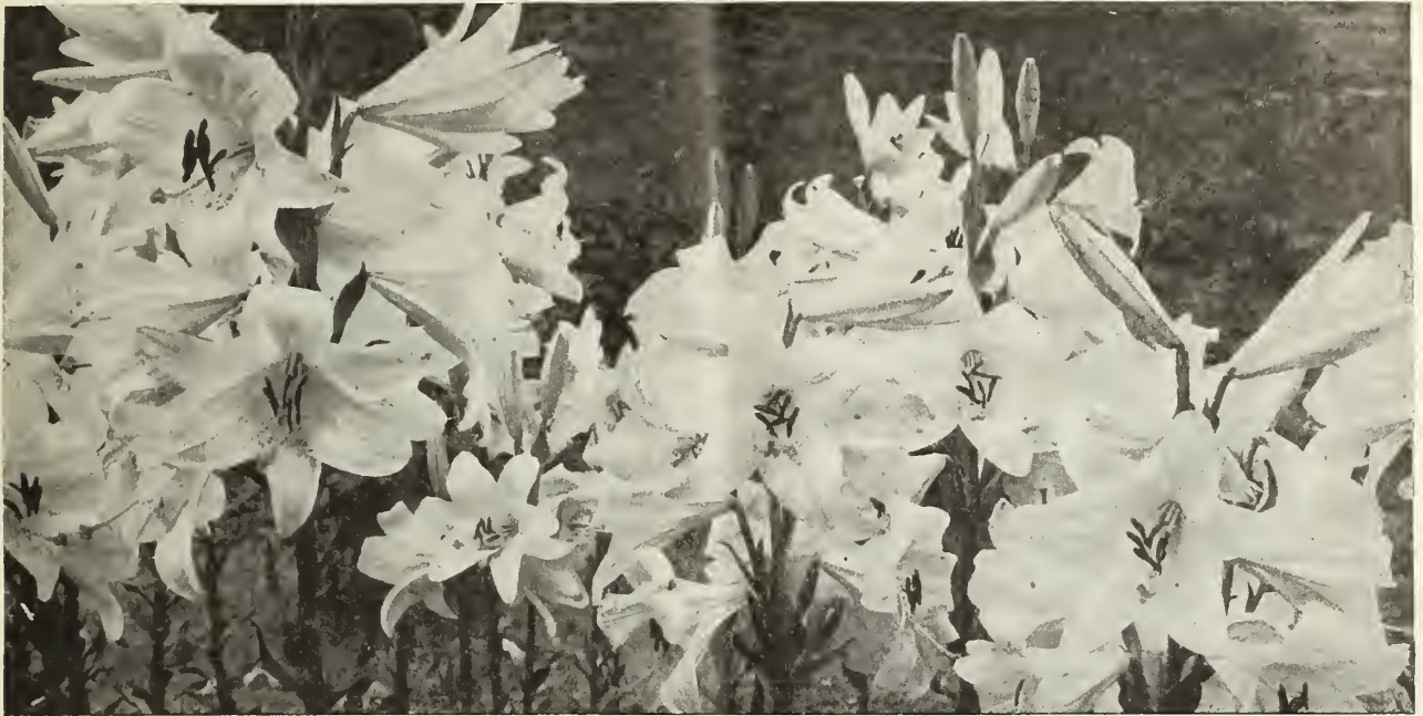
Lilium candidum (Madonna, St. Joseph, or Annunciation Lily). Perfectly hardy; flowers outdoors in June