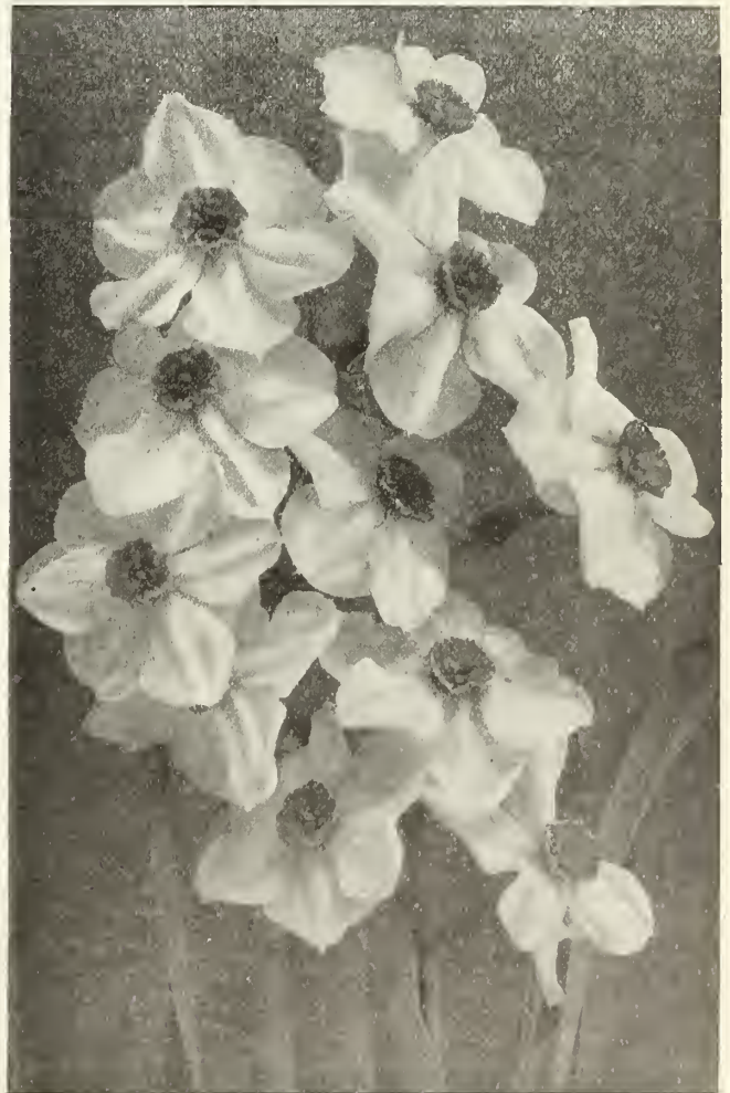
Narcissus Poetaz, Elvira