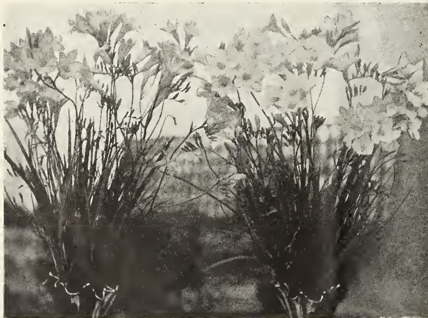
Blue-Lavender Fischer's Freesias

The flowers, which are snowy white, of large size, are borne in great profusion on stems 2 to 2½ feet, which grow upright and stiff; are excellent for cut-flower purposes. First size, 40 cts. per doz., $2.50 per 100, $20 per 1,000. Mammoth bulbs, 60 cts. per doz., $4 per 100, $35 per 1,000.