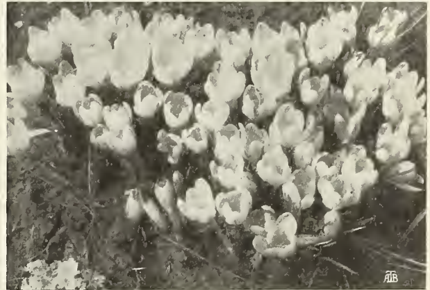
Boddington's Spring-blooming Crocuses

Halli. (Hardy.) (The Magic Lily of Japan.) A perfectly hardy Amaryllis, producing beautiful pink flowers. In early spring attractive green foliage appears which grows until July, when it ripens off and disappears, and anyone not familiar with its habits would think the bulb had died; but about a month later, as if by magic, the flower-stalks spring from the ground to a height of 2 or 3 feet, developing an umbel of large and beautiful lily-shaped flowers, 3 to 4 inches across, and from eight to twelve in number, of a delicate lilac-pink, shaded with clear blue. As the hulk is perfectly hardy without any protection, it can be planted either in the fall or spring. Cover the crowns about 4 inches. Very useful for the hardy border or among shrubbery. Strong, flowering bulbs, 60 cts. each, $6 per doz., $40 per 100.