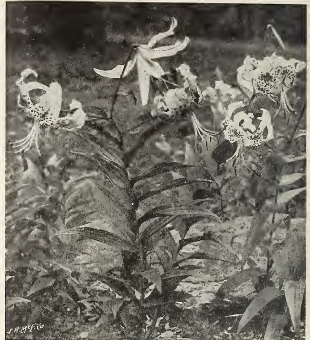
Lilium speciosum magnificum

$1.25 each, $12.00 per doz., $90.00 per 100.