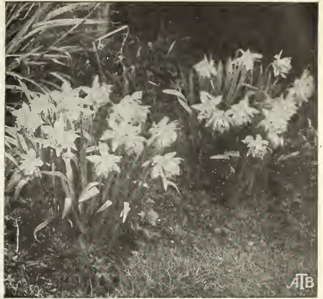
Double Narcissus, Von Sion