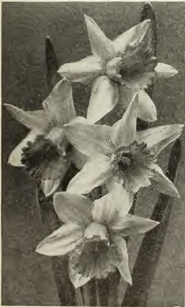
Single Trumpet Narcissus, Emperor