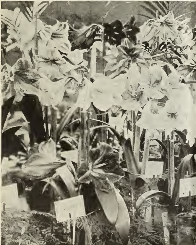
Boddington's Vittata Hybrids Amaryllis New York International Flower Show Strain

DIELYTRA spectabilis (Bleeding-Heart). One of the most ornamental of hardy spring-flowering plants, with elegant green foliage and long, drooping racemes of heart-shaped flowers of deep pink, 25 cts. each, $2.50 per doz., $15 per 100.