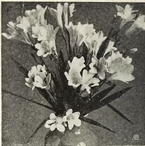
Boddington's Rainbow Freesias

Elliottiana. Flowers large rich, dark golden yellow, leaves beautifully spotted white. $0.50 $5.00 $40.00