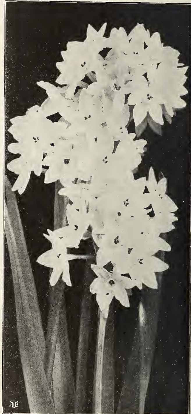
Boddington's Quality Paper-White Narcissus