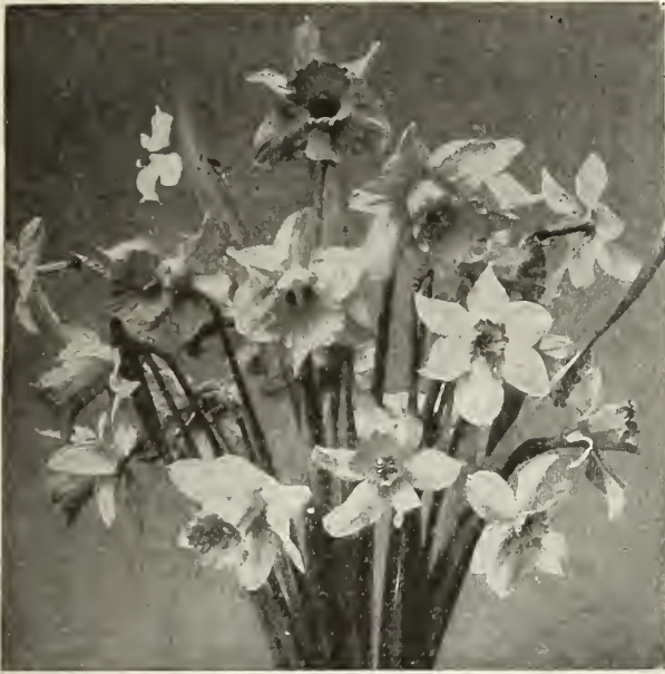
Single Trumpet and Chalice-Cup Narcissus in variety