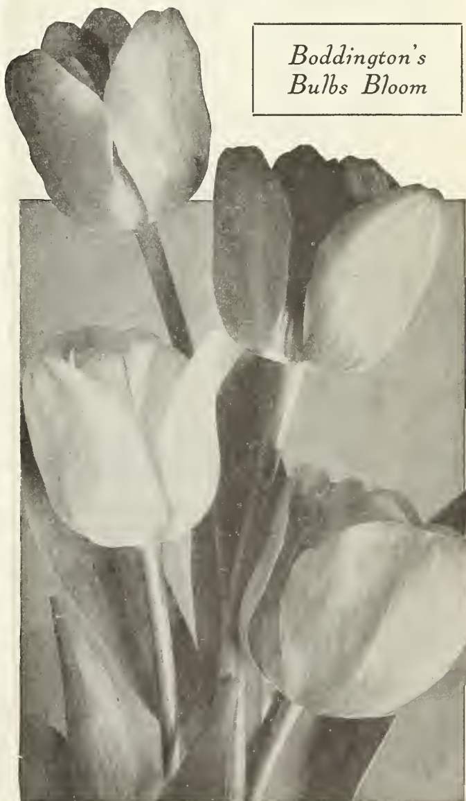
Boddington's Bulbs Bloom

BODDINGTON'S MIXED. 60 cts. per doz., $4 per 100, $35 per 1,000.