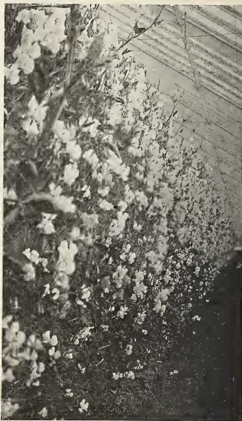
Boddington's Re-selected Winter-Flowering Spencers