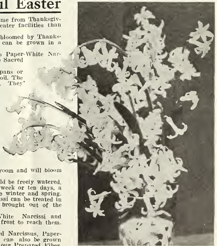
Boddington's French Roman Hyacinths

Culture in Water with Pebbles. Chinese Sacred Narcissus, Paper-White, and all the Polyanthus or Bunch-flowered Narcissi can also be grown in water, with pebbles, in shallow dishes and bowls or in our Prepared Fiber. For particulars of this interesting cultivation see page 1.