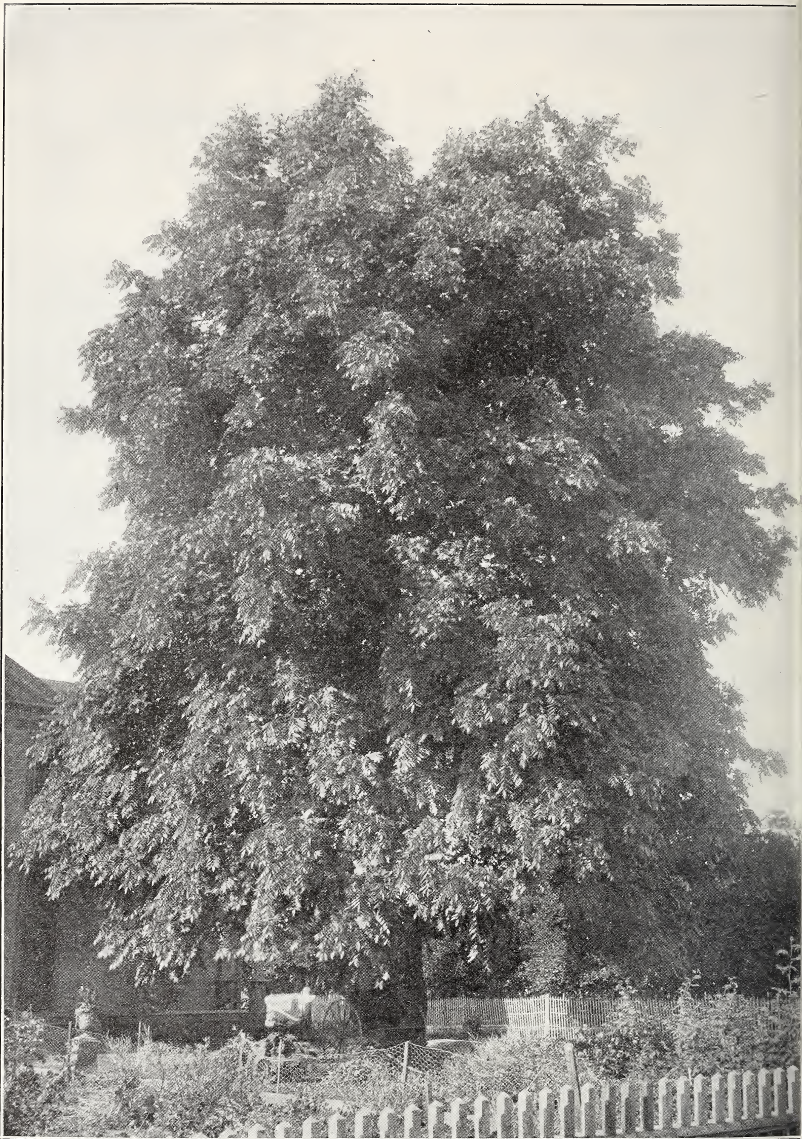
The Burbank Original "ROYAL" Walnut Tree. Twenty-Two Years of Age; Ninety-Six Feet in Height With a Spread of Sixty-Four Feet of Branches and a Girth of Nine Feet Three Inches Six Feet Above the Ground and the Same at Twelve Feet.