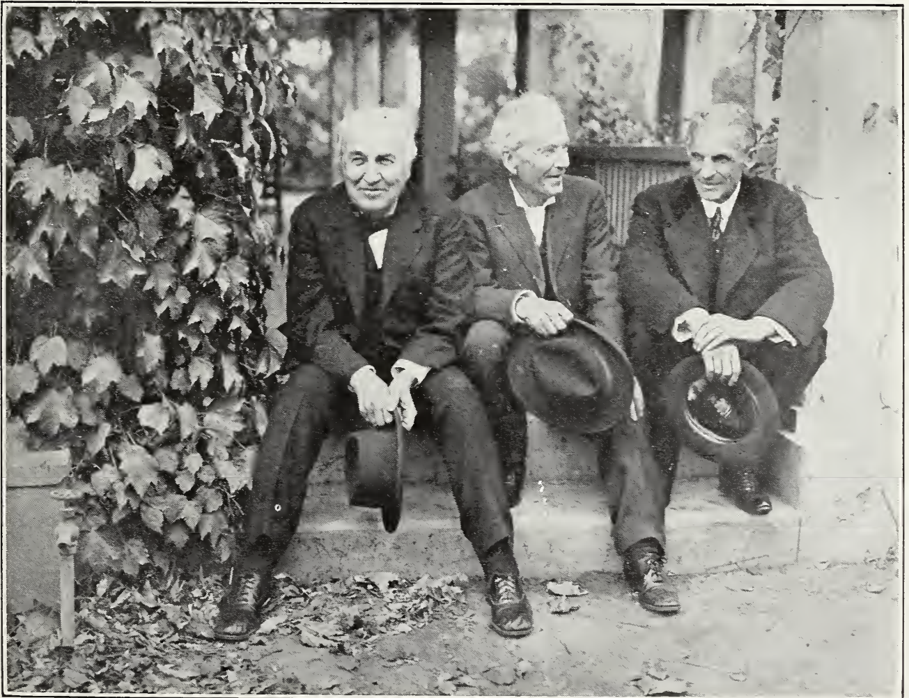
Thomas A. Edison. Luther Burbank, Henry Ford.

A Western farmer sold a stranger a Black Walnut tree which was growing in his pasture for $25, supposing he had made a good bargain. The stranger sold the same tree for $600.