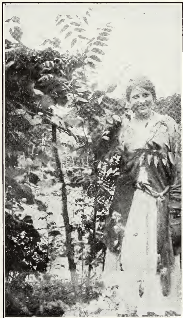
A "ROYAL" Tree Growing in Connecticut; Nine Feet in Height at Fifteen Months of Age. Any Walnut the First Year After Transplanting Grows Only a Few Inches. The Second Season the "ROYAL" Often Grows Six to Ten Feet.

The first "ROYAL" Walnut ever produced by the skill of man was produced on my own grounds and was first named, first described, and first introduced by myself . If you wish to start right it is well to go to the fountain head by purchasing trees or nuts for a grove DIRECT FROM THE ORIGINATOR. It saves trouble later, as the originator of a new tree or plant or product of any kind must feel an interest in its success which is not often shared by others who have something to offer "just as good as Burbank's."