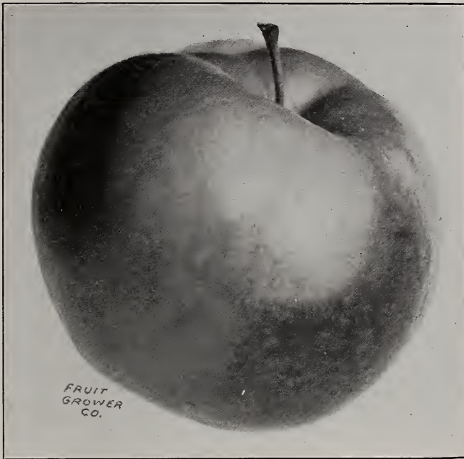
Ever-Bearing Red June Apple.