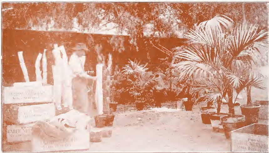
Packing is done quite carefully at the "Exotic Nurseries" It is a point second to none, that the plants should reach you as they leave us. Many nurseries overlook this fact but the "Exotic Nurseries" give it its full importance.

WIGANDIA urens . Very attractive on account of its large, showy leaves and its large, conspicuous blue flowers—a very striking arborescent plant. Balled plants $1.00 and up.