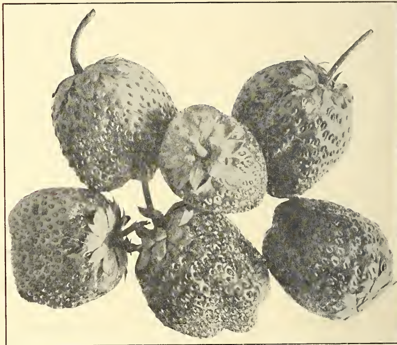
FRANCIS EVERBEARING STRAWBERRES

One of the finest. Fruit large, handsome and attractive. An exhibition berry. A most persistent fruiter. The spring set plants bear so heavily that, as a rule, they make but few new plants, which also bear fine fruit, often before well rooted in the soil, so that unless repeatedly disbudded it makes few plants and mostly rather small.