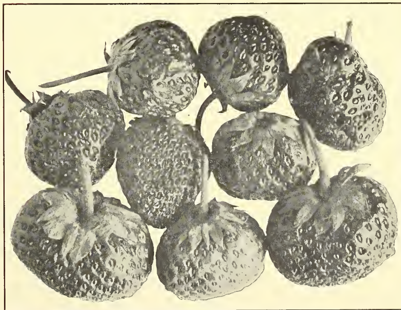
AMERICUS EVERBEARING STRAWBERRIES

Mark out in 3-foot rows. For plants 18 inches in the row, it takes 9,680 plants per acre. Keep plants disbudded until well established, growing good—about July 10—then let fruit at will throughout the summer and fall. Hill culture consists in keeping off all runners, admitting of more thorough cultivation—a stronger root growth, multiple crowns, etc.