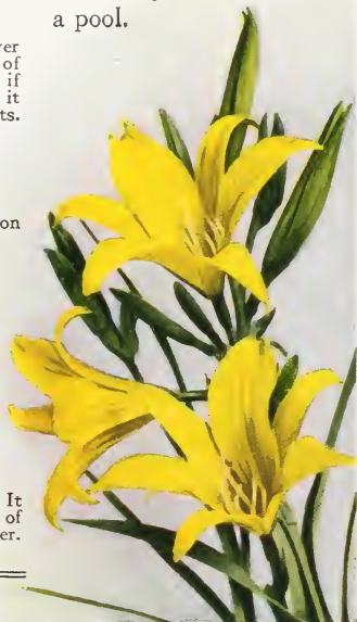
Hemerocallis, Yellow Day Lily

A CHARMING bit of landscape. The flowers do not need the water, except to reflect their charm. Iris seem to fall heir to such a location. Hemerocallis also fits in well, as the picture shows. And Lilies, Lythrum, Foxglove, Veronica—all have virtues worth reflecting. The birds are always the happier for a pool.