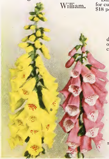
Digitalis , Foxglove

F LOWERS, and plenty of them. Such a border as this never lacks interest, because something is aglow all the while. It's one thing after another the whole season through, and most of the time the array is intensified by a concert of bloom. Perpetual satisfaction and a flower border are synonymous. The flowers in bloom in the illustration are: Digitalis and Sweet William .