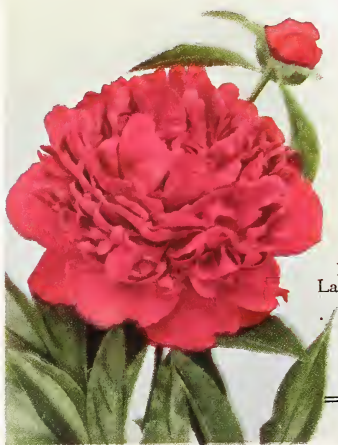
Pæonia, Felix Crousse

T HE spaciousness—the broad restful vista—that is here impressed upon you is not due so much to a large expanse of ground as to the art of good landscaping. Want us to help you apply some of this art to your grounds? Say the word and you shall have our coöperation. That's what we are here for and nothing would give us more pleasure. Why not achieve the highest beauty of which your grounds are capable? If you are not too far away, we can have a representative call. Otherwise write us fully.