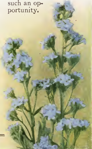
Anchusa italica, Dropmore

A MOST attractive garden. Anyone can have a garden just as lovely. It's the flowers that make it beautiful. They give beauty for the sunshine, fragrance for the dew, and a profusion of each for the rain. They fill the atmosphere with gratitude. Have you a path? Make it a beautiful path—a path that you and your friends will delight to stroll down. If we can help you in selecting the flowers or arranging them, it will be a real pleasure for us to do so. We are anxious for just such an opportunity.