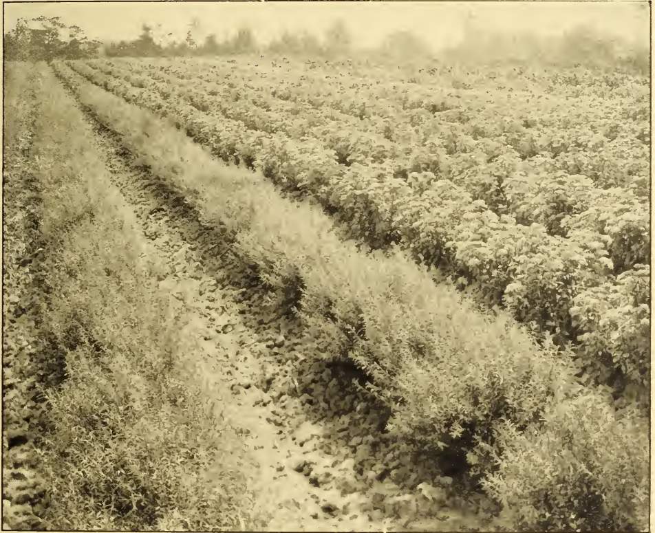
Spirea Thunbergii and Spirea Anthony Waterer. Very thrifty, bushy plants. Photographed July 16th.