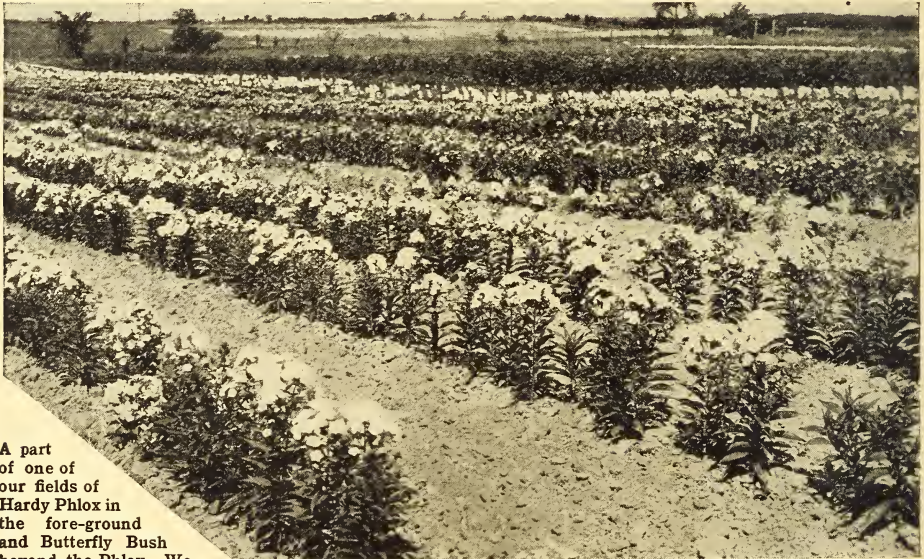
A part of one of our fields of Hardy Phlox in the fore-ground and Butterfly Bush beyond the Phlox. We grow from 125,000 to 150,000 Phlox annually, all strong field-grown plants.

Should not be compared in value with the small plants from two-inch pots which are sold so cheaply. These are one season older.