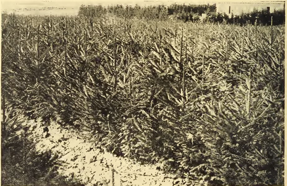
Norway Spruces ( Abies Excelsa ) in the J. & P nurseries, a clean, thrifty young block just to be dug from for the first time. Photographed August 15, 1918.

We have unwittingly allowed our assortment of Evergreens to become somewhat depleted, as a result of the extraordinary demand during the last two years. However, the varieties offered below can be furnished in thrifty, shapely, well furnished stock, all of which has been transplanted at least twice, and much of it has been root-pruned in addition.