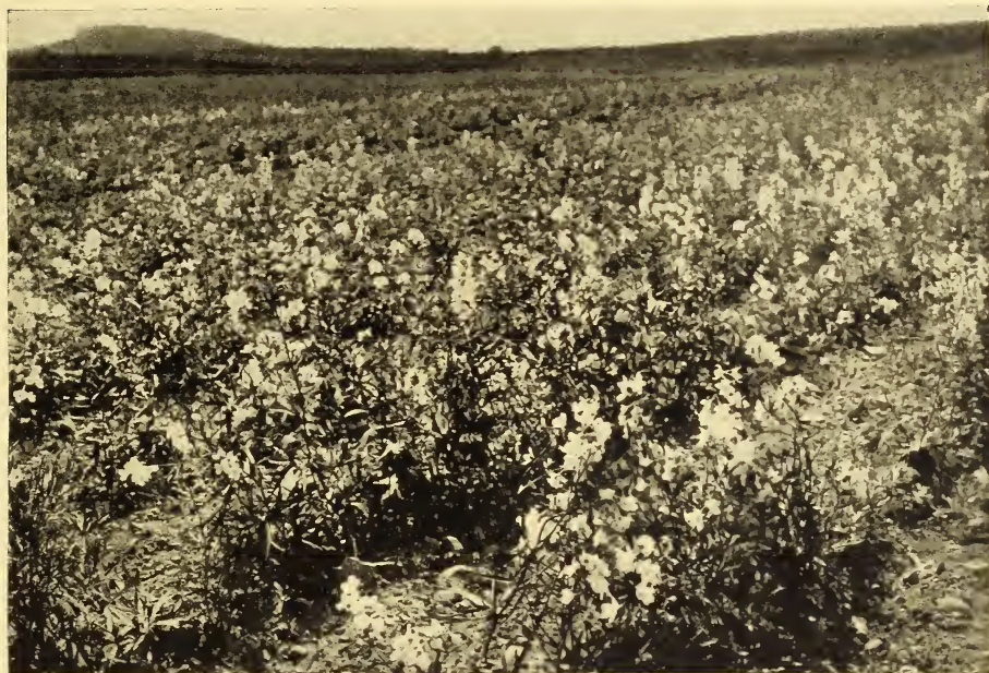
A field of Delphineums (Larkspur) in our nurseries, about 30,000 in this block. Photographed August 15, 1918.