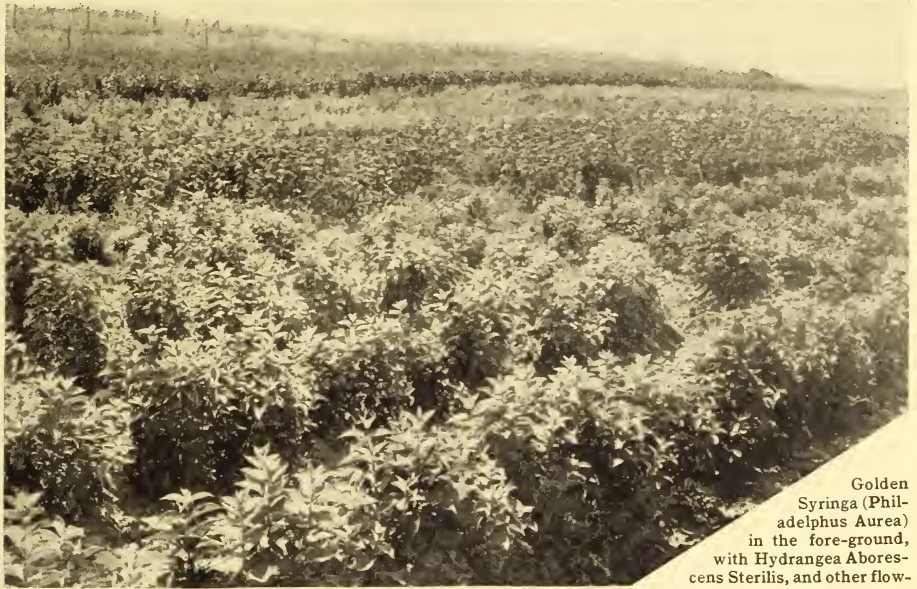
Golden Syringa (Philadelphus Aurea) in the fore-ground, with Hydrangea Aborecens Sterilis, and other flowering shrubs, beyond.