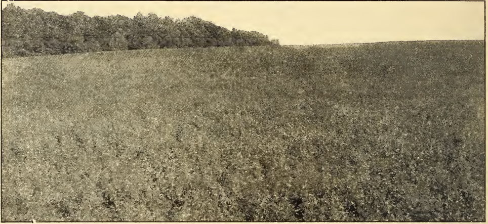
A field of alfalfa soon to be plowed under for keeping up the supply of nitrogen and humus in our soil.

There is a large canning factory located here for which we annually grow a considerable acreage of Peas. We seed Alfalfa along with the Peas and almost never fail to secure a good