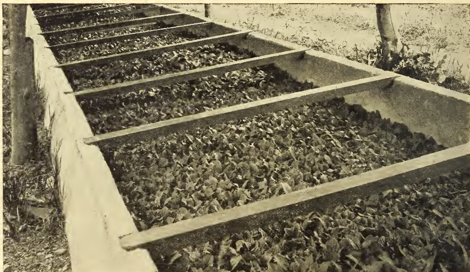
A snapshot of one of the cold frames in our propagating department. This is filled with cuttings of the Hortensia varieties of Hydrangeas, all rooted and ready for potting, nearly a 100% stand. Photographed August 9, 1918.