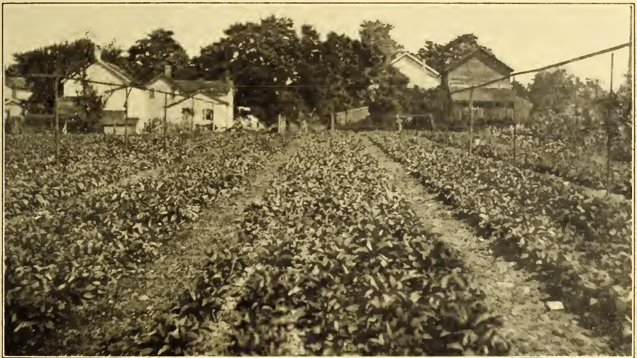
This is ONE of our blocks of pot-grown Hydrangeas for this season. There are 20,000 in this lot, all in 6-inch pots, and as many more in another block nearby.

For this season we have the largest and certainly one of the very best lots of Hydrangeas that we have ever grown. We have discontinued growing them under shade. The plants have all been plunged in the open ground without protection of any kind. While the branches are not as long in growth as when grown under some shade, they are stocky, sturdy plants and are well ripened. From present prospects they will be well set with buds and ready for shipment the middle or latter part of September. In the present scarcity of imported plants of various kinds for forcing, we have no hesitation in recommending our customers to buy good large quantities of these Hydrangeas. We have the utmost confidence that they will both produce good results and find a ready sale.