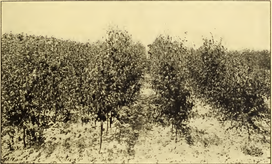
Cut-Leaved Weeping Birch as grown in the J. & P. Nurseries. Note the almost perfect "stand" of this difficult-to-propagate tree.