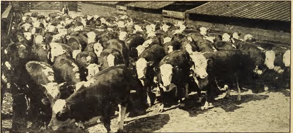
Here is part of the herd of steers such as we winter each season. We shall have 250 more of them this fall and winter.

crop of Alfalfa. The Peas give us a fair income from the land the first season (and are good nitrogen gatherers as well). The second season we cut one, or sometimes two, crops of Alfalfa, plowing under the second or third crop to fertilize and put humus in the soil. The alfalfa hay, together with corn ensilage, of which we have over fifty acres each summer, enable us to winter