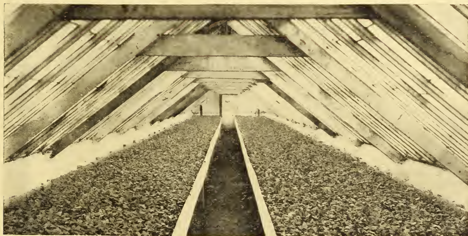
One of our greenhouses filled with Clematis Jackmanii. There are 18,000 plants in this house and there are four other houses of the same size, similarly filled. They are grown one season in pots in the greenhouses and one season in the field. We are probably the largest growers of large flowering varieties of Clematis in the world. Photographed August 9, 1918.

We have always been very successful in growing Clematis and they have been a leading specialty with us for a great many years. We think we may safely say that we grow and sell more Clematis than any other nursery in this country, or, indeed, in the world.