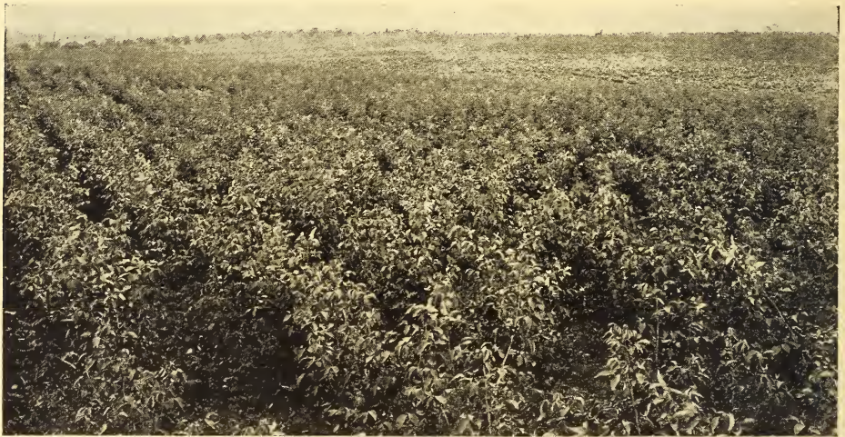
Roses, Roses, Roses, as far as one can see. Magna Charta in the fore-ground and Baby Ramblers just beyond them. This field represents a planting of 600,000 Manetti stocks, budded in Summer of 1917. Jack Frost got some of them last winter, but there are "several" left. Photographed August 9, 1918.