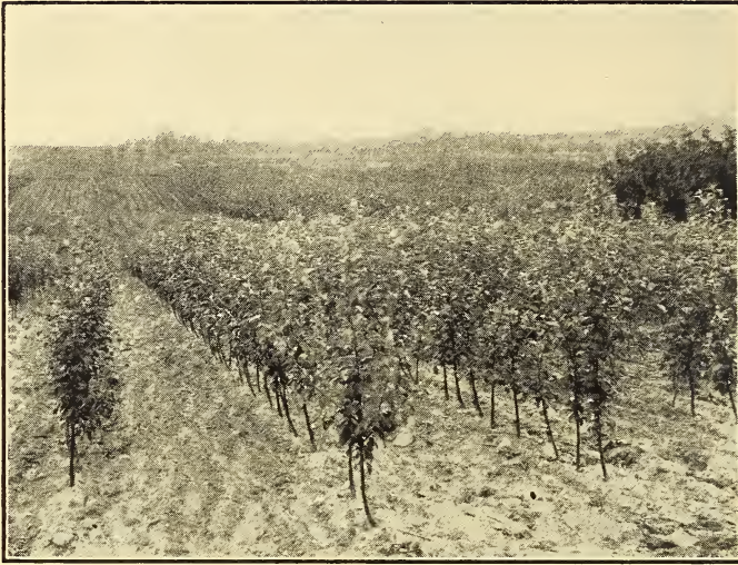
Block of Dwarf Apples in the J. & P. Nurseries, two years old.