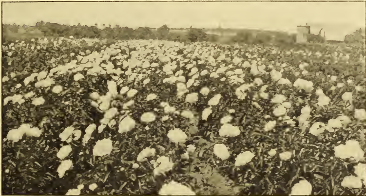
One of Our Peony Blocks.

Our Peonies are strong divisions with 3-5 eyes and plenty of roots.