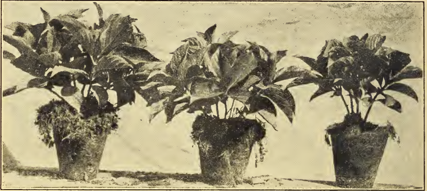
SAMPLE PLANTS OF OUR HYDRANGEAS

SOUVENIR DE MME. CHAUTARD , fine clear pink. One of the very best all around sorts, early and very free flowering.