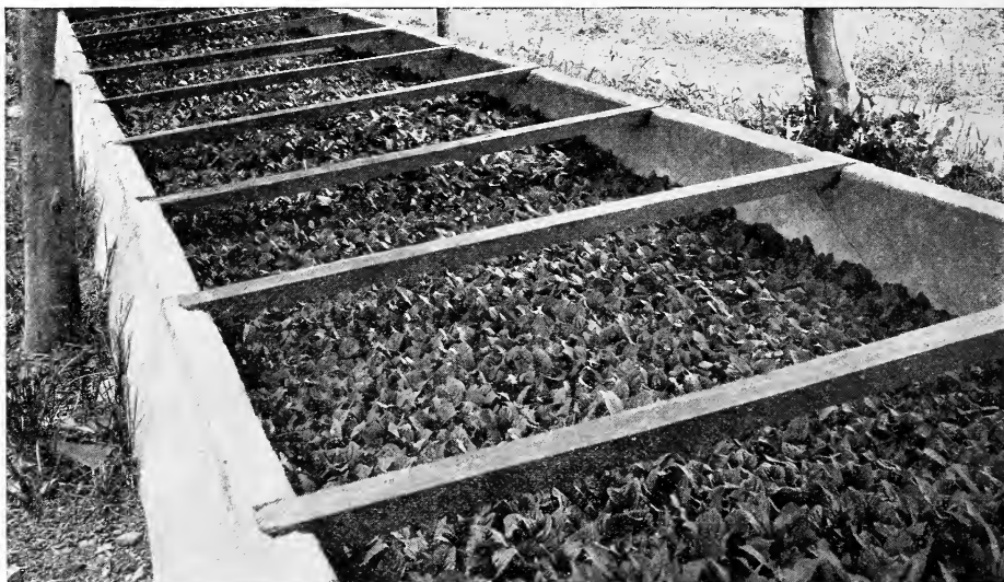
A snapshot of one of the cold frames in our propagating department. This is filled with cuttings of the Hortensis varieties of Hydrangeas, all rooted and ready for potting, nearly a 100% stand. Photographed August 9, 1918.