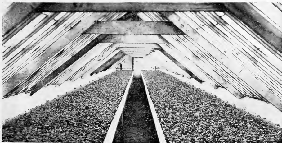
One of our greenhouses filled with Clematis Jackmanii. There are 18,000 plants in this house and there are four other houses of the same size, similarly filled. They are grown one season in pots in the greenhouses and one season in the field. We are probably the largest growers of large flowering varieties of Clematis in the world. Photographed August 9, 1918.

We have always been very successful in growing Clematis and they have been a leading specialty with us for a great many years. We think we may safely say that we grow and sell more Clematis than any other nursery in this country, or, indeed, in the world.