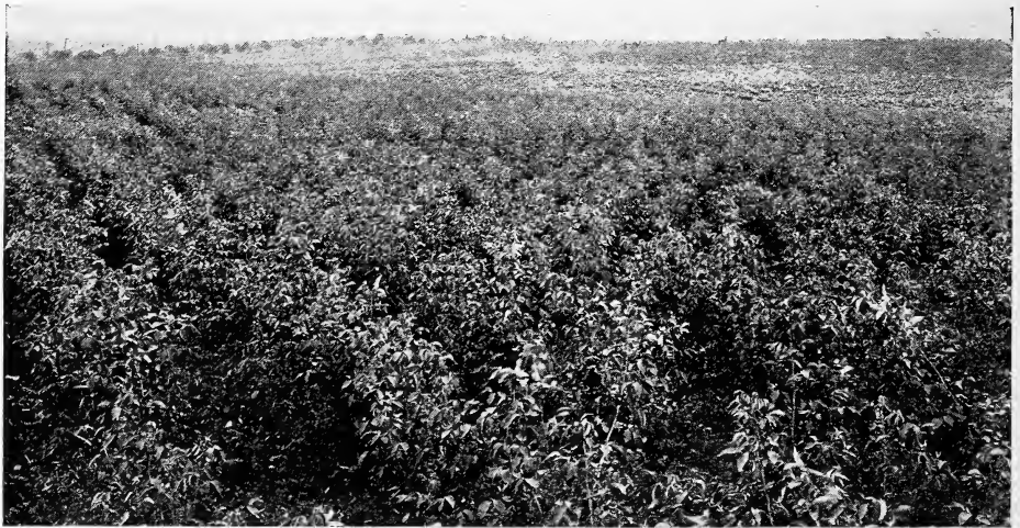
Roses, Roses, Roses, as far as one can see. Magna Charta in the fore-ground and Baby Ramblers just beyond them. This field represents a planting of 600,000 Manetti stocks, budded in Summer of 1917. Jack Frost got some of them last winter, but there are "several" left. Photographed August 9, 1918.