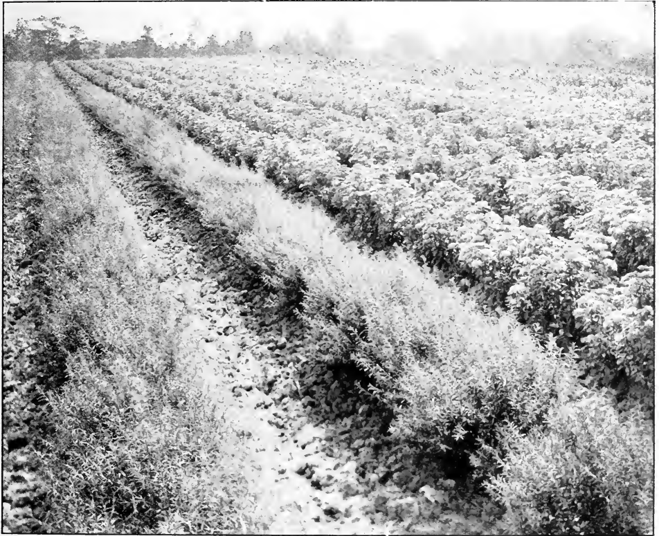
Spirea Thunbergii and Spirea Anthony Waterer. Very thrifty, bushy plants. Photographed July 16th.