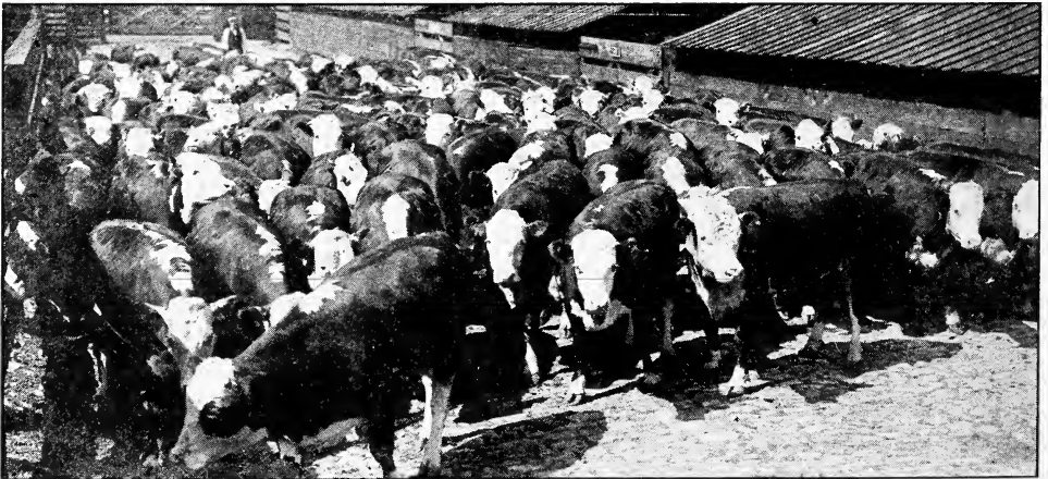
Here is part of the herd of steers such as we winter each season. We shall have 250 more of them this fall and winter.

crop of Alfalfa. The Peas give us a fair income from the land the first season (and are good nitrogen gatherers as well). The second season we cut one, or sometimes two, crops of Alfalfa, plowing under the second or third crop to fertilize and put humus in the soil. The alfalfa hay, together with corn ensilage, of which we have over fifty acres each summer, enable us to winter