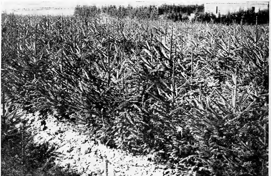
Norway Spruces (Abies Excelsa) in the J. & P nurseries, a clean, thrifty young block just to be dug from for the first time. Photographed August 15, 1918.

We have unwittingly allowed our assortment of Evergreens to become somewhat depleted, as a result of the extraordinary demand during the last two years. However, the varieties offered below can be furnished in thrifty, shapely, well furnished stock, all of which has been transplanted at least twice, and much of it has been root-pruned in addition.