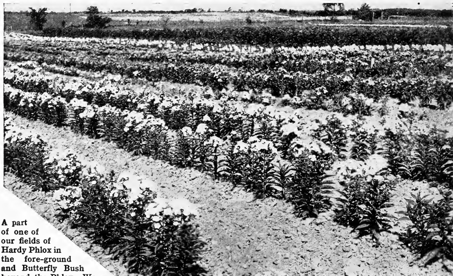
A part of one of our fields of Hardy Phlox in the fore-ground and Butterfly Bush beyond the Phlox. We grow from 125,000 to 150,000 Phlox annually, all strong field-grown plants.

Should not be compared in value with the small plants from two-inch pots which are sold so cheaply. These are one season older.