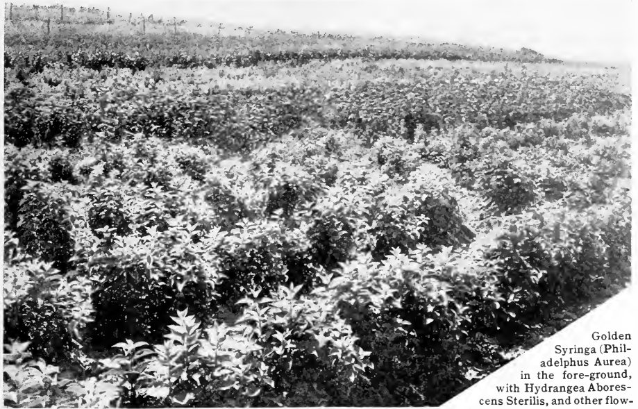
Golden Syringa (Philadelphus Aurea) in the fore-ground, with Hydrangea Aborescens Sterilis, and other flowering shrubs, beyond.