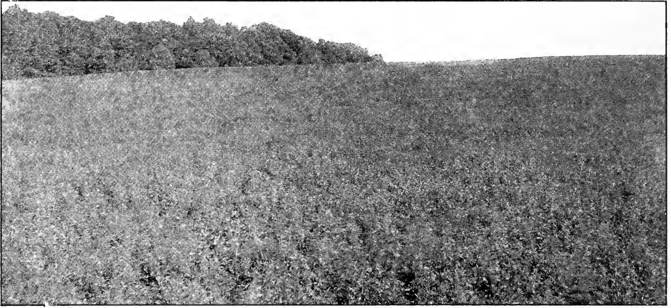
A field of alfalfa soon to be plowed under for keeping up the supply of nitrogen and humus in our soil.

There is a large canning factory located here for which we annually grow a considerable acreage of Peas. We seed Alfalfa along with the Peas and almost never fail to secure a good