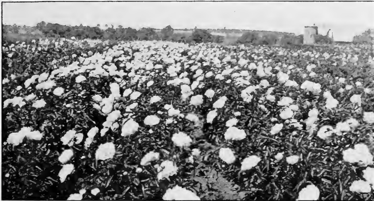
One of Our Peony Blocks.

Our Peonies are strong divisions with 3-5 eyes and plenty of roots.