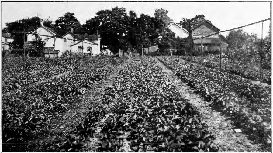
This is ONE of our blocks of pot-grown Hydrangeas for this season. There are 20,000 in this lot, all in 6-inch pots, and as many more in another block nearby.

For this season we have the largest and certainly one of the very best lots of Hydrangeas that we have ever grown. We have discontinued growing them under shade. The plants have all been plunged in the open ground without protection of any kind. While the branches are not as long in growth as when grown under some shade, they are stocky, sturdy plants and are well ripened. From present prospects they will be well set with buds and ready for shipment the middle or latter part of September. In the present scarcity of imported plants of various kinds for forcing, we have no hesitation in recommending our customers to buy good large quantities of these Hydrangeas. We have the utmost confidence that they will both produce good results and find a ready sale.