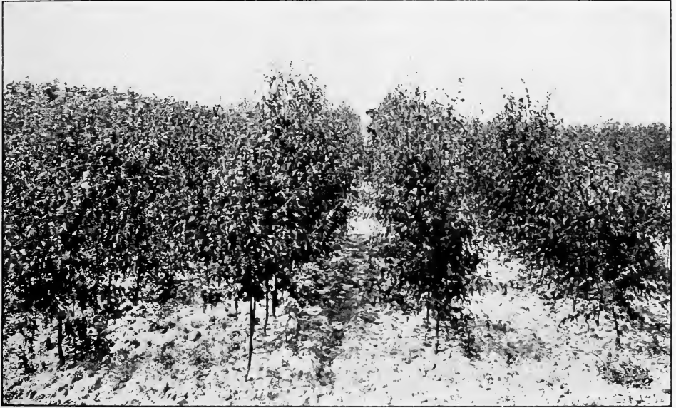
Cut-Leaved Weeping Birch as grown in the J. & P. Nurseries. Note the almost perfect "stand" of this difficult-to-propagate tree.