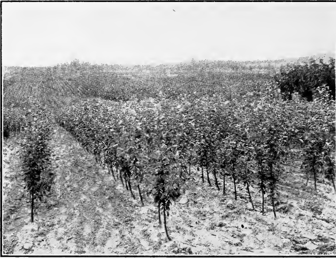
Block of Dwarf Apples in the J. &amp; P. Nurseries, two years old.