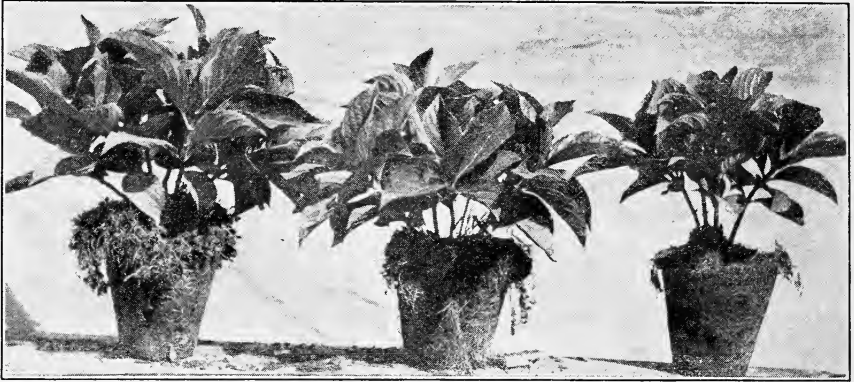
SAMPLE PLANTS OF OUR HYDRANGEAS

SOUVENIR DE MME. CHAUTARD , fine clear pink. One of the very best all around sorts, early and very free flowering.