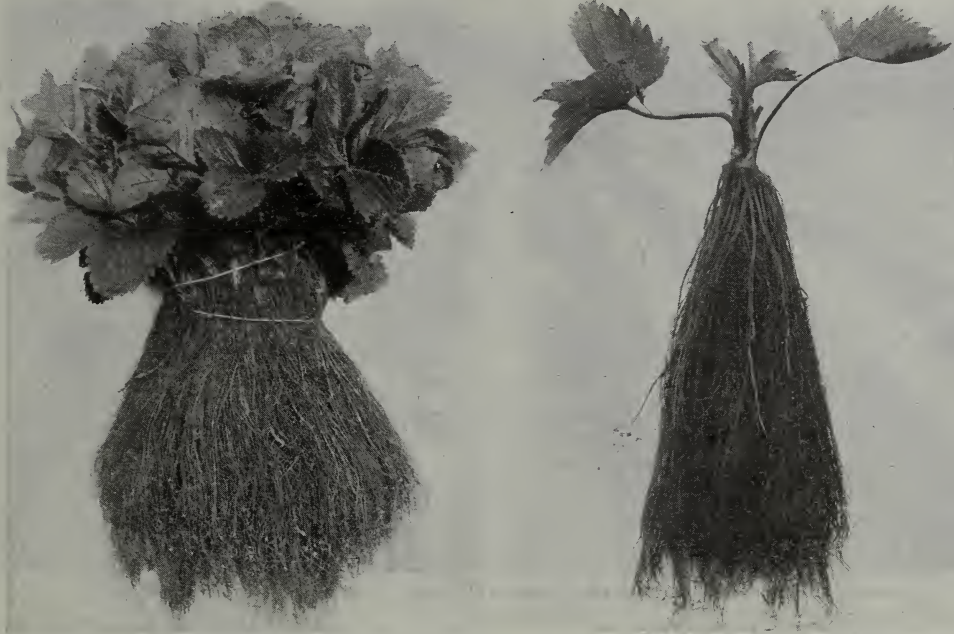
Reproduction of photo of our Strawberry Plants. Note the strong root system and healthy foliage. Plants like these are pretty good crop insurance and will start you to success.