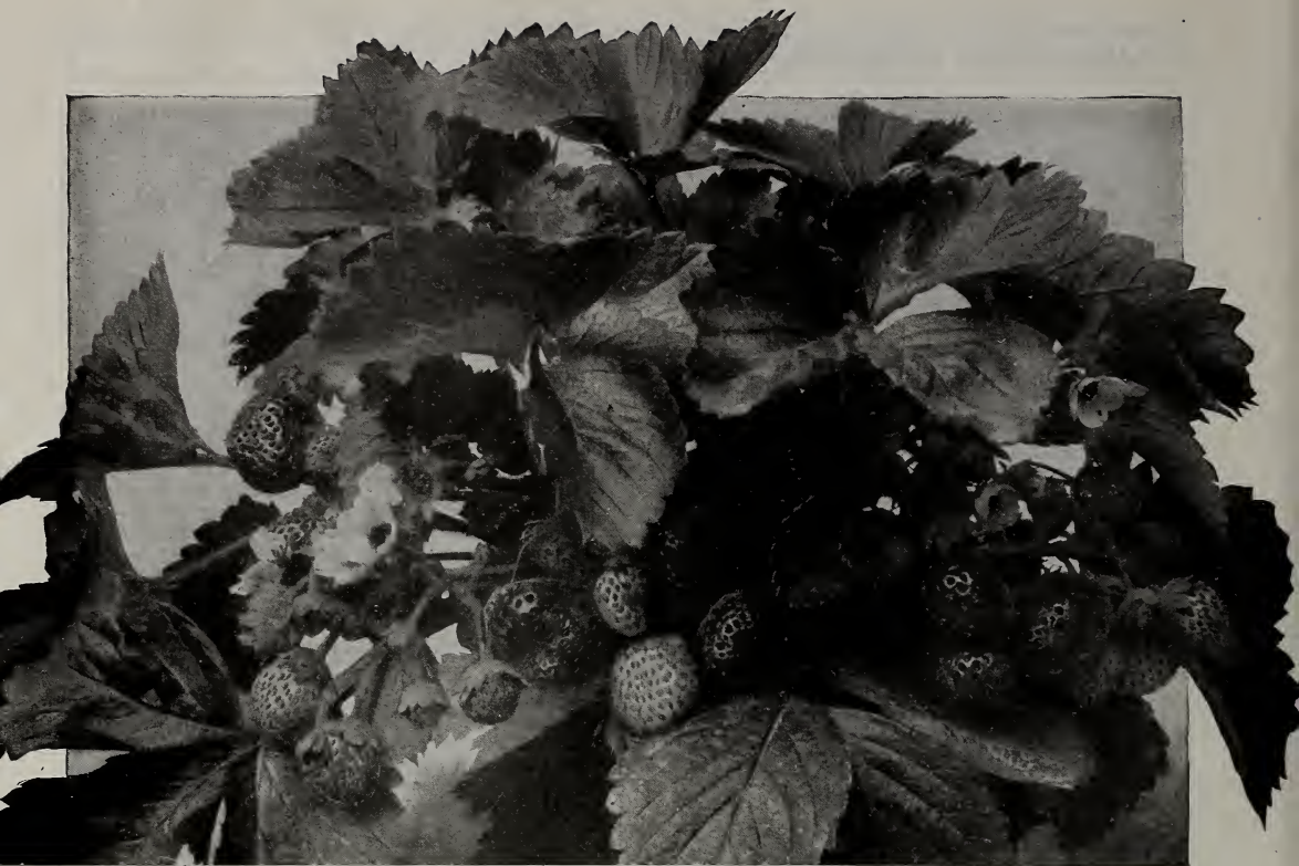
A Thoroughbred Progressive Plant in Full Fruit.