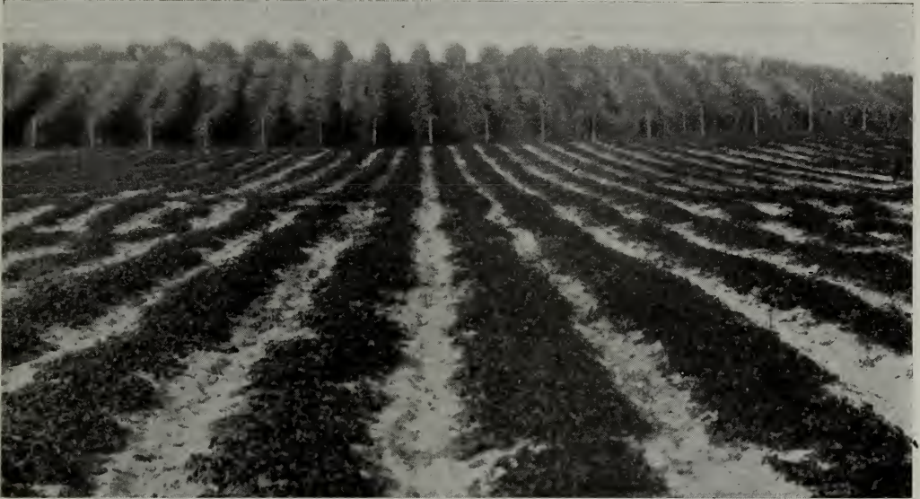
A block of our Progressive Plants. Please note that the plants have plenty of room to develop. Every plant is large and strong.