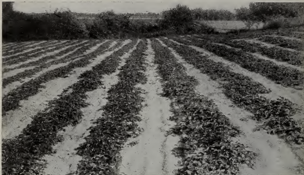
A corner of one of our fields from which plants will be dug to supply our customers this year.