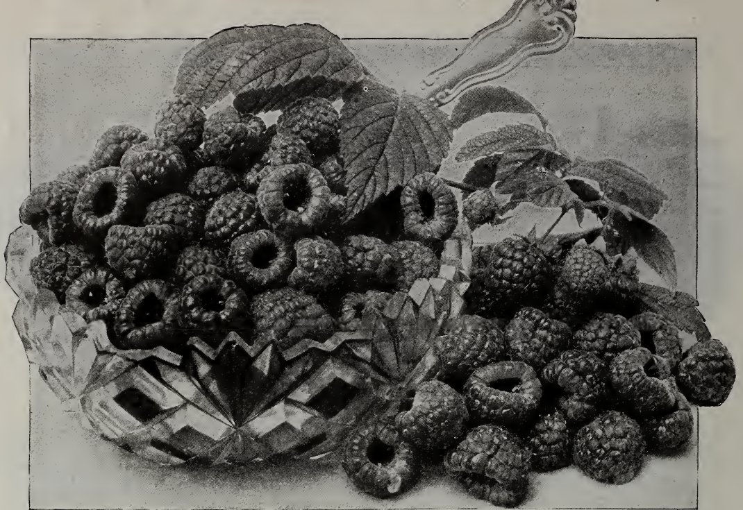
Cuthbert Red Raspberries.