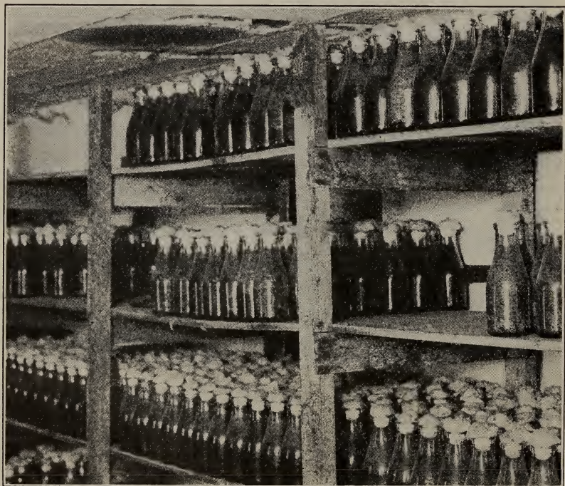
BOTTLE SPAWN—A section of the concrete growing rooms in the laboratories of the American Spawn Company, St. Paul, Minn.

Preservation of varieties ; spores of desirable varieties may be safely stored away by the manufacturer and kept for future use,