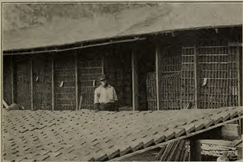
BRICK SPAWN—A section of the drying sheds at the plant of the American Spawn Company, St. Paul, Minn.

4. Mushroom Spawn and its Manufacture. Spawn, as the term is used commercially, includes the spawn proper, or mycelium , and its carrying medium, in brick , cake or other form, in which the