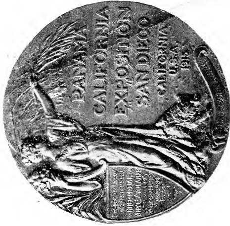
GOLD MEDAL San Diego, California, 1915-16