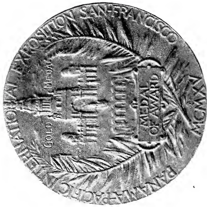
GOLD MEDAL San Francisco World Exhibit, 1915

And many other Gold and Silver Medals where ever our Sweet Peas have been exhibited for competition.