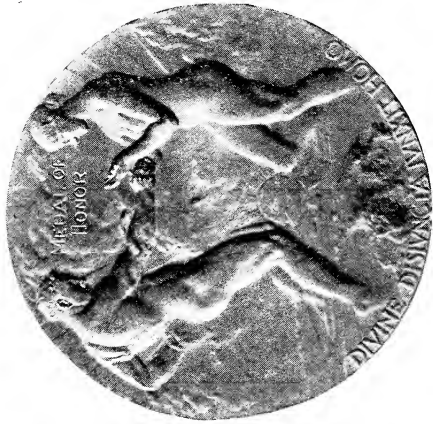
GOLD MEDAL OF HONOR San Francisco World Exhibit, 1915