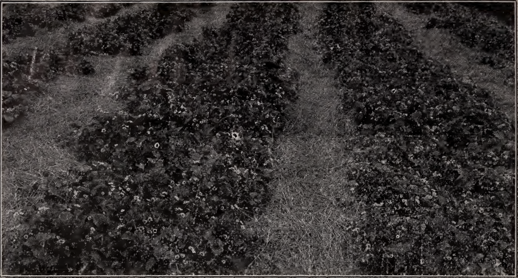
MINNESOTA NO. 3 STRAWBERRY PLANTS IN FULL BLOOM (NOTE PROLIFIC GROWTH OF PLANTS AND BLOSSOMS)

This wonderful new Strawberry was originated at the Minnesota State Fruit Breeding Farm a few years ago and is now conceded to be the best June bearing strawberry.