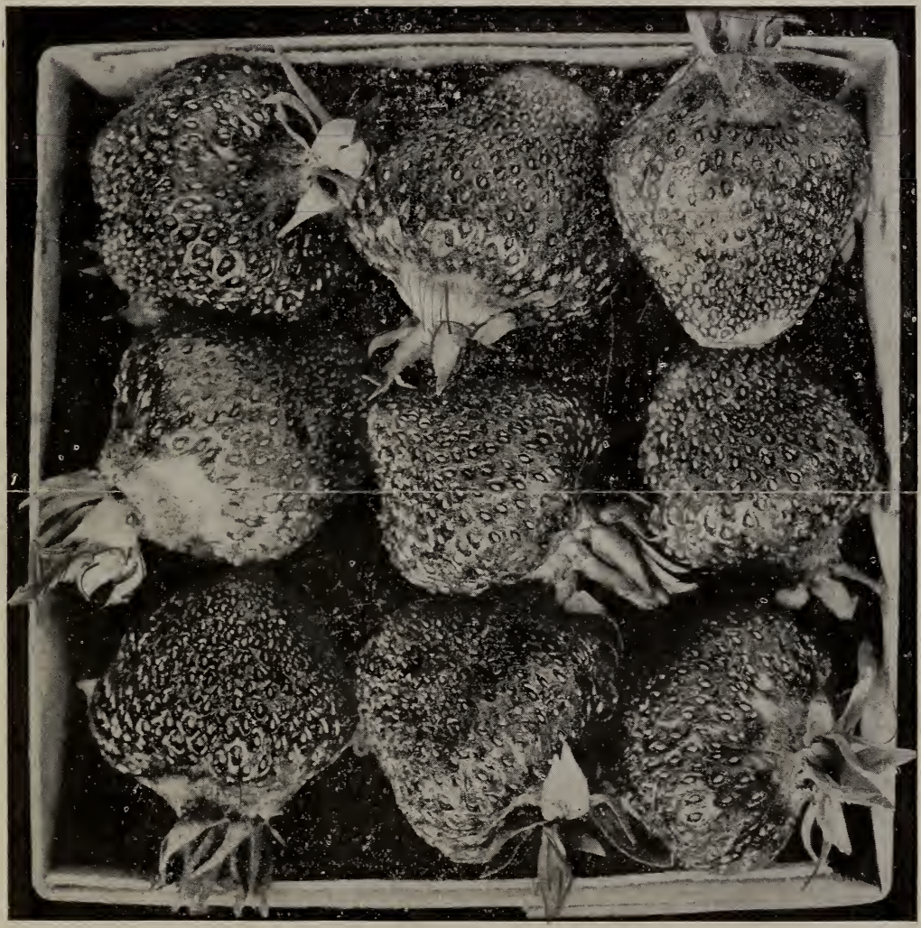
Top Layer of a quart box of Minnesota No. 3 Strawberries (Actual Size)